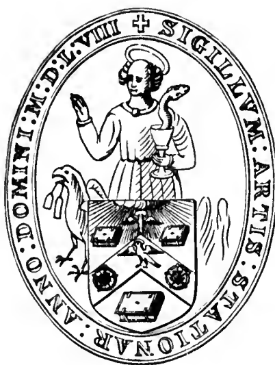
A FACSIMILE OF THE ORIGINAL SEAL OF THE COMPANY, FROM THE TRICKING IN THE COLLEGE OF ARMS, LONDON.