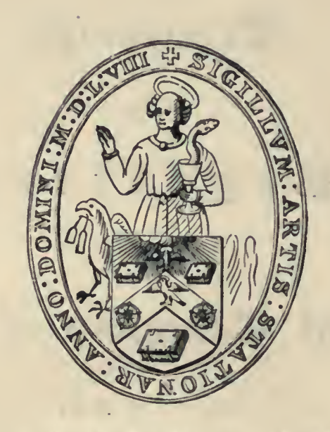
A FACSIMILE OF THE ORIGINAL SEAL OF THE COMPANY. FROM THE TRICKING IN THE COLLEGE OF ARMS, LONDON.