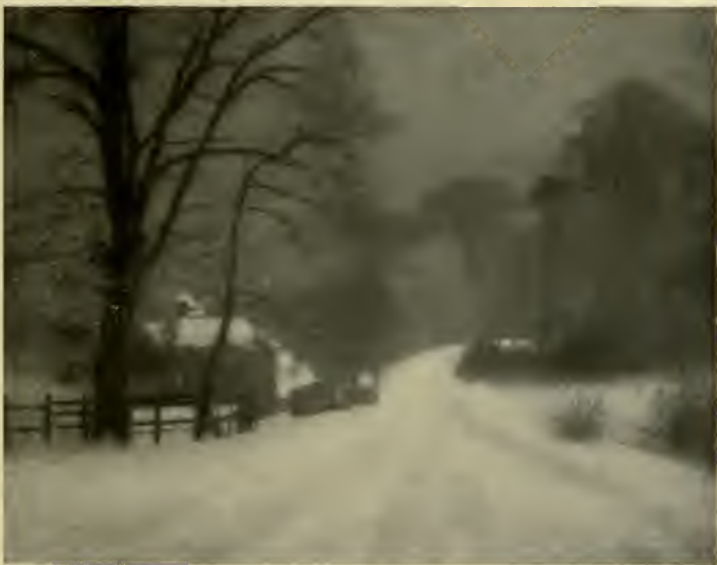
A WINTRY SCENE.