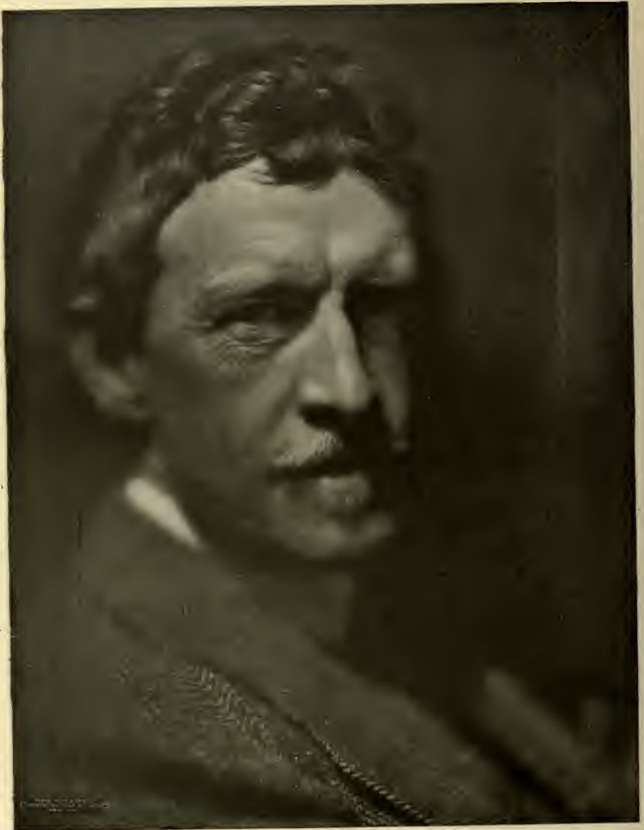
PORTRAIT OF FREDERICK McMONNIES.