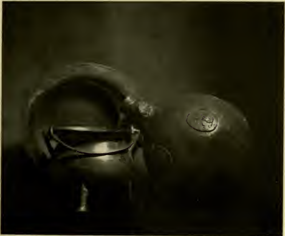
FROM OLD TIMES.