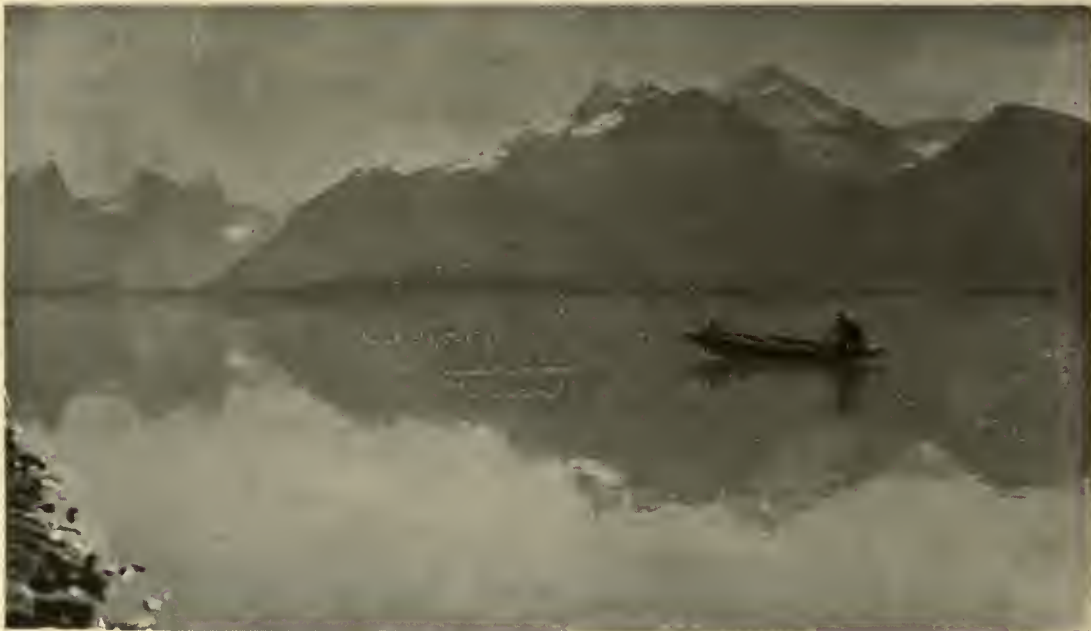
IN THE HEART OF THE ROCKY MOUNTAINS. BY R. EICKEMEYER (NEW YORK, U.S.A.).