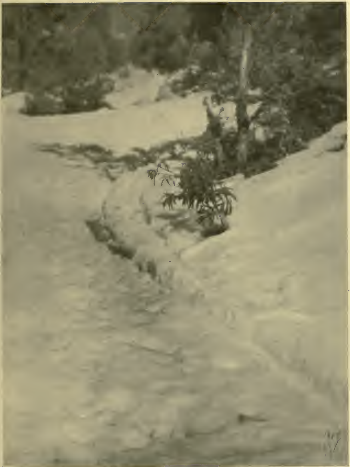
THE TURN OF THE ROAD.