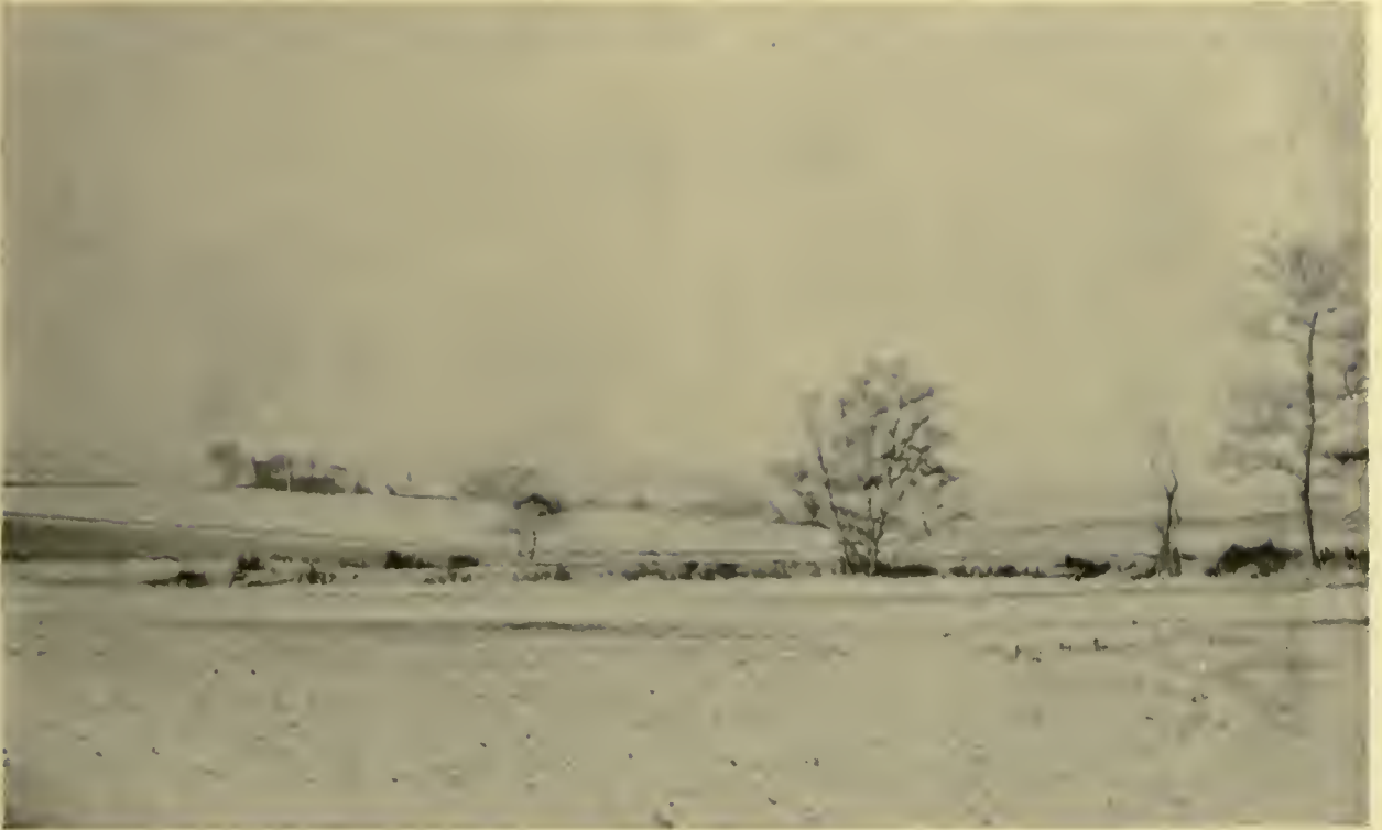
"THE SILENT SNOW POSSESSED THE EARTH."