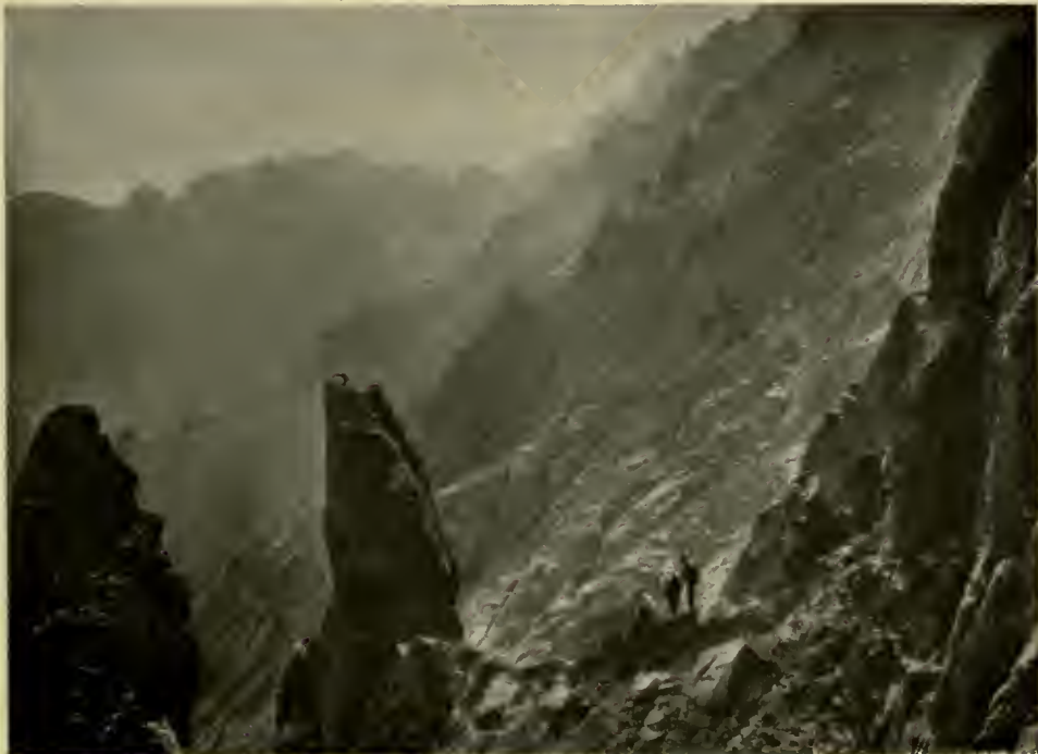
SIERRA DE GRADA, SPAIN.