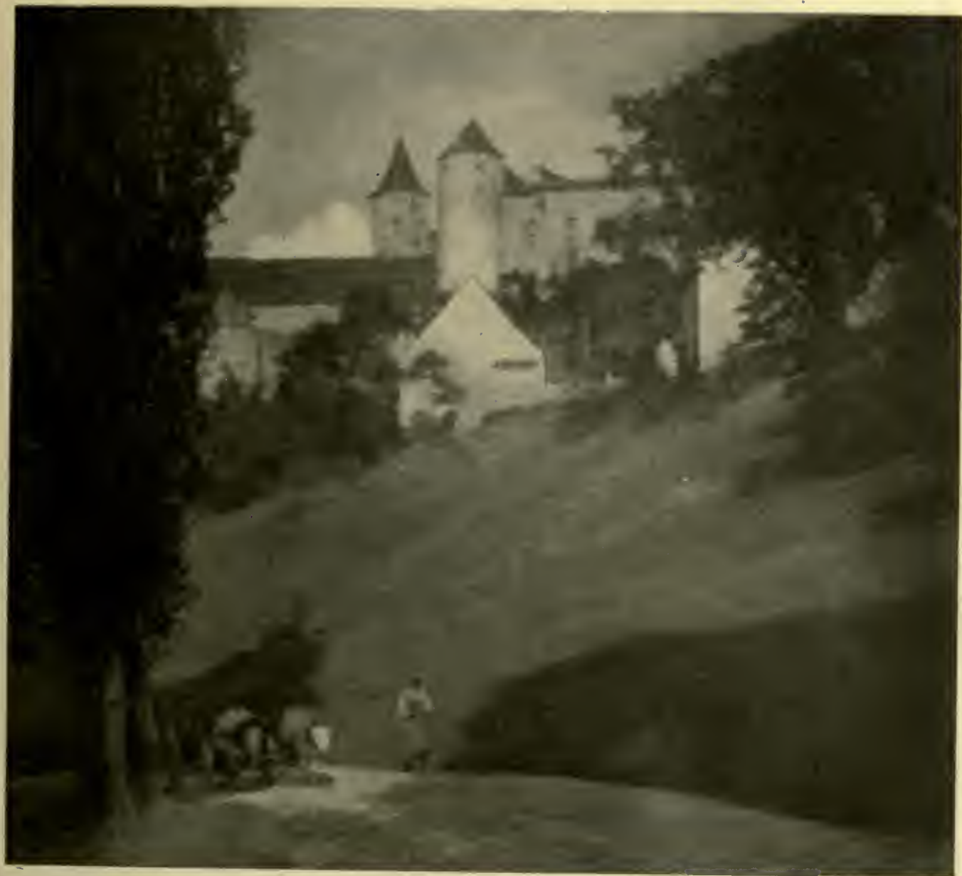
THE CASTLE OF HARBURG.