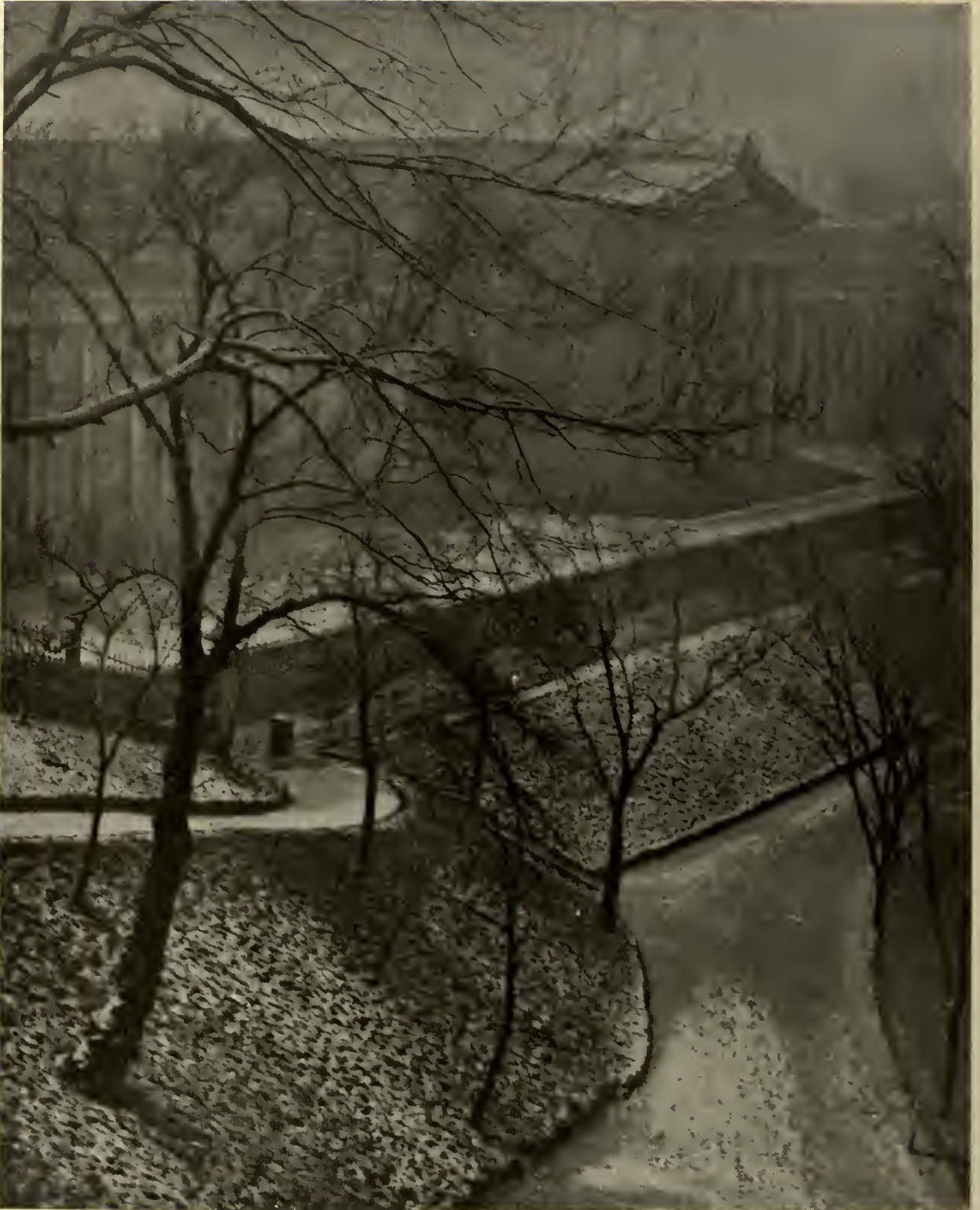
EDINBURGH IN WINTER—THE THAW.