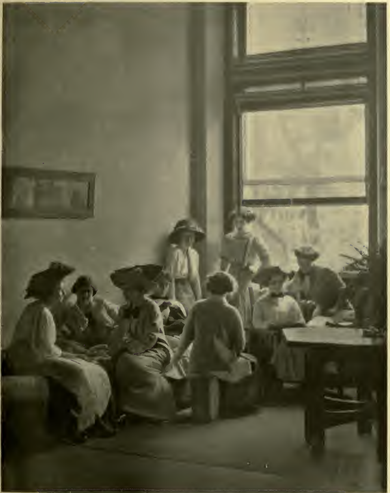
THE REST HOUR.

By CLARENCE H. WHITE (New York, U.S.A.).