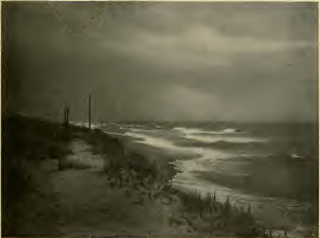
THE CRUEL CRAWLING FOAM.