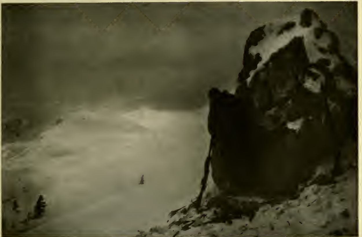
THE SCOUT (A VIEW OF THE WAR IN THE ALPS).