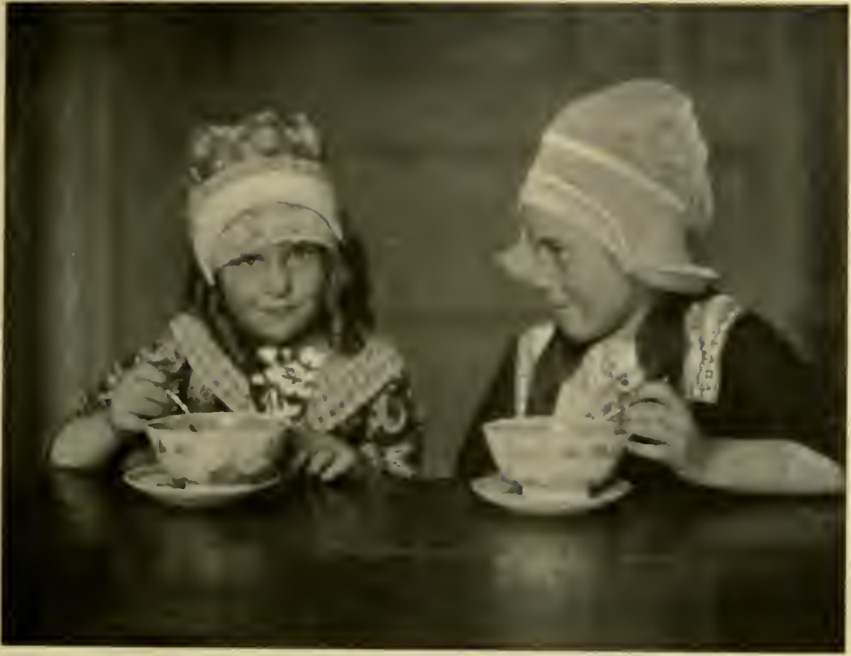
PORTRAITS OF CHILDREN IN DUTCH COSTUME. By FRANCESCA BOSTWICK (CONNECTICUT, U.S.A.).