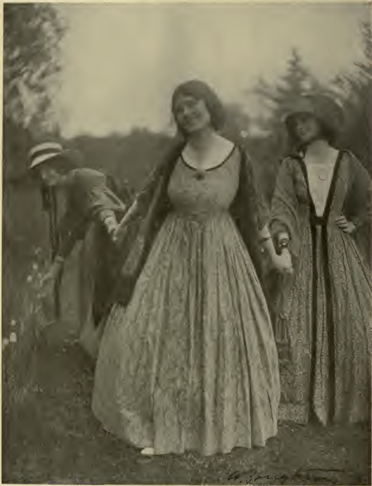
THE GARDEN PATH.

By Miss ALICE BOUGHTON (NEW YORK, U.S.A.).