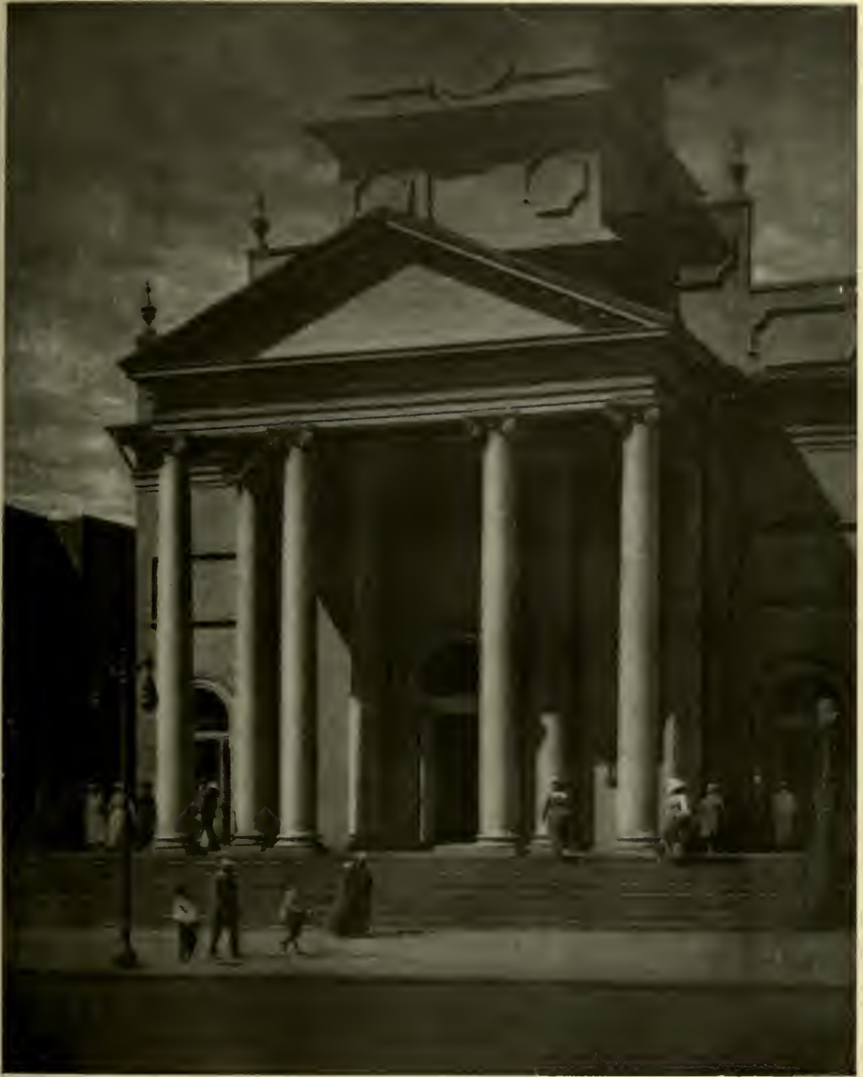
A COLONIAL CHURCH.