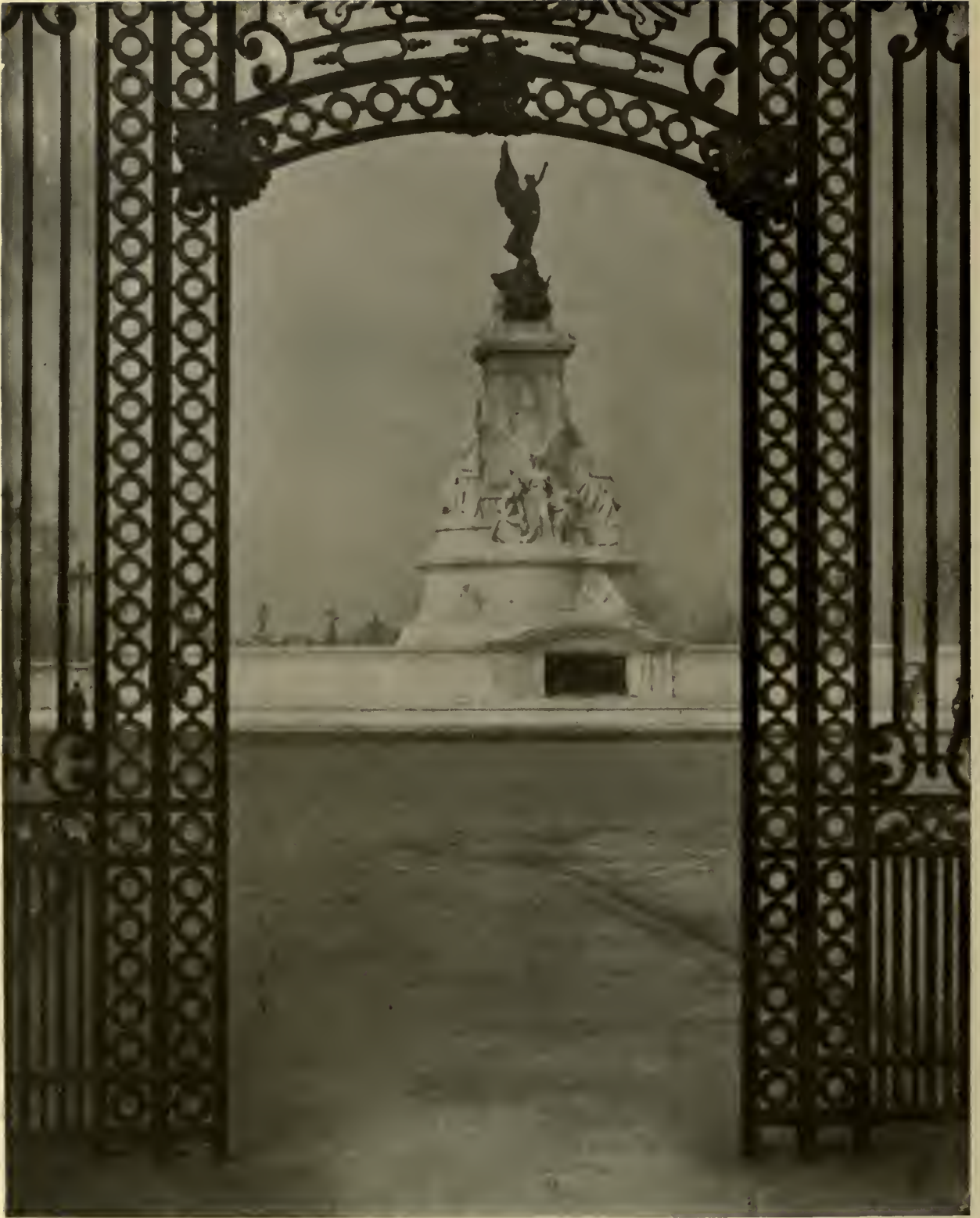
THE WHITE MONUMENT.