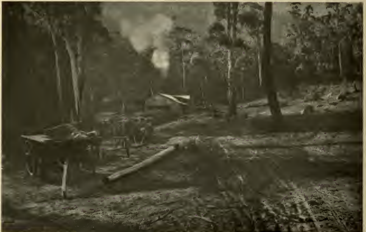
A MOUNTAIN SAW MILL.