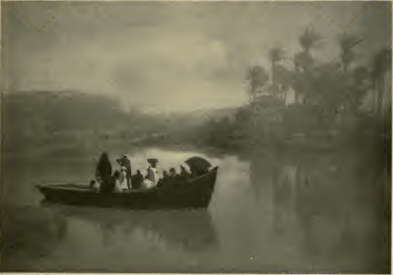
THE FERRY BOAT.