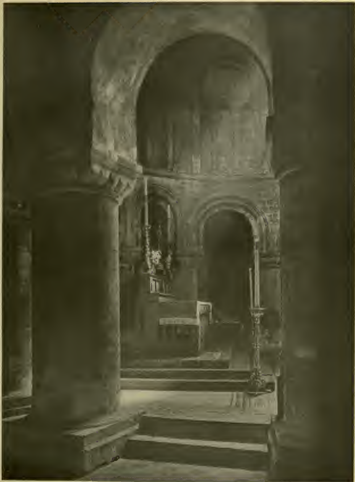
ST. BARTHOLOMEW'S, SMITHFIELD—FROM AISLE TO ALTAR.