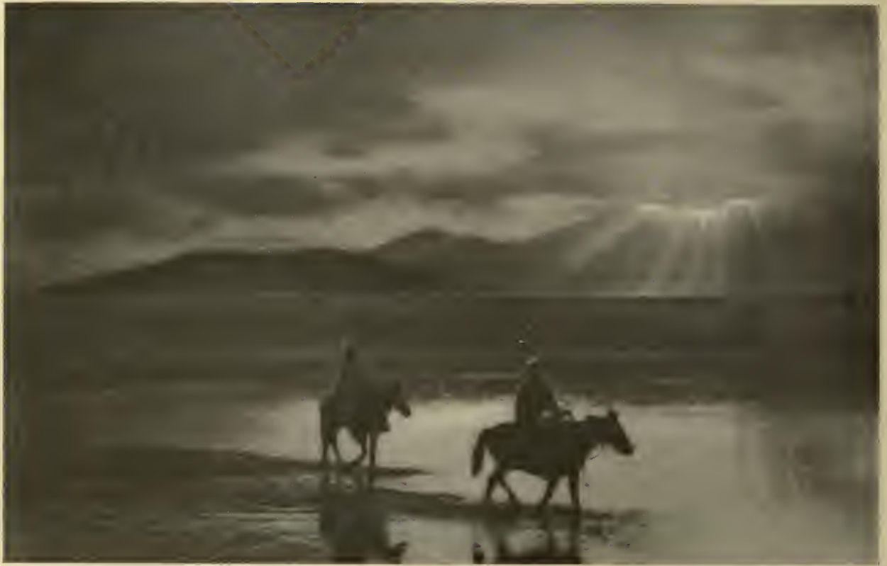
AN EASTERN TWILIGHT.