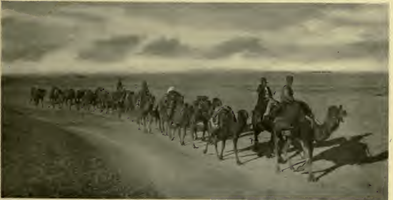
A DESERT CARAVAN.