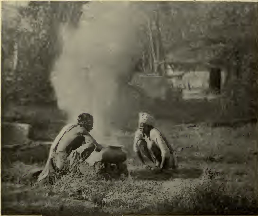
EAT TO LIVE. (A Scene in an Indian Village.)