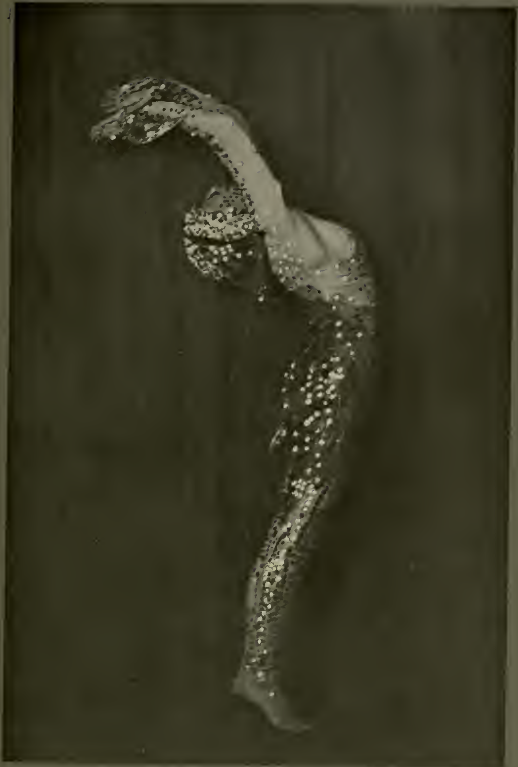
MISS MARGARET MORRIS AS "LE POISSON D'OR"