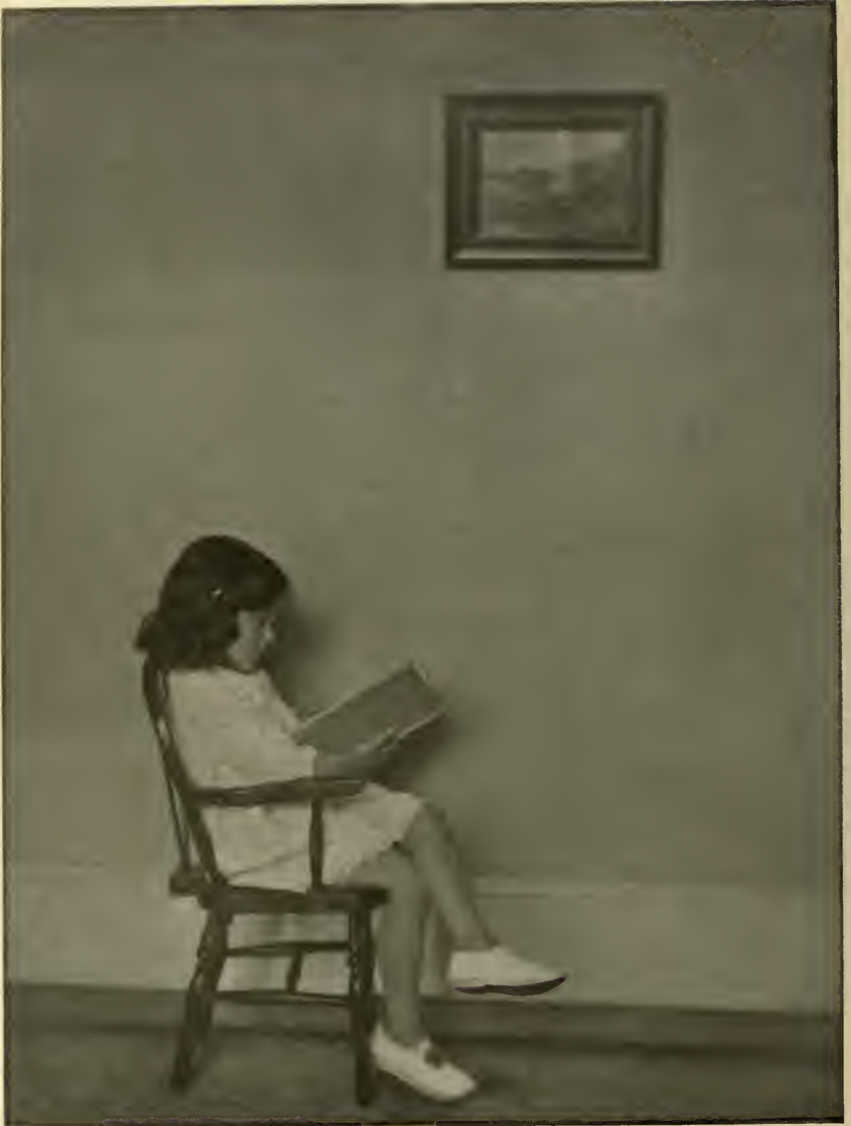
CHILD WITH A BOOK.