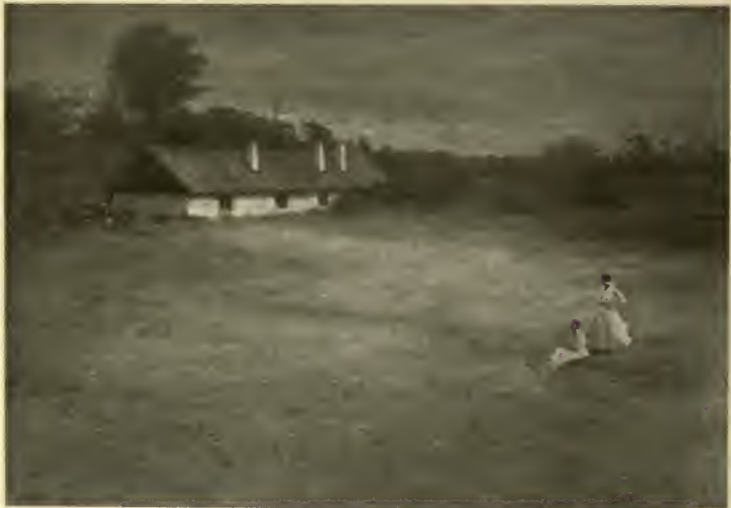
MY SUMMER COTTAGE.