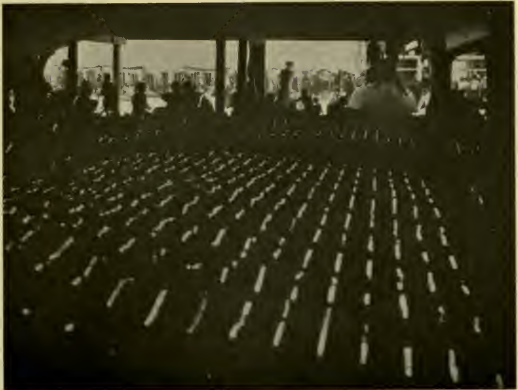
UNDER THE BOARDWALK, ATLANTIC CITY.