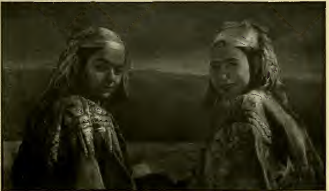
MOROS EN FRAJE DE FRETTEA.