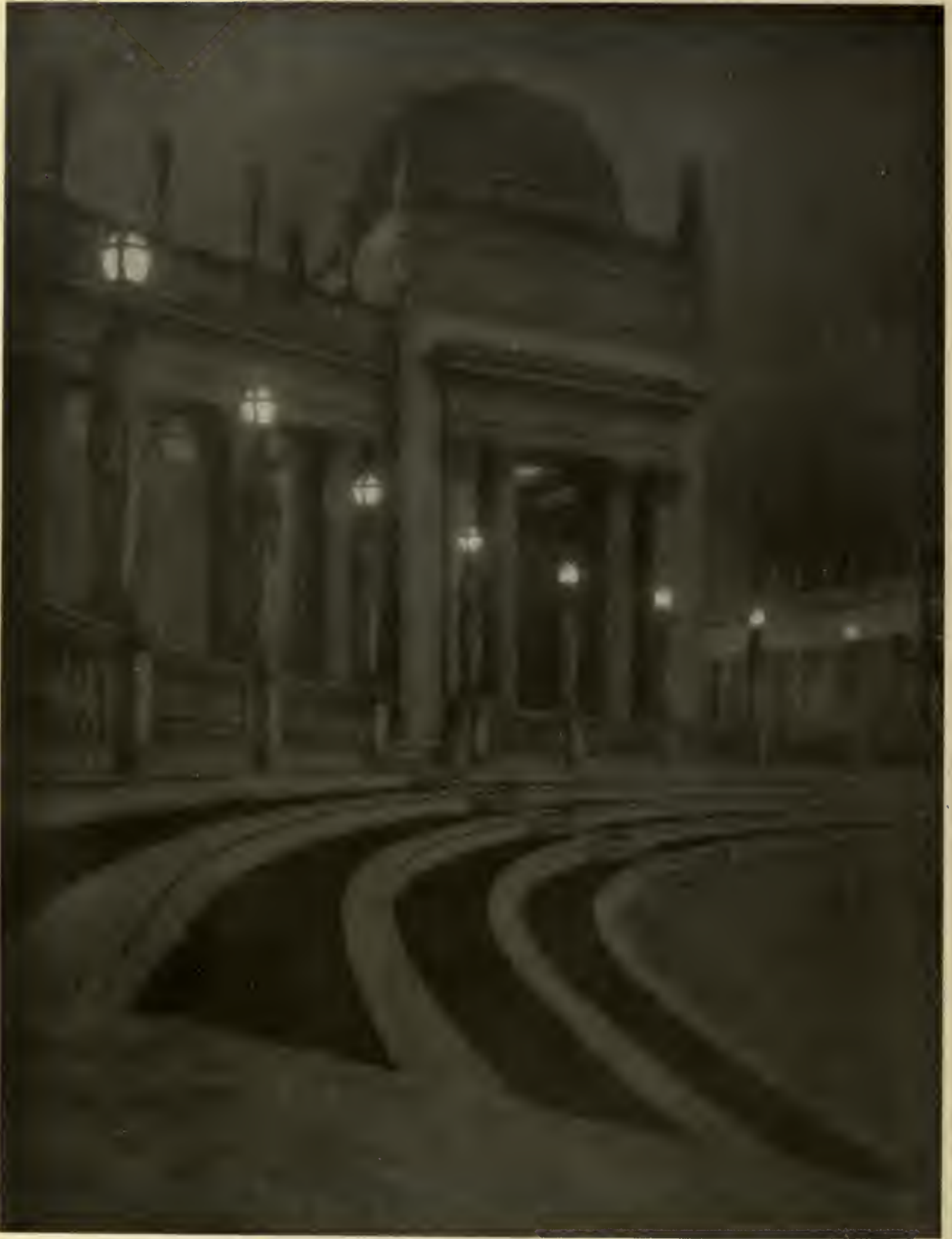
THE LIGHTED COURT.