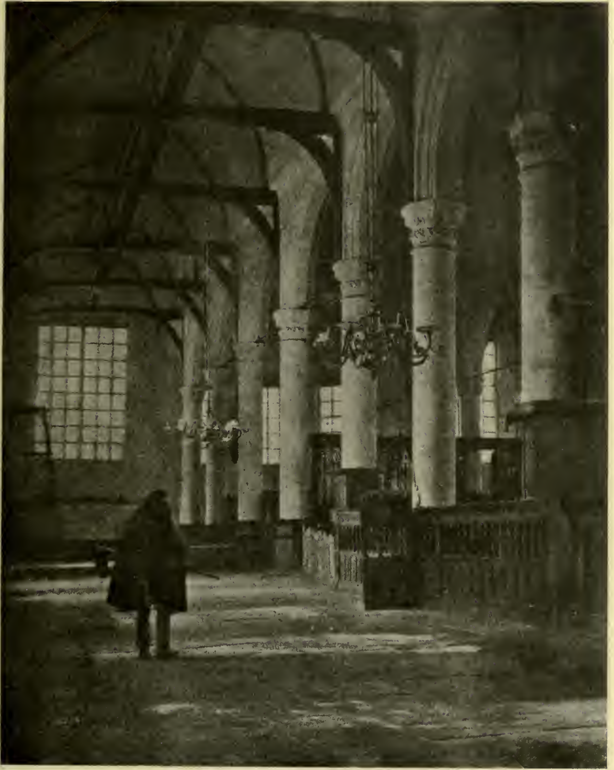
INTERIOR OF CHURCH AT VOLLENDAM.