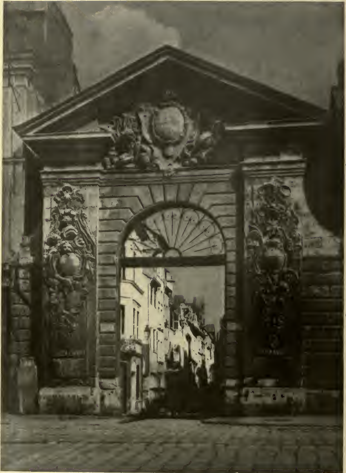
QUAI DE PARIS, ROUEN.