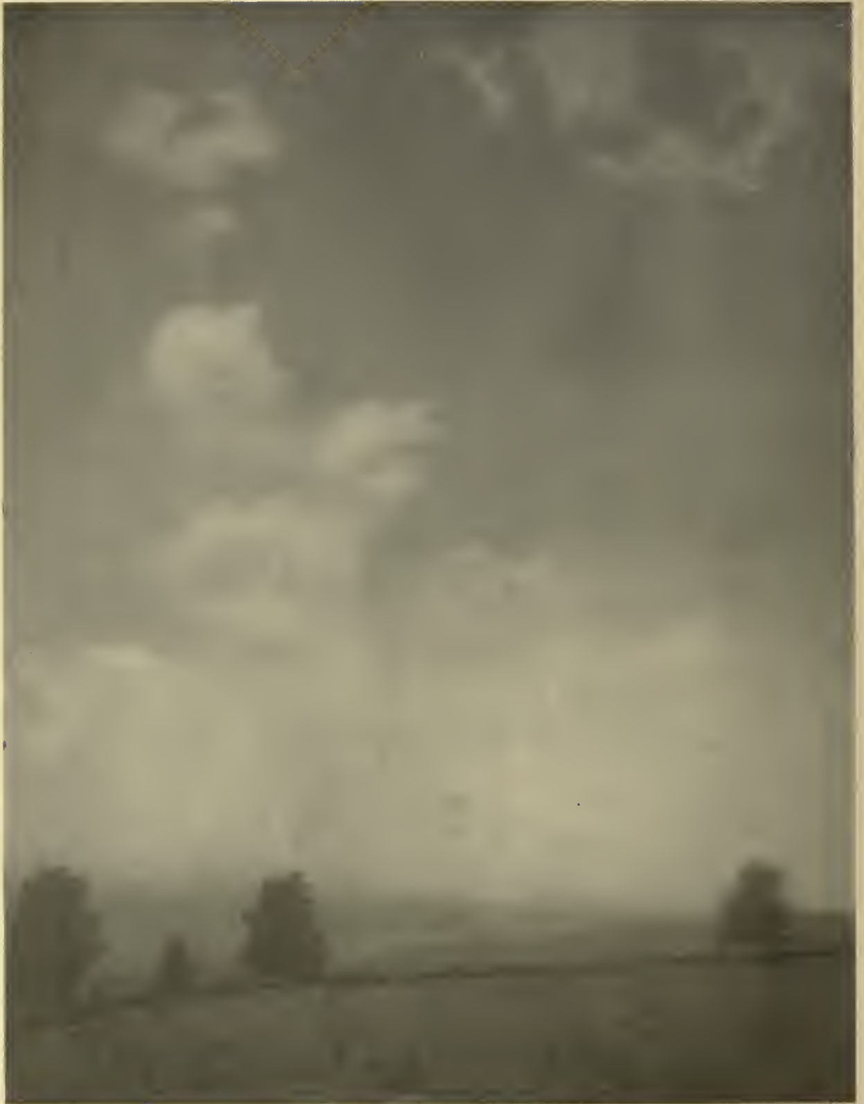
THE HILL TOP.