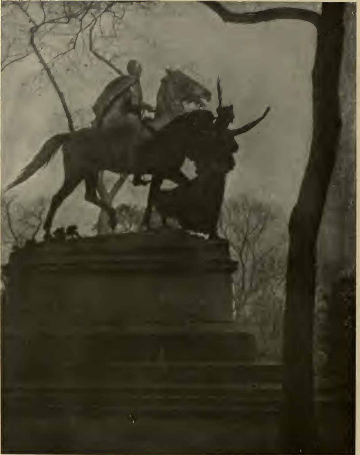
"PEACE AND VICTORY."

By WILL D. BRODHUN (WILKES-BARRE, U.S.A.).