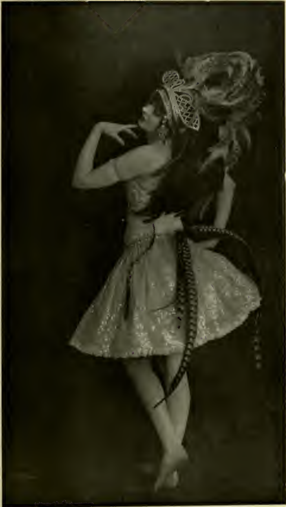
Mlle. SERAPHINE ASTAFIEVA IN " L'OISEAU INDIEN."