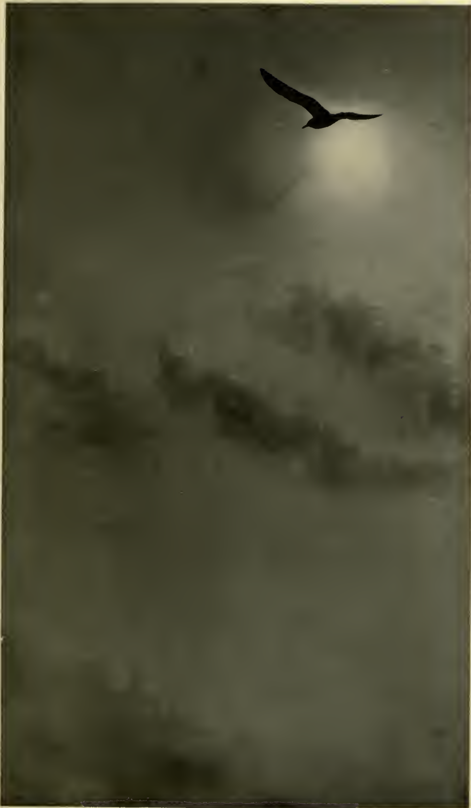
ABOVE THE CLOUDS.