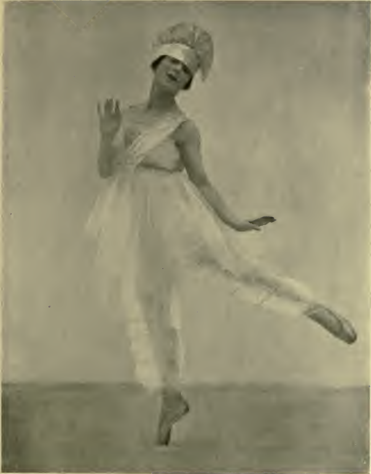
SUR LA POINTE