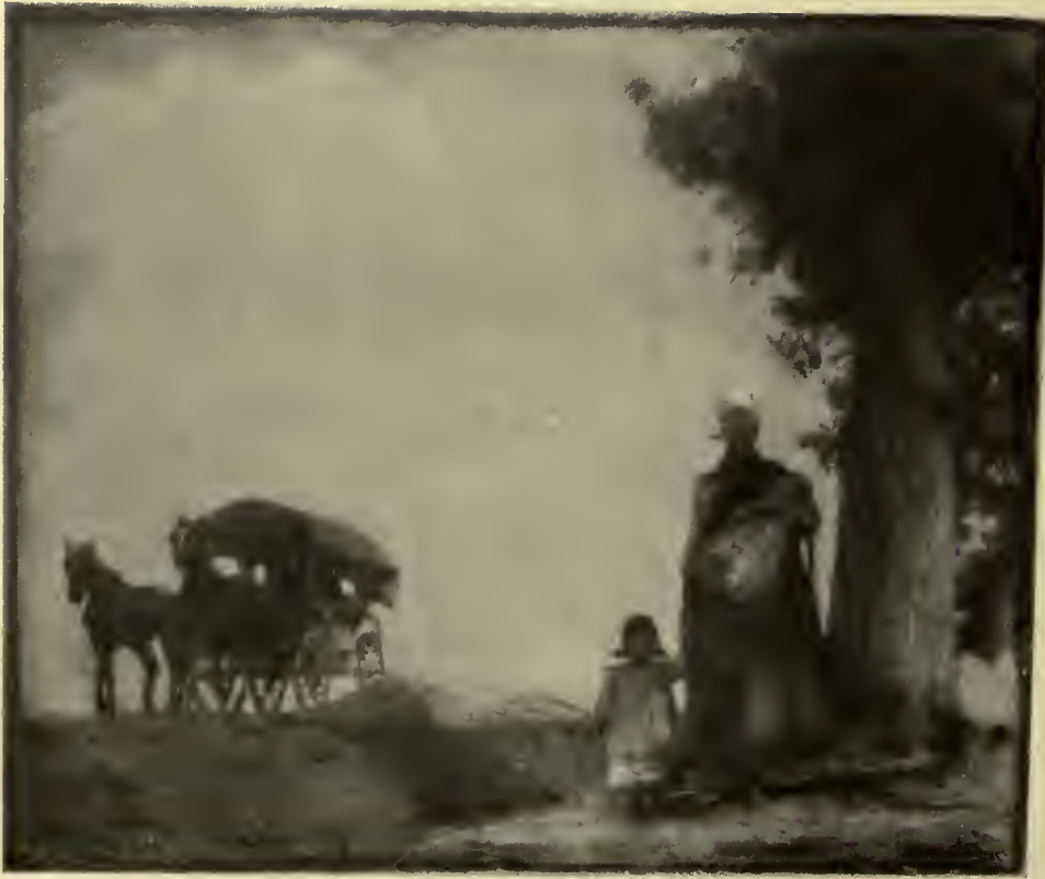
A DUTCH LANDSCAPE.