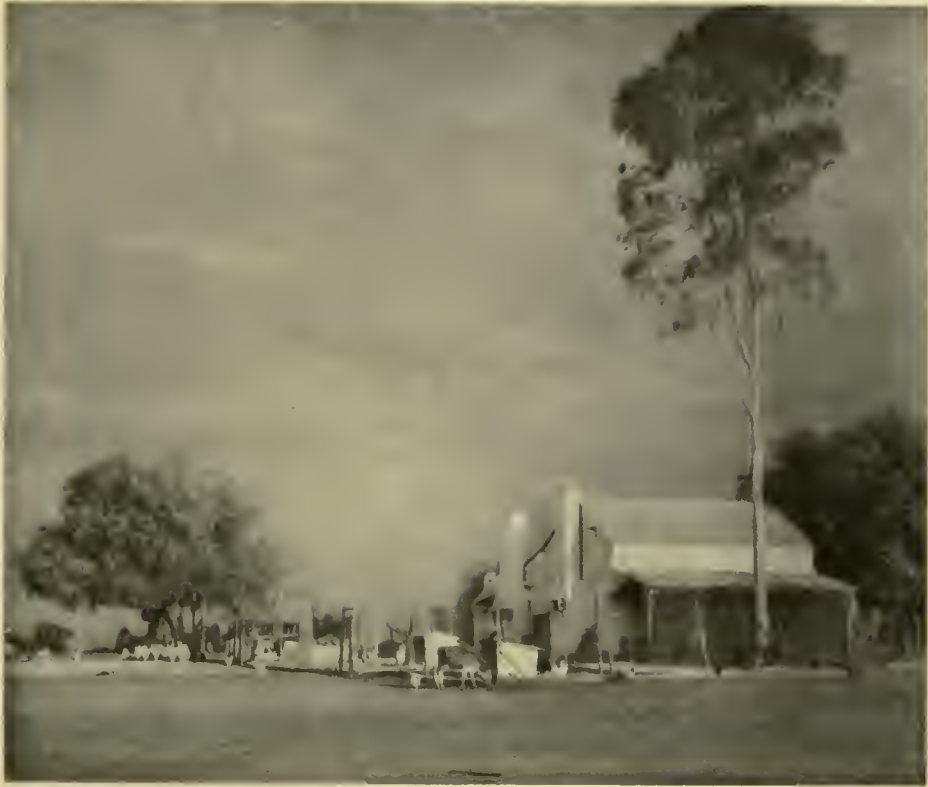
AN AUSTRALIAN HOMESTEAD.