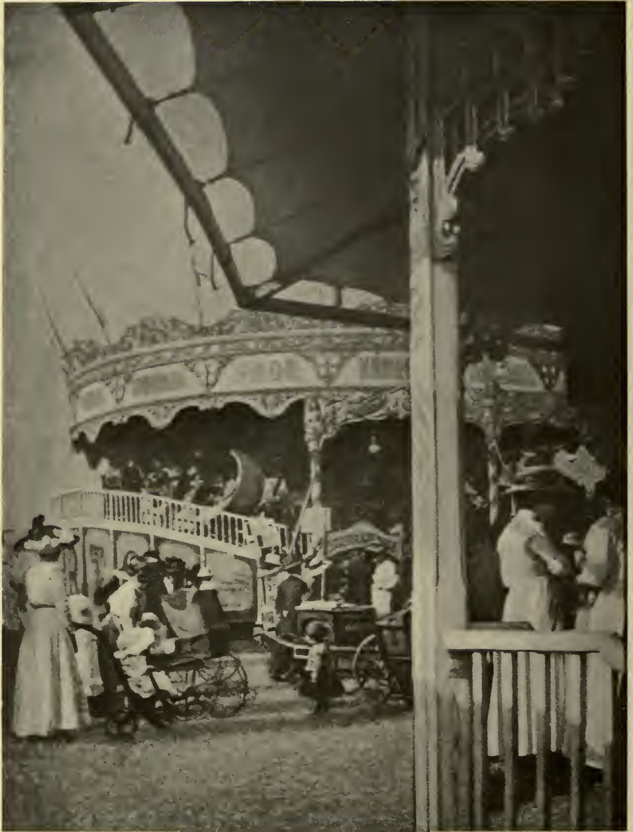
A COUNTRY FAIR.