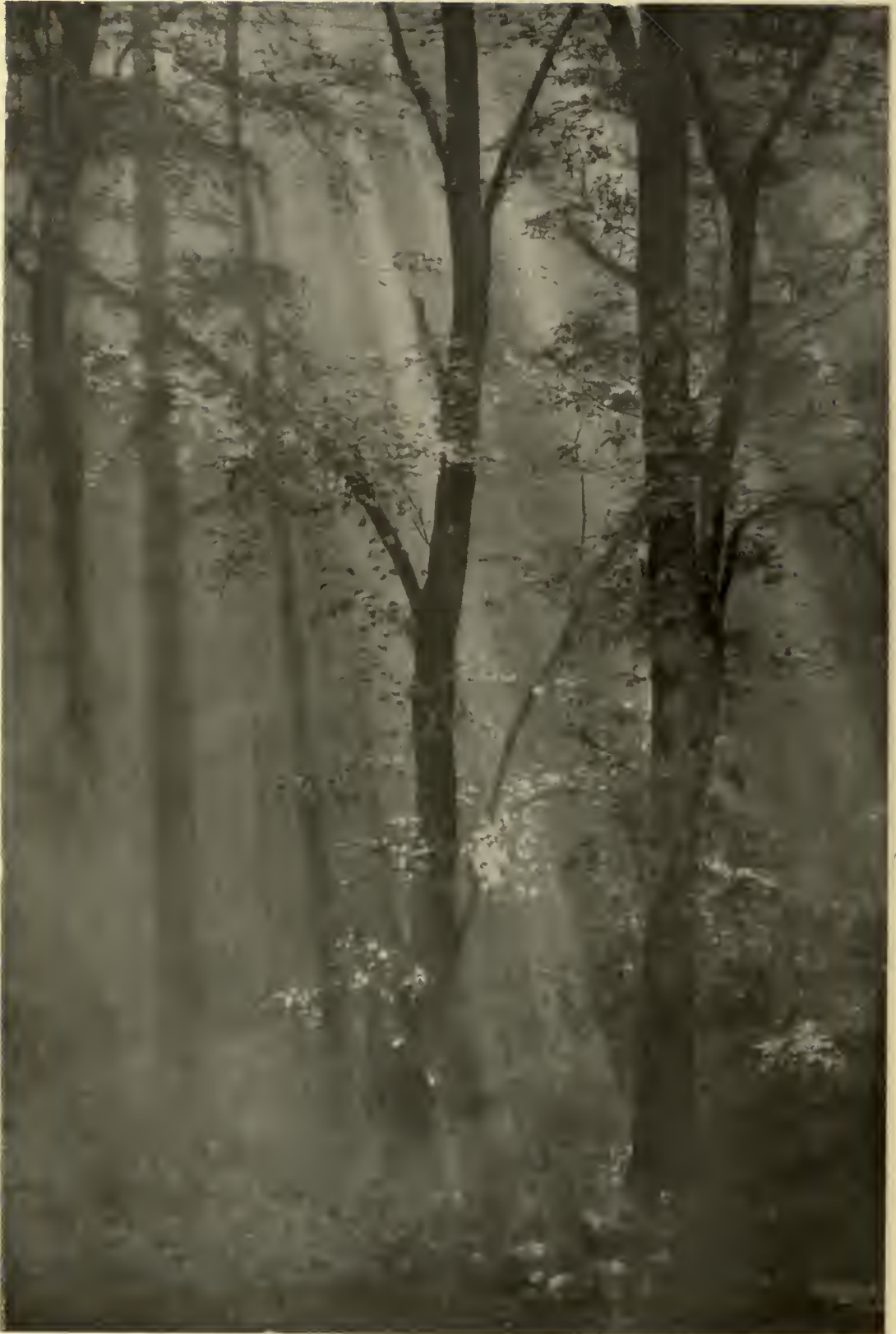
THE DAYSPRING FROM ON HIGH.