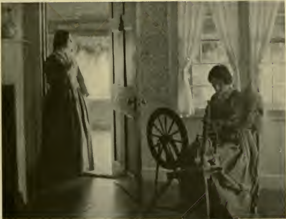
INDUSTRY AND IDLENESS.