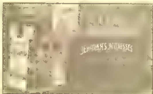
A Theocrat's sound-bear

In Chicago, while advertising the Sunday speech and giving a witness to a woman, one of the publishers heard someone come up behind him. After placing a booklet with the woman, he turned, and found a policeman standing there.