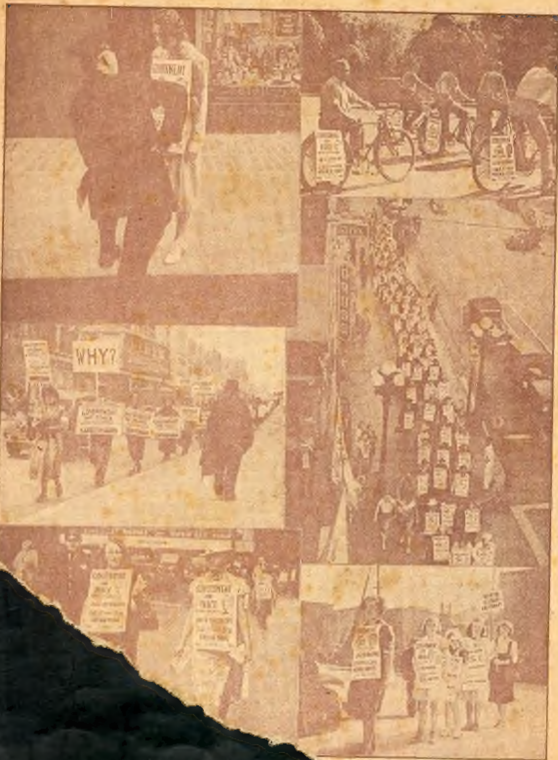
...eles, Chicago (2), and Winnipeg