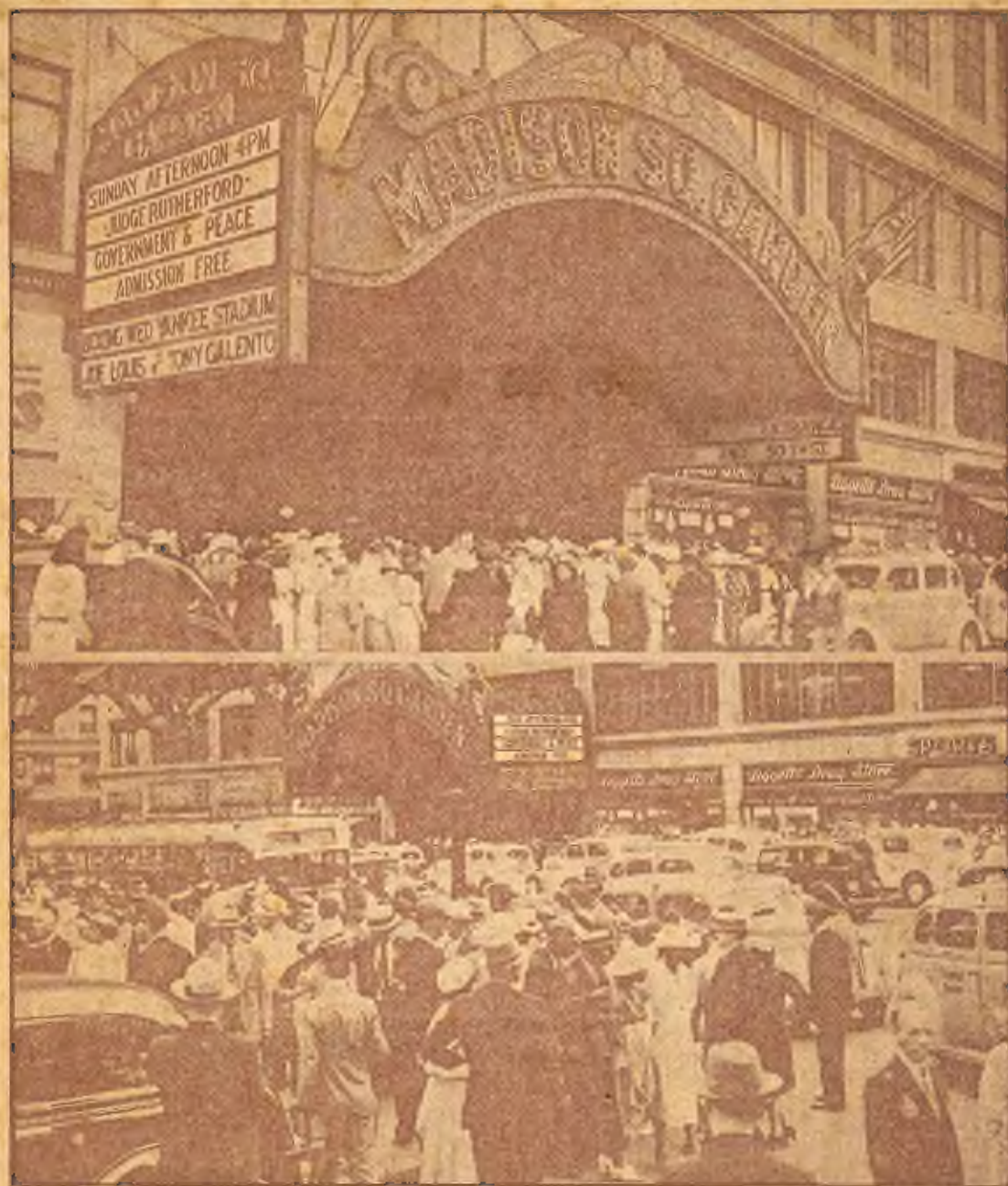
18,000 orderly people entering and leaving Madison Square Garden on the occasion of Judge Rutherford's address on "Government and Peace", Sunday, June 25, 1939