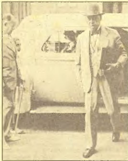
Arrival of Judge Rutherford at the auditorium

Those who read this Report will have the evidence presented to them of vast assemblies meeting in such far-separated points as London, New York, Chicago and Los Angeles to listen to the truths of God's Word and of His kingdom, as they went forth by radio beam, and by wire connections to all the earth. They will take note that in lands where English is not spoken there was provision that swift reporters translated simultaneously or took in shorthand and reproduced the lectures for the benefit of the listeners.