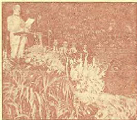
Delivering "GOVERNMENT AND PEACE"

A remarkable thing about the World-wide Convention, centering in New York, is the awakening of the Jews to the fact that God's Kingdom is their only hope. In an early issue of Consolation magazine will be published a letter from a prominent Jewish oculist appealing to