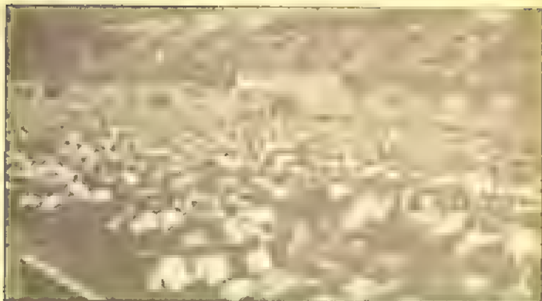
Six thousand listening in Chicago Arena

UNITED STATES. ALABAMA. MOBILE "Jehovah's witnesses assembled at Mobile received message, 'Victory,' with great satisfaction. Salvation brought great shout." "Government and Peace' perfect. Two hundred spoke sound. shout 'Aye'." "Another Victory. May Jehovah sustain you as He uses you to His honor. 'Salvation belongeth unto Jehovah.' Reception perfect, no disturbance." "Sixteen hundred say 'Aye'. We are with you. Enthusiasm high."