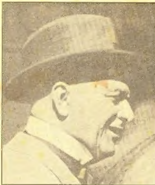
A Kingdom smile