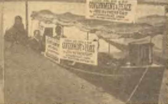
London horse, Glasgow boat, N. London Mte, Glasgow truck, Akron truck, Bristol yacht, London launch