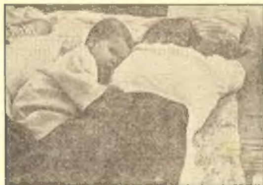
Awake before mother, on the Arena lawn. Victims of the Hierarchy-engineered boycott.