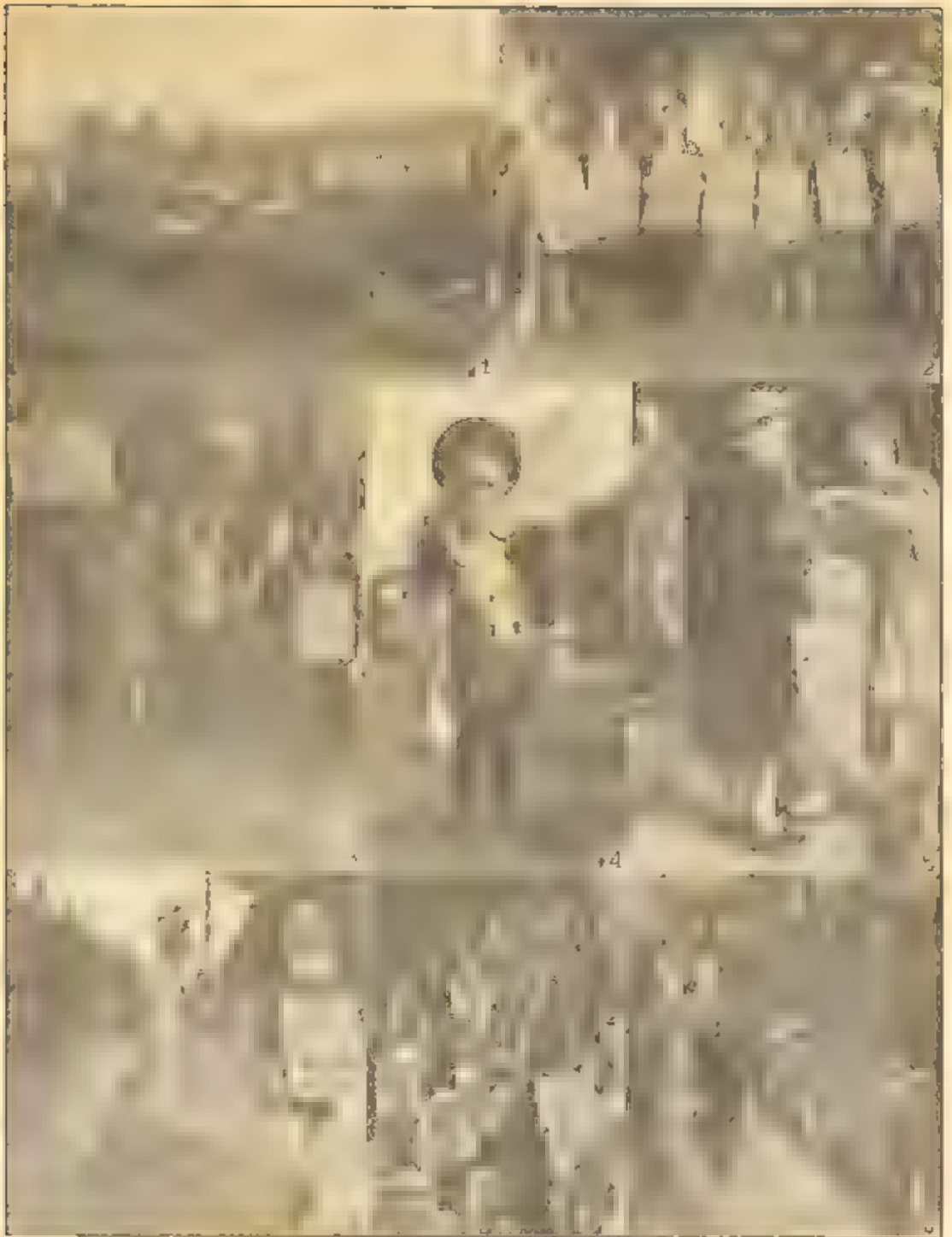
Le enter o seb