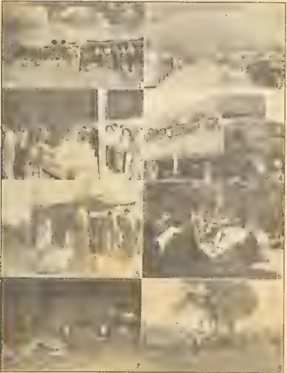
1. View of the building from the street. 2. Close-up of the building's corner. 3. View through a doorway. 4. Another view of the building's facade. 5. View through a doorway. 6. View through a doorway. 7. View through a doorway. 8. View through a doorway.