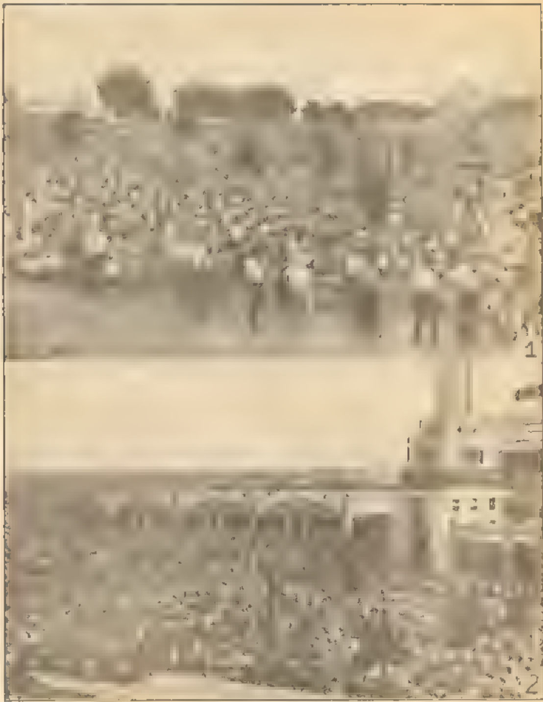
Listening on the grassy lawn of The Arena. (1) Western view (2) Eastern view