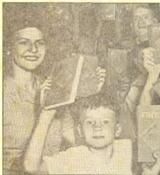
Some who received the gift.

When they filed to the platform to receive their book, the tall man in gray-green is completely surrounded by youth from 5 to 18 years of age and you recognize at once that they belong to each other, and you don't know which is the most appealing—the deep-felt joy of the man, which is strikingly apparent in his voice when he speaks, or the enthusiastic response of the children. As the seats empty in an orderly manner you wonder at the entire scene, the flower bed has come to life and all is movement and color.