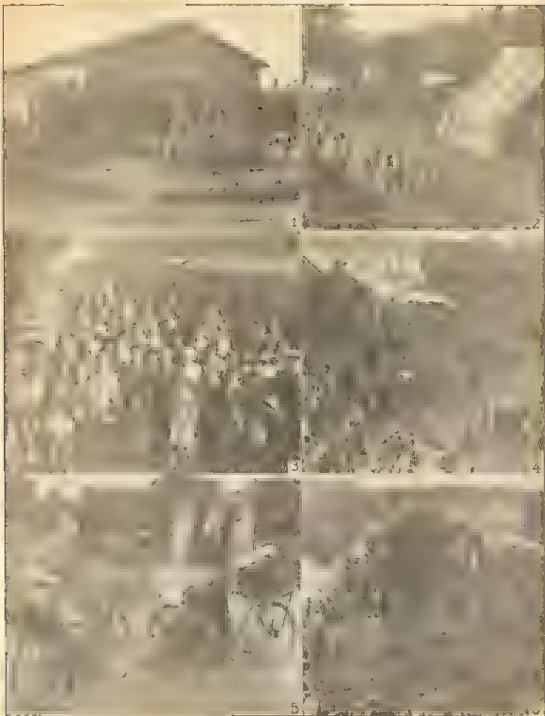
1. View of Assembly 2. View of Assembly 3. View of Assembly 4. View of Assembly 5. View of Assembly