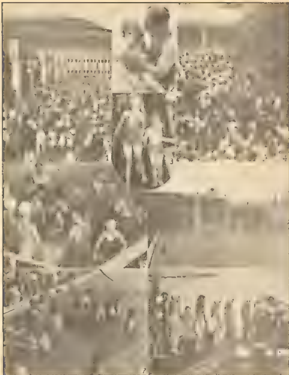
THE GREAT PARADE OF THE CITY OF PHOENIX, ARIZONA, APRIL 15, 1904. THE MARCHING BAND OF THE UNIVERSITY OF ARIZONA IS SEEN IN THE FOREGROUND.