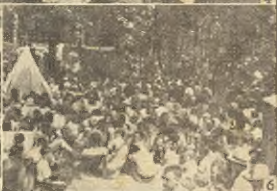
(1) Delivering Jehovah's message. (2) Section in Hall "B". (3) Part of crowd that packed Hall "B". (4) Hall "A"; cafeteria closed for speech. (5) Children campers hear by wire. (6) Children in camp grove.