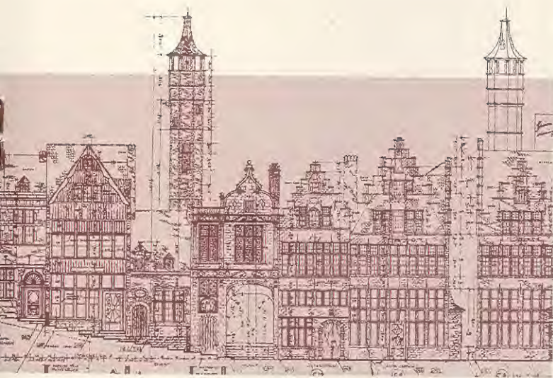
Blueprint detail of Belgian Village, Alfons De Rijdt, architect.