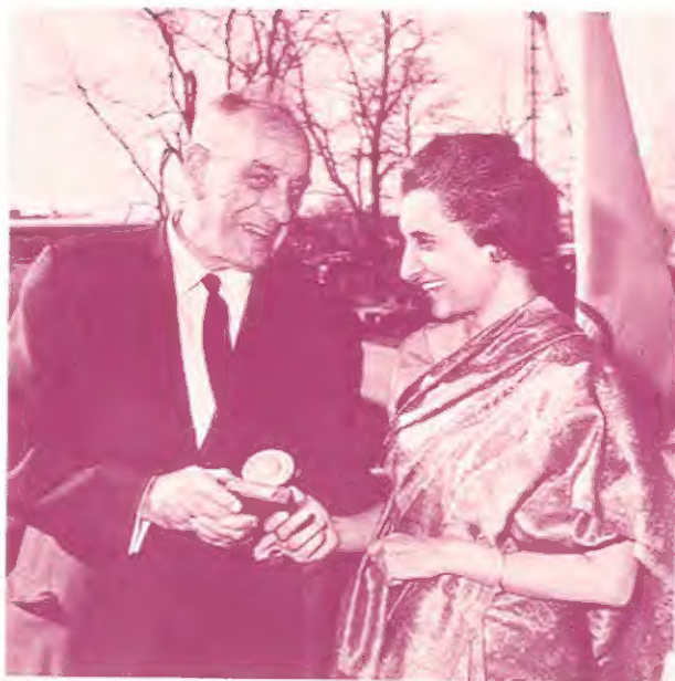
Mrs. Indira Gandhi graciously accepts the World's Fair medal from Robert Moses, president of the Fair, at the conclusion of the speeches.

We ask that you, Madame Gandhi, convey to your distinguished father the respect and admiration of our people for his part in bringing the East and West together, and in furthering the cause of international peace through friendship and understanding.