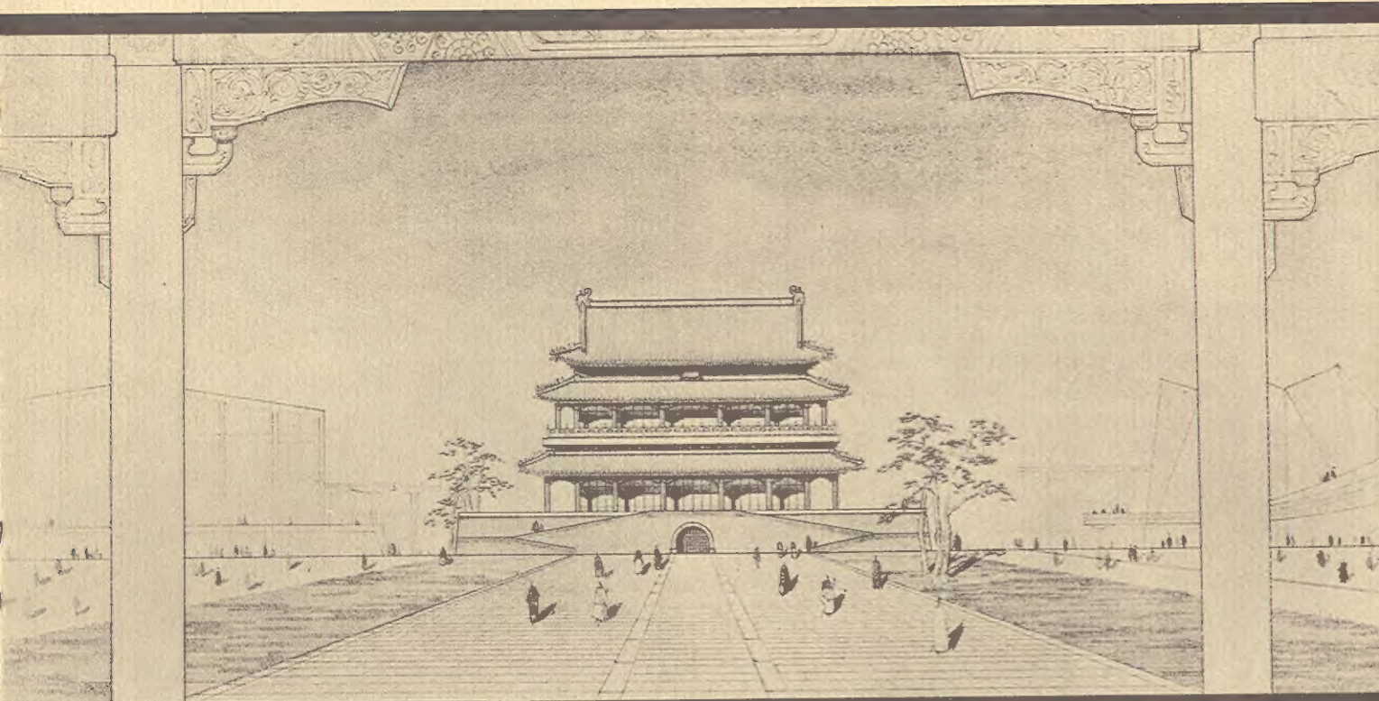
Pavilion of the Republic of China.