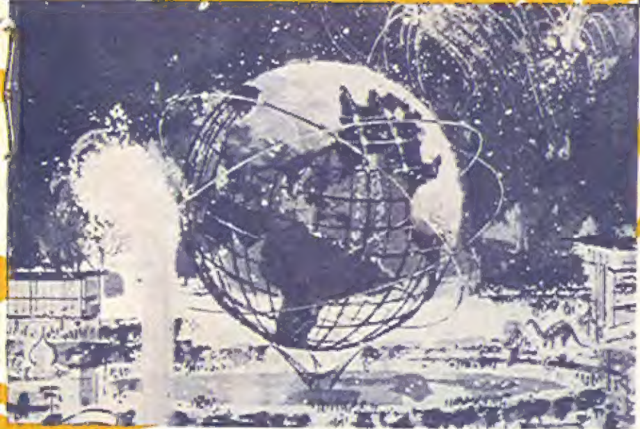
W. D. SHAW

UNISPHERE , symbol of the New York World's Fair, is donated as the exhibit of United States Steel Corporation. It will tower 140 feet above a gigantic 340-foot reflecting pool, with its land masses of stainless steel supported on an open grid of latitudes and longitudes. It will dramatize the interrelation of the peoples of the world and their hopes for "Peace Through Understanding."