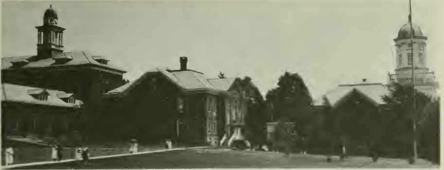
The main campus about 1920.

the years since the granting of the charter, many changes have occurred in the name of the institution and the face of the campus. First there was a new building on a new three-acre campus. The building, Institute Hall, was constructed in 1867 and is known today as Carver Hall.