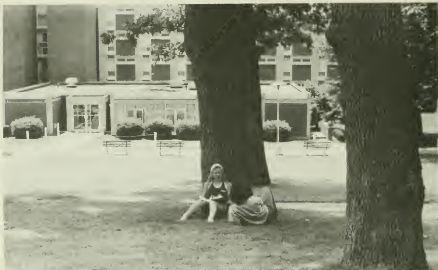
Schuykill Residence Hall is located between Carver Hall and Old Science.

tinued in that capacity until 1939 when he became superintendent of Public Instruction for the second time.