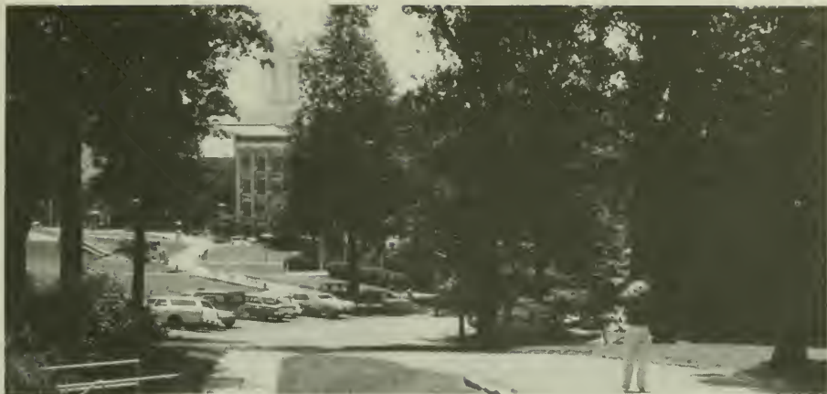
A stroll through the old Grove.