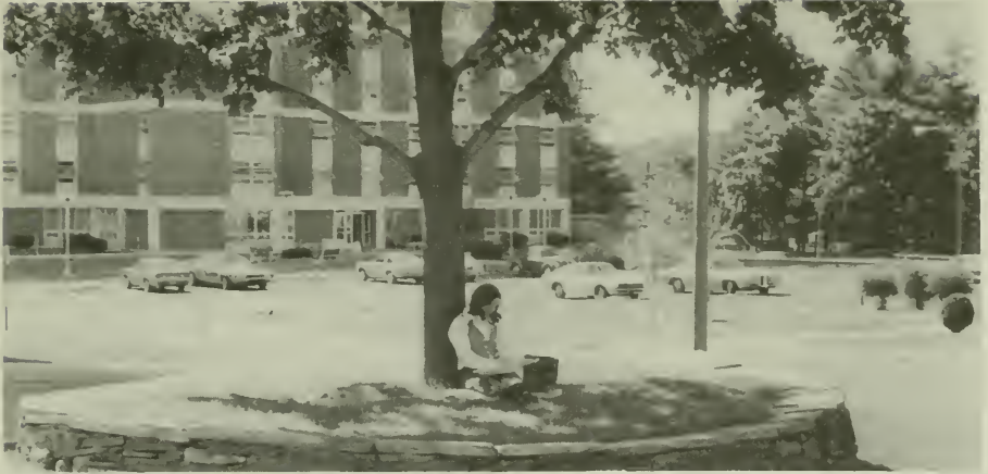
Columbia Residence Hall.

to have a state approved long range campus development plan. Growing out of the plan, the Business Education Department moved into its newly-constructed home, Sutliff Hall, in 1960. It was also in 1960 that the institution was named Bloomsburg State College.