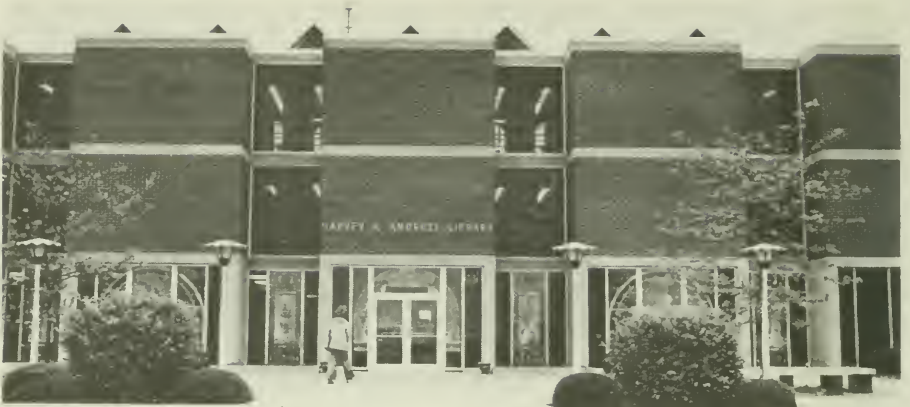
The west side of the Harvey A. Andruss Library, with the Tiffany Windows transferred from Old Waller Hall.

three trustees was appointed to confer with the sheriff, asking a postponement until October 15. The sheriff consented, and some settlement was made as no mention of the sheriff's sale was made again.