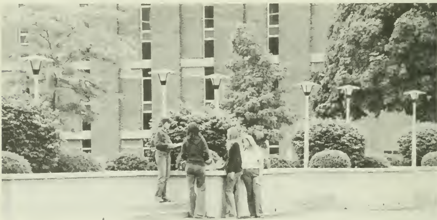
Waiting for the bus in front of Andruss Library–Hartline Science Center in the background.

Navy Hall, built in 1938 as a junior high school, received its unofficial name when the building was headquarters for several war programs at the college during World War II. Navy officers used nearly all