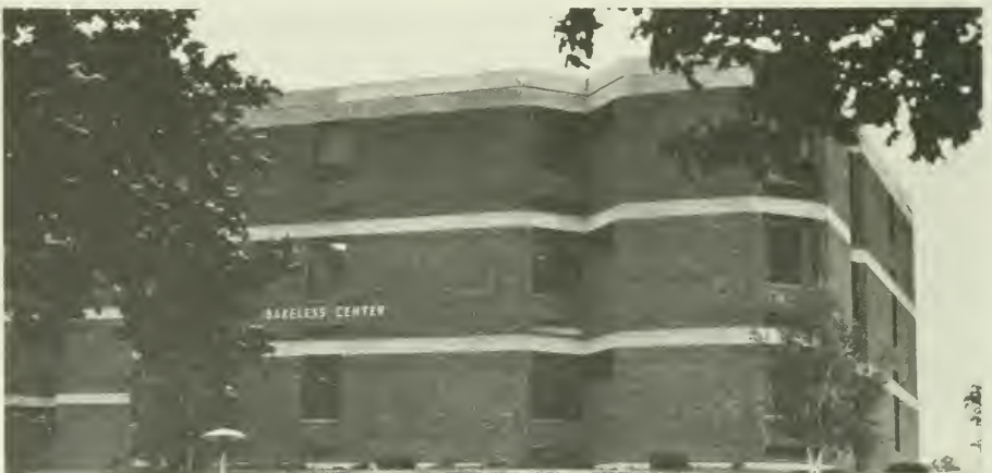
Bakeless Center for the Humanities.