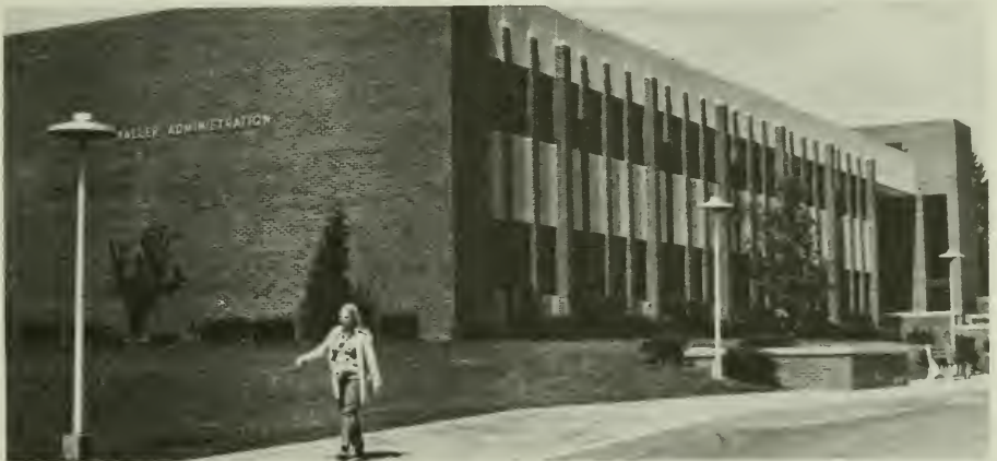
The Waller Administration Building was built in 1972.