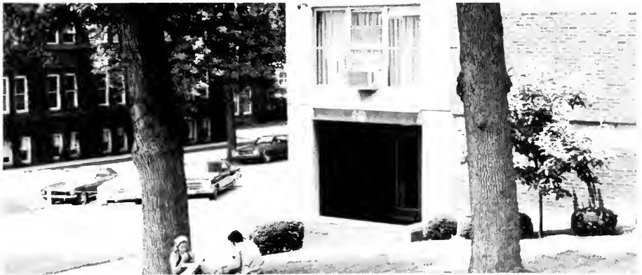
Montour Residence Hall, with Old Science Hall in background.

Like all educational institutions, the normal schools of Pennsylvania