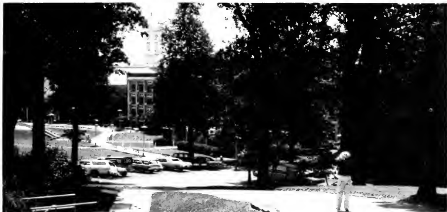
A stroll through the old Grove.