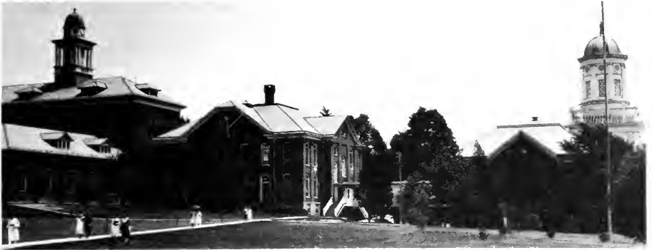
The main campus about 1920.

the years since the granting of the charter, many changes have occurred in the name of the institution and the face of the campus. First there was a new building on a new three-acre campus. The building, Institute Hall, was constructed in 1867 and is known today as Carver Hall.