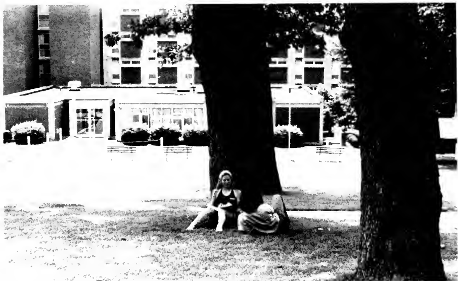
Schuylkill Residence Hall is located between Carver Hall and Old Science.

tinued in that capacity until 1939 when he became superintendent of Public Instruction for the second time.