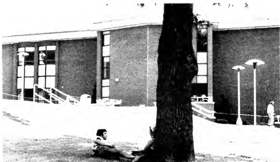
Kehr College Union is the center of student activities.