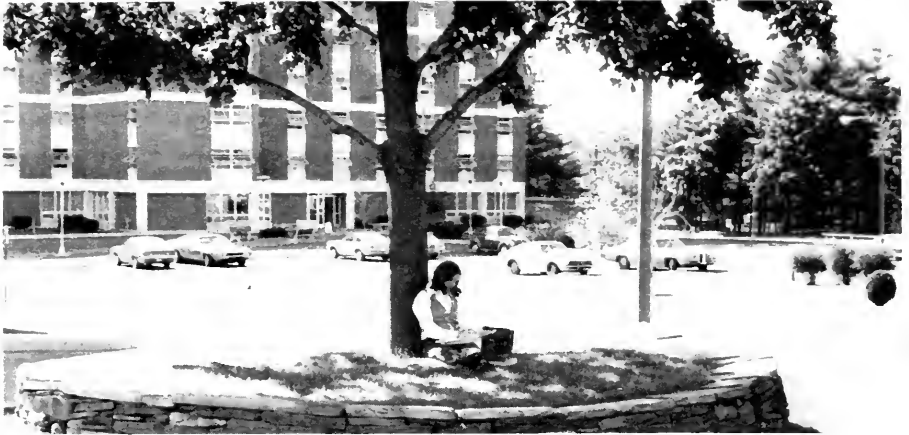
Columbia Residence Hall.

to have a state approved long range campus development plan. Growing out of the plan, the Business Education Department moved into its newly-constructed home, Sutliff Hall, in 1960. It was also in 1960 that the institution was named Bloomsburg State College.