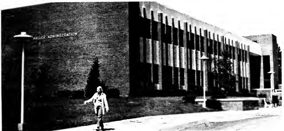
The Waller Administration Building was built in 1972.