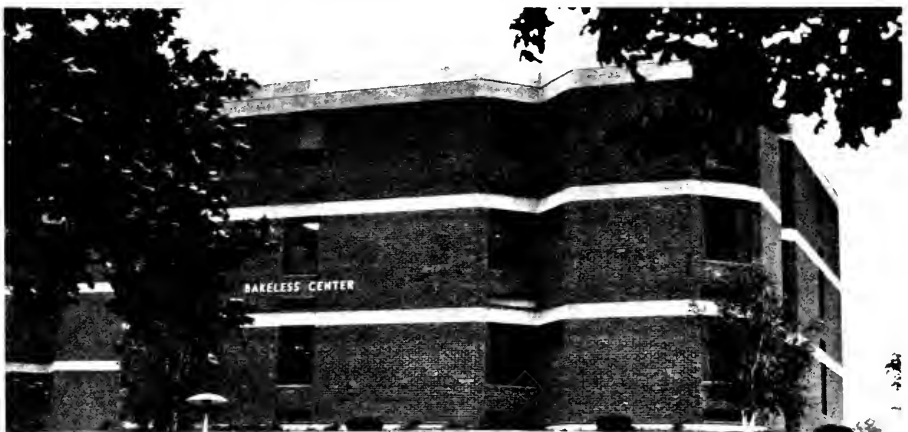
Bakeless Center for the Humanities.