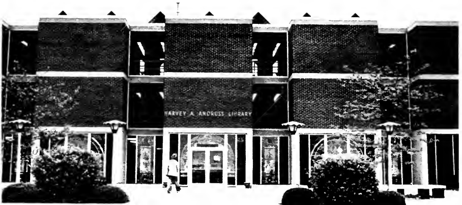
The west side of the Harvey A. Andruss Library, with the Tiffany Windows transferred from Old Waller Hall.

three trustees was appointed to confer with the sheriff, asking a postponement until October 15. The sheriff consented, and some settlement was made as no mention of the sheriff's sale was made again.