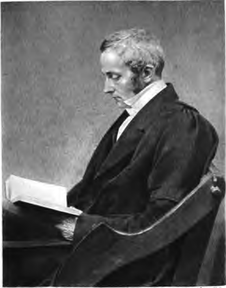
Arthur Penrhyn Stanley, when Regius Professor of Ecclesiastical History at Oxford. 1851.