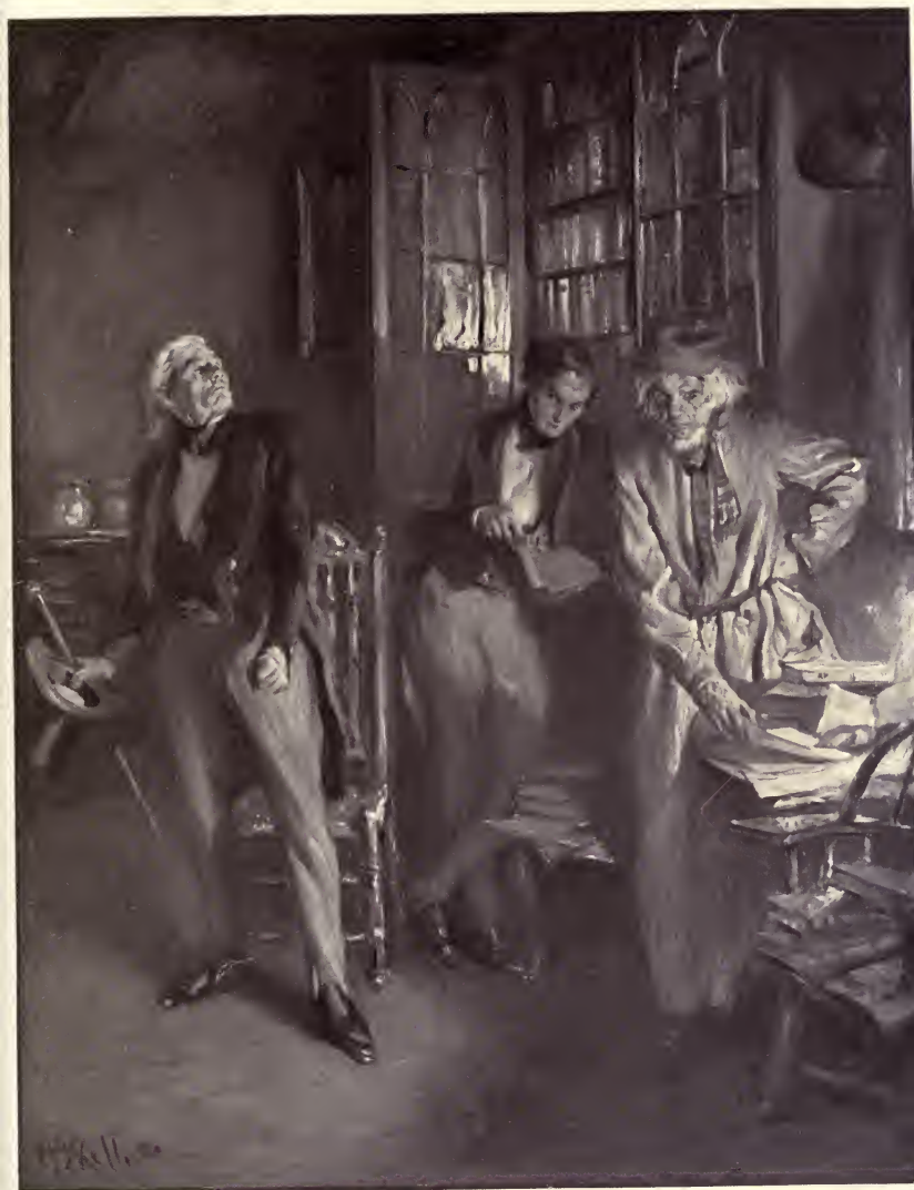
"Fifty-four Forty or Fight!" exclaimed Polk. Page 203