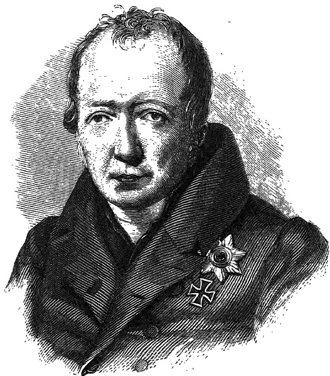
WILLIAM VON HUMBOLDT.