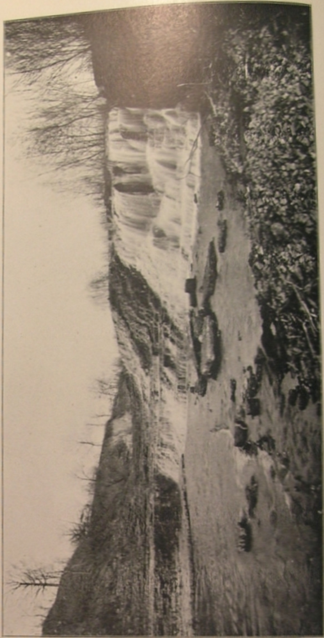
THE FALLS OF WAUKARUSA CREEK, MT. CARROLL