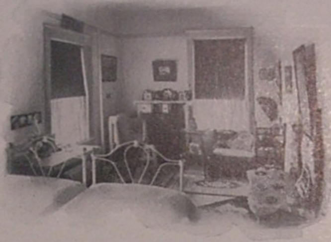
A PUPIL'S ROOM

Rooms and Furnishings. —Rooms are of different kinds and sizes. As a rule the rooms are intended for two, using one double bed. The rooms in South Hall have two single beds. For one pupil in a room, see p. 33. All rooms are furnished with hardwood floors, beds, chairs, table, bureau, washstand, crockery, and window shades. Students furnish rugs, sheets, pillow-cases 26x20, all bed clothing, towels, napkins and napkin ring, knife, fork, spoon and lamp. All articles must be plainly marked with name (not initials) with indelible ink. (Double bed, 6x4; single bed, 6x3). Rooms in new dormitory have two single beds.