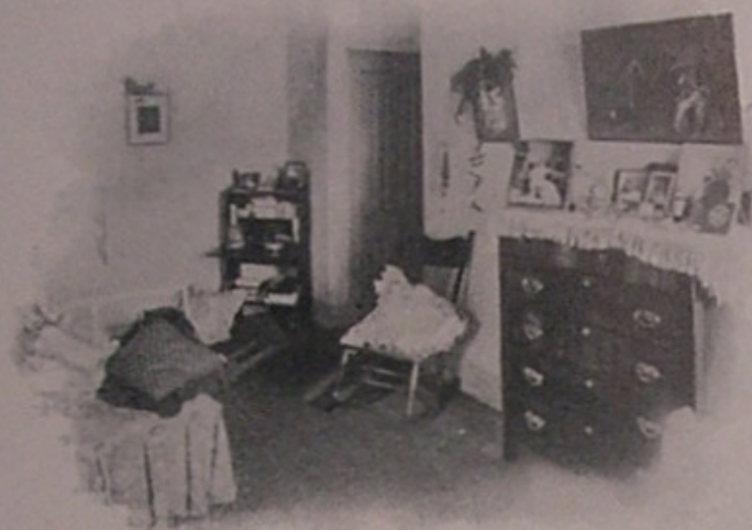
A PUPIL'S ROOM

This organization includes alumnae, old students, and friends of the Academy, whose purpose is to encourage friendly relations between old students and the Academy. It holds an annual business meeting at commencement time, and gives a program and a picnic supper on the Academy grounds.