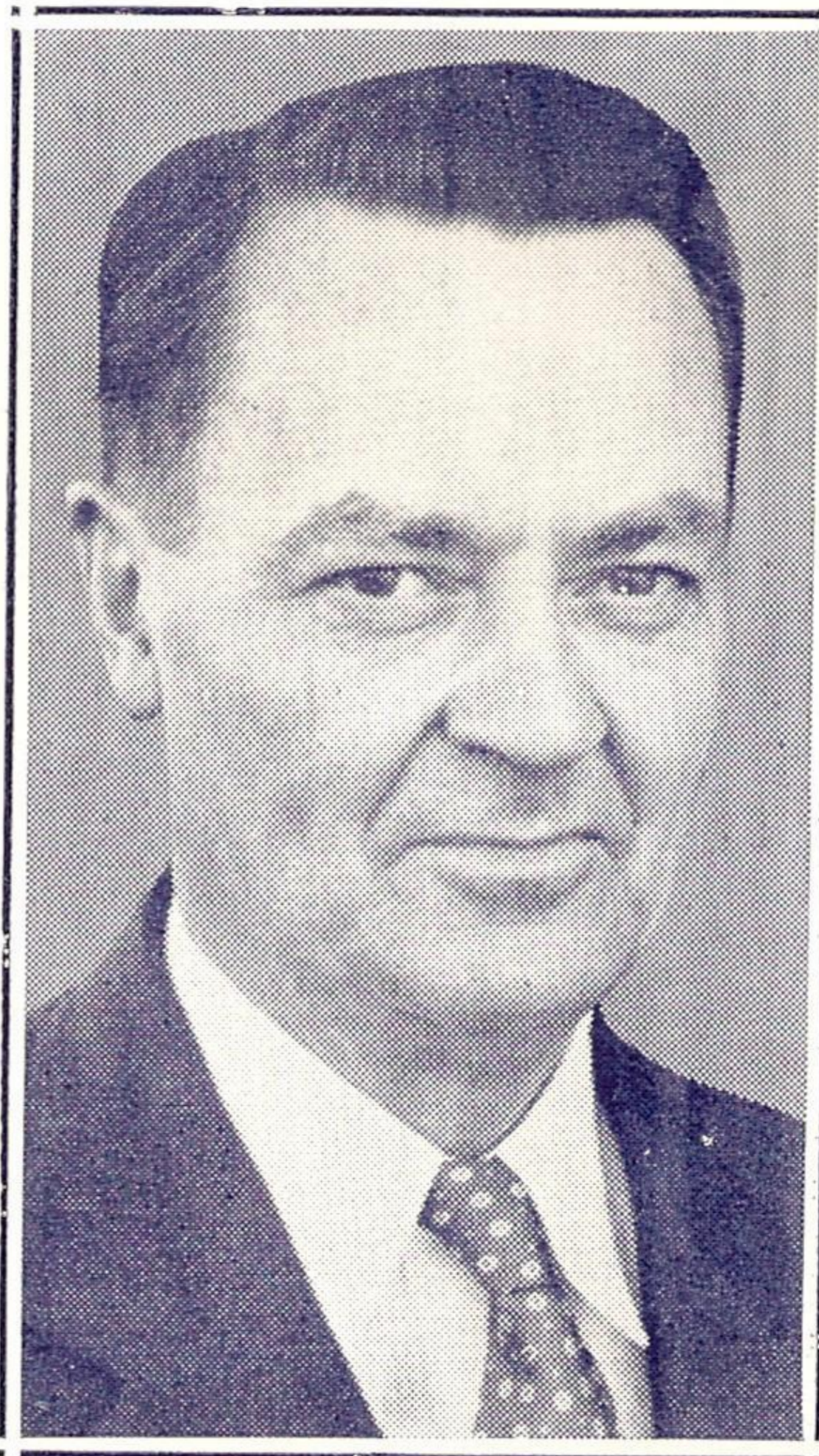
HON. FRANK J. HOGAN MAYOR of the City of Troy