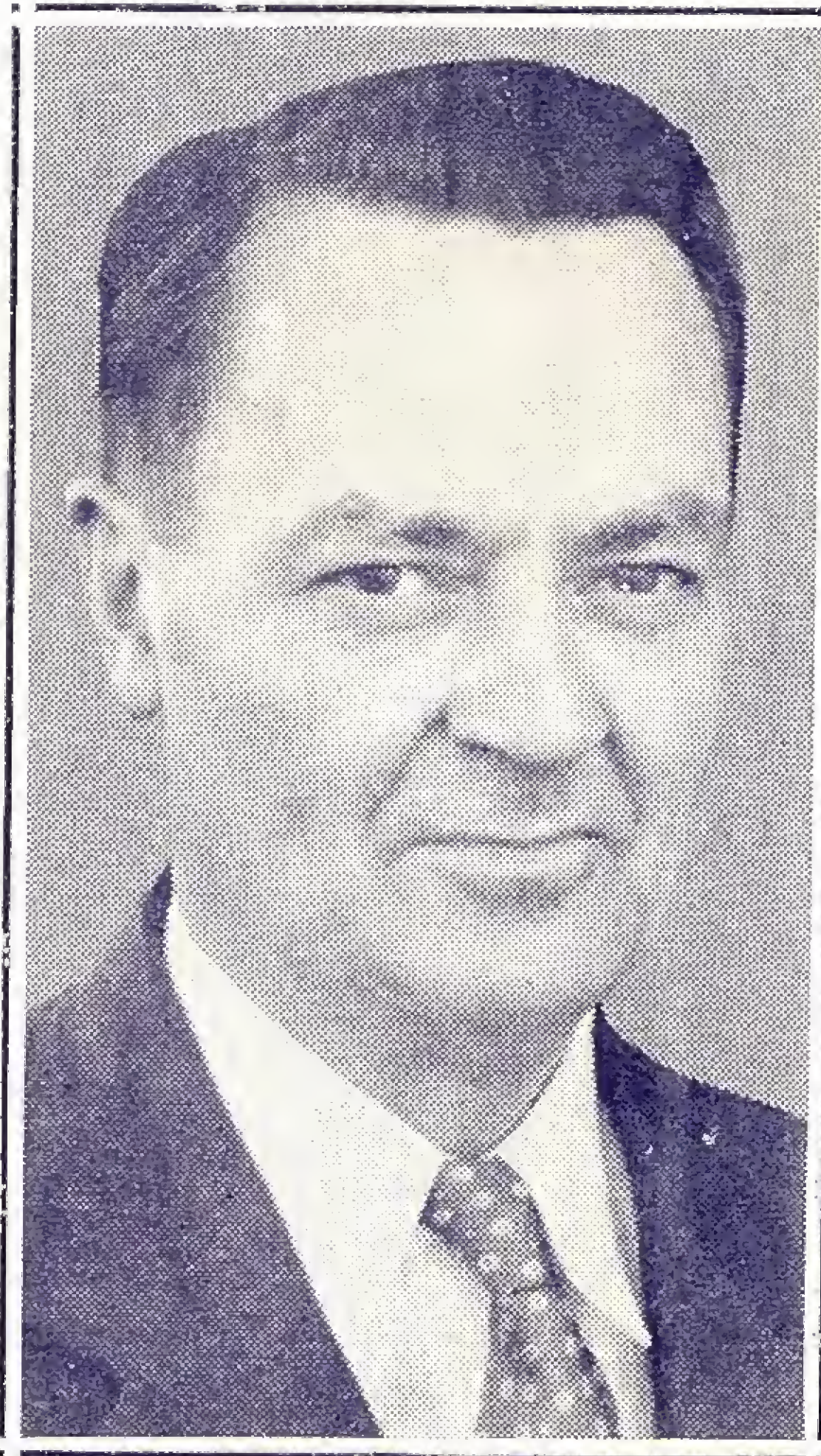
HON. FRANK J. HOGAN MAYOR of the City of Troy