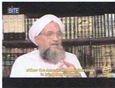
Dr. Ayman al-Zawahiri, Image from "A Review of Events"

As-Sahab, the media arm of al-Qaeda, issued to jihadist forums on April 21, 2008 the second and final installment of responses by Dr. Ayman al-Zawahiri to the open meeting initiative. The installment was distributed as a 2 hour 36 minute Arabic audio file with 79-page Arabic transcript, as opposed to the first set that also included an English transcript. That first release on April 2 contained responses to 90 questions posted by 29 members. Here Zawahiri addresses 63 different members and answers over 250 questions. Responses are divided into seven sections: Iraq, North Africa, the Muslim Brotherhood, Pakistan, Arabian Peninsula, Lebanon, and a general category. Questions in the general category regard 37 different issues, such as: Abu Musab al-Suri and his text instructing in strategy, Call to Global Islamic Resistance ; Abu Omar al-Baghdadi as a fictitious character; al-Qaeda reprisals in Denmark, Japan, Norway, and Sweden; jihad in Sudan and Yemen; and participating in jihad in Iraq or Afghanistan verses jihad in the countries of the "infidels", Europe and North America.