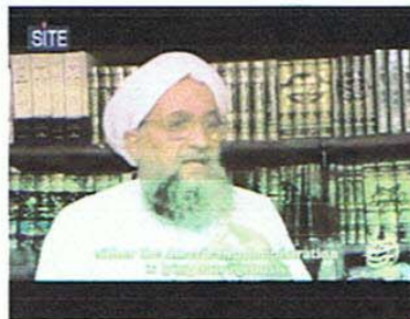
Dr. Ayman al-Zawahiri, "A Review of Events"

The first set of responses to an open meeting with Dr. Ayman al-Zawahiri, whereby jihadists turned out in large number to ask questions of the al-Qaeda leader, was issued by as-Sahab to jihadist forums today, April 2, 2008. The responses, indicated as the first of two parts, were distributed as a 1 hour 43 minute 49 second Arabic audio file with English and Arabic transcripts. Zawahiri responds in this installment to 90 questions posed by 29 members, some critical of al-Qaeda, which is divided into four sections: killing of innocents, Iran, Egypt, and Palestine. He states that due to the volume of questions, not all will be answered, especially those which deal with personal differences and quarrels, and those dealing with matters of security.