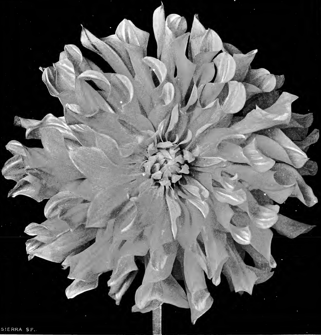
Hybrid Cactus Dahlia "El Granada"