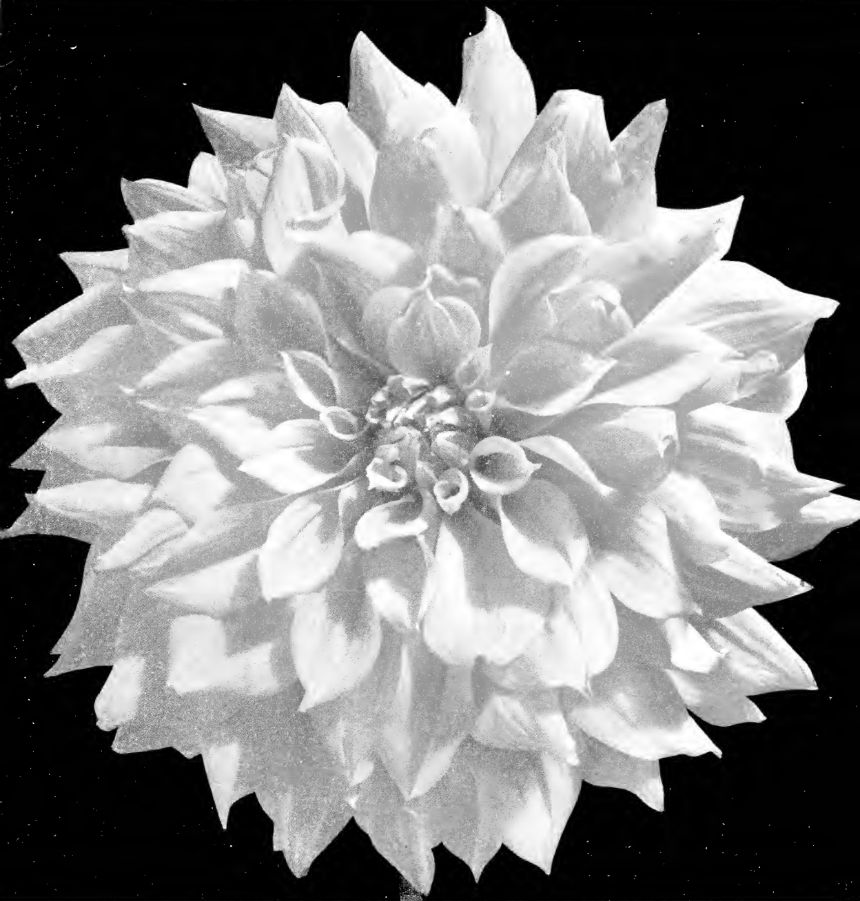
New Decorative Dahlia "Perella"