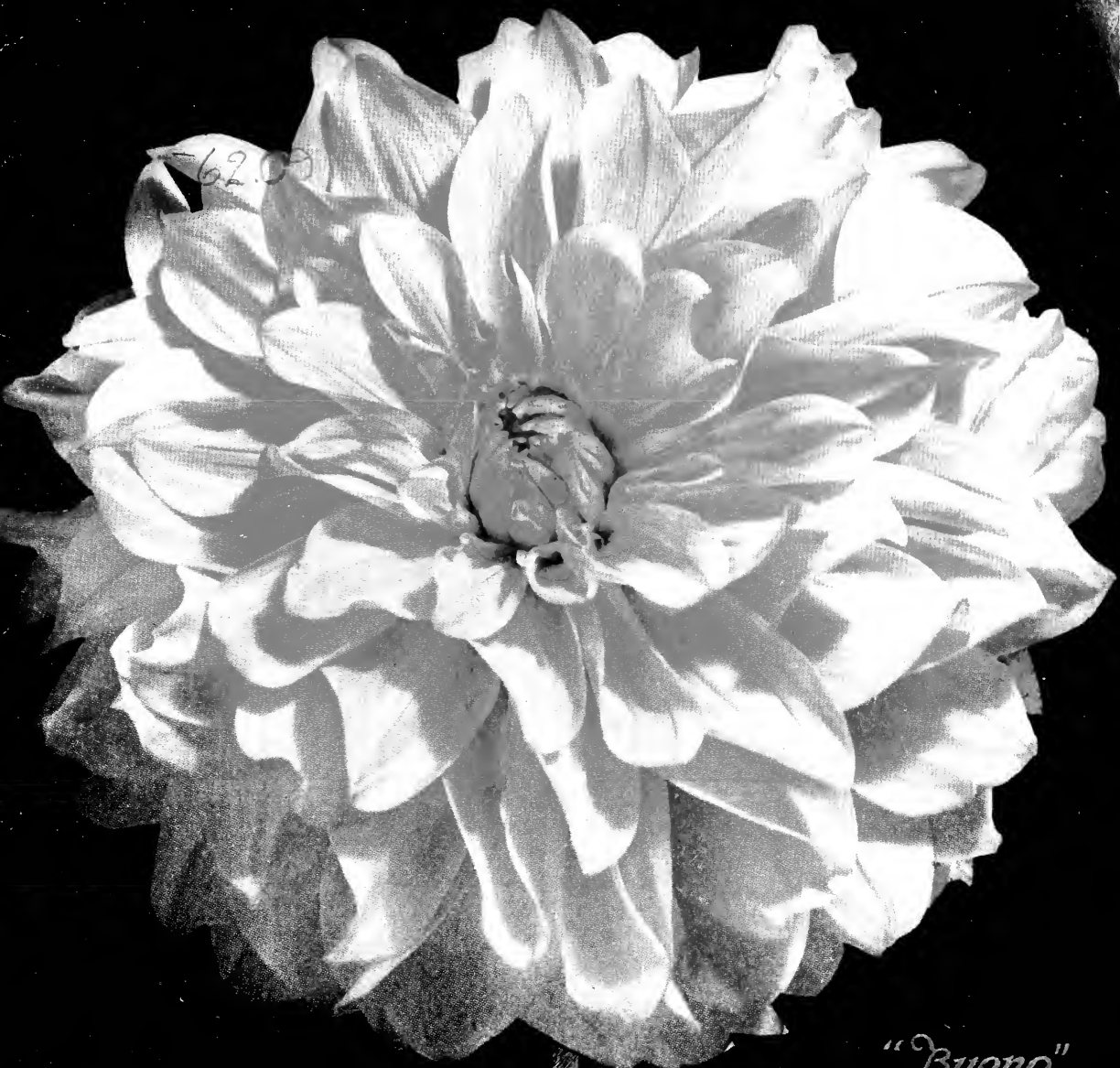
"Bueno" Decorative Dahlia