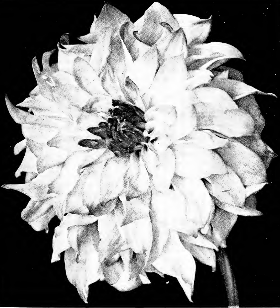
Decorative Dahlia "Shudow's Lavender"