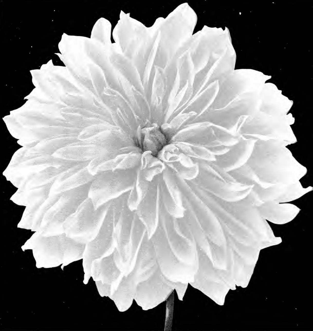
Decorative Dahlia "Oasis"