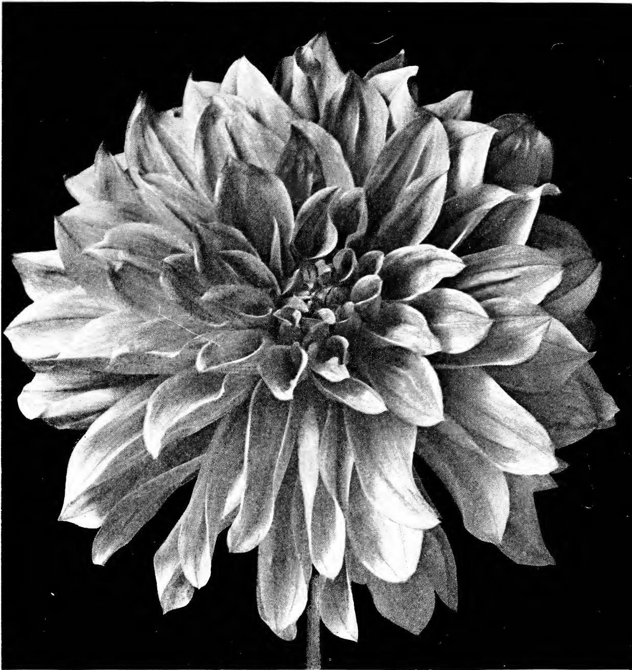
Decorative Dahlia "Faith Garibaldi"