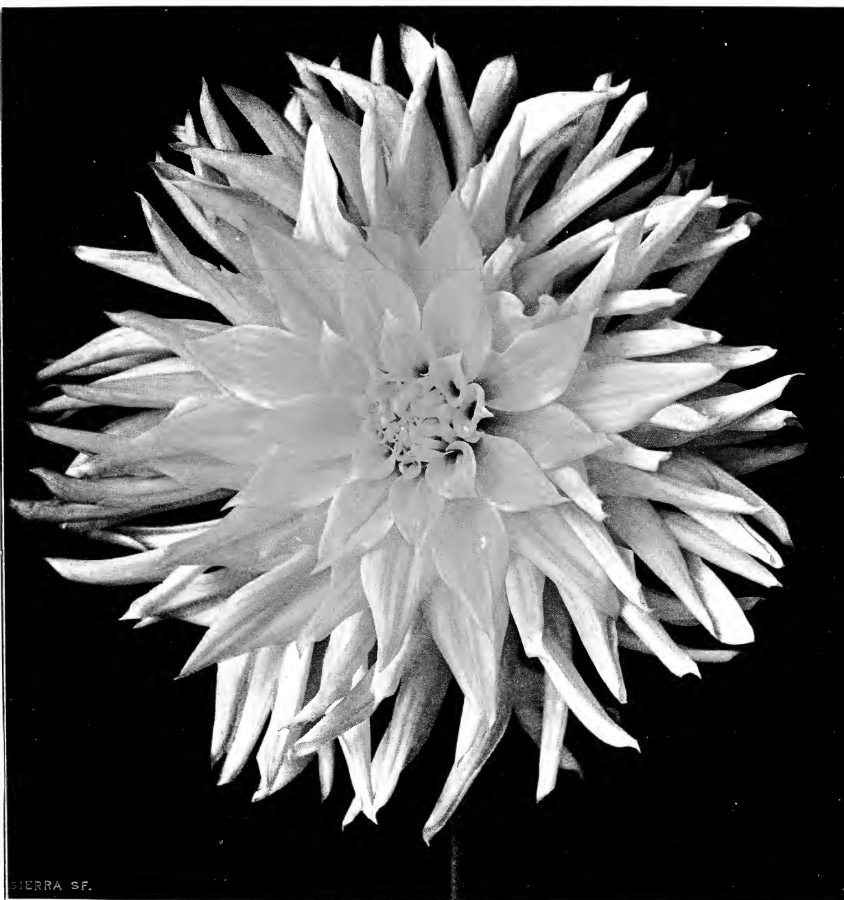
Hybrid Cactus Dahlia "Cinderelia"