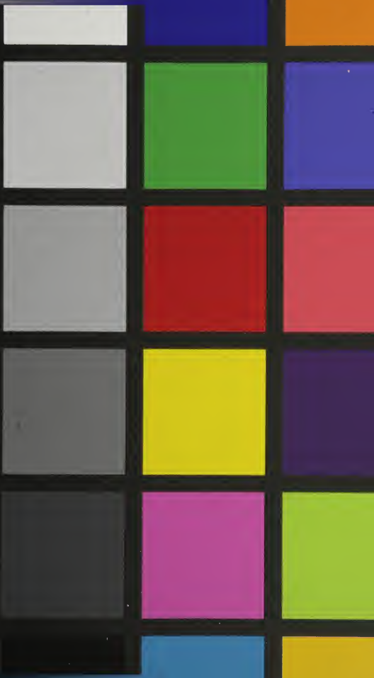
GretagMachbeth™ ColorChecker Color Rendition Chart