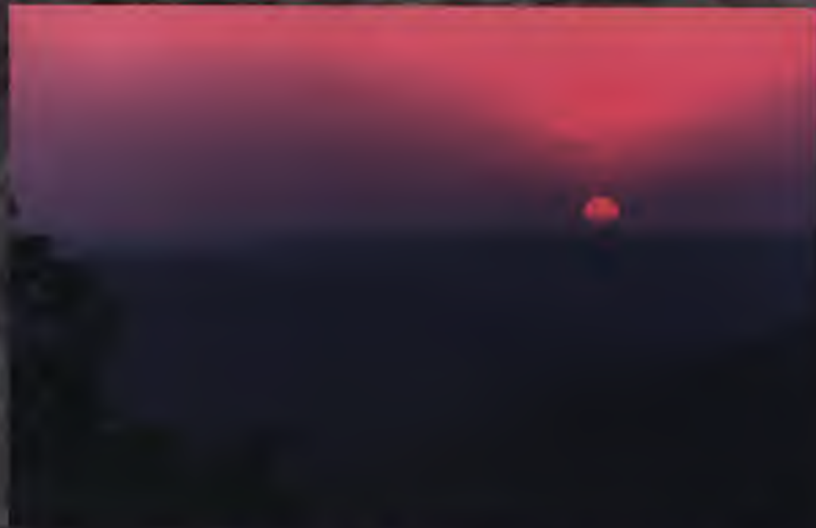
Sunset Over Lookout Mountain