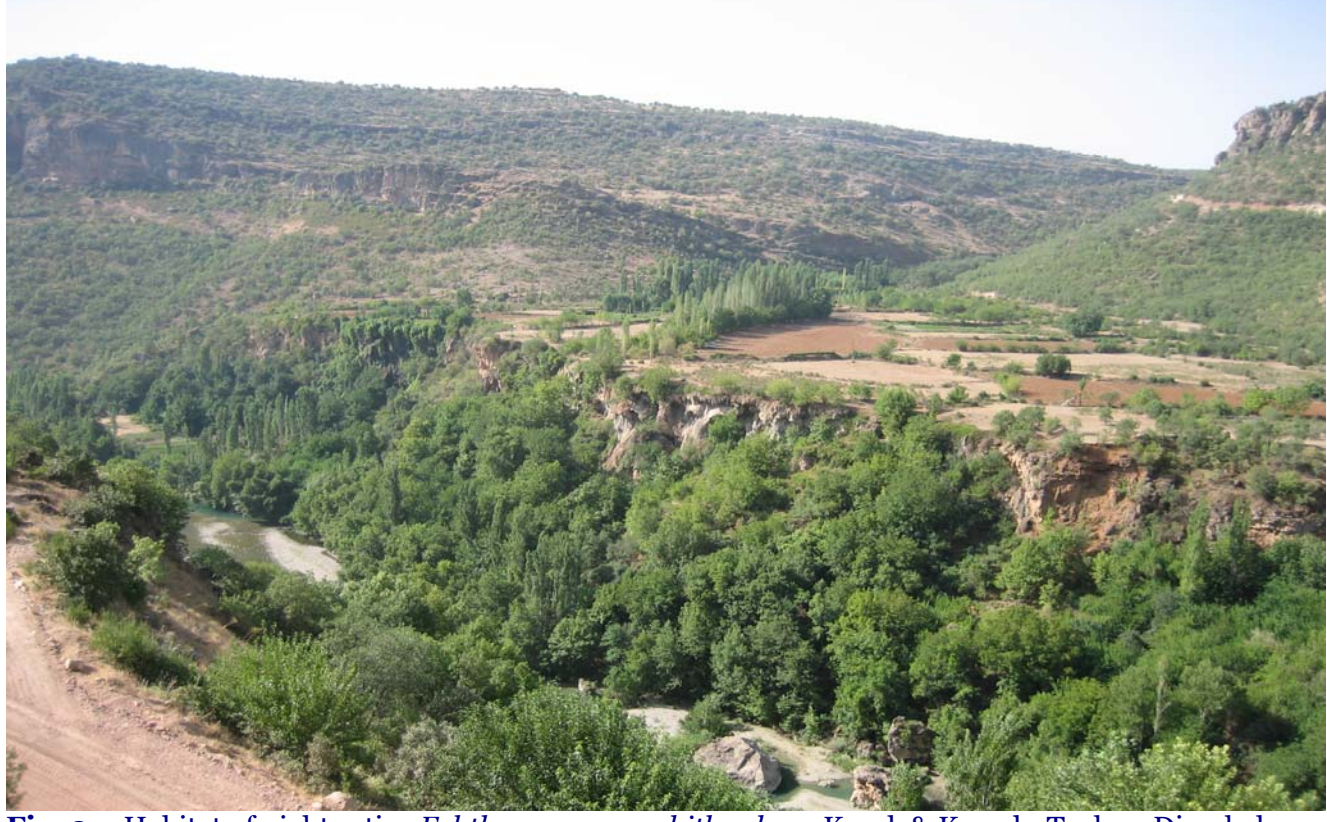
Fig. 3 — Habitat of night active Echthromyrmex sehitlerolmez Koçak & Kemal - Turkey, Diyarbakır Prov., Kulp, Taşköprü 22 July 2008