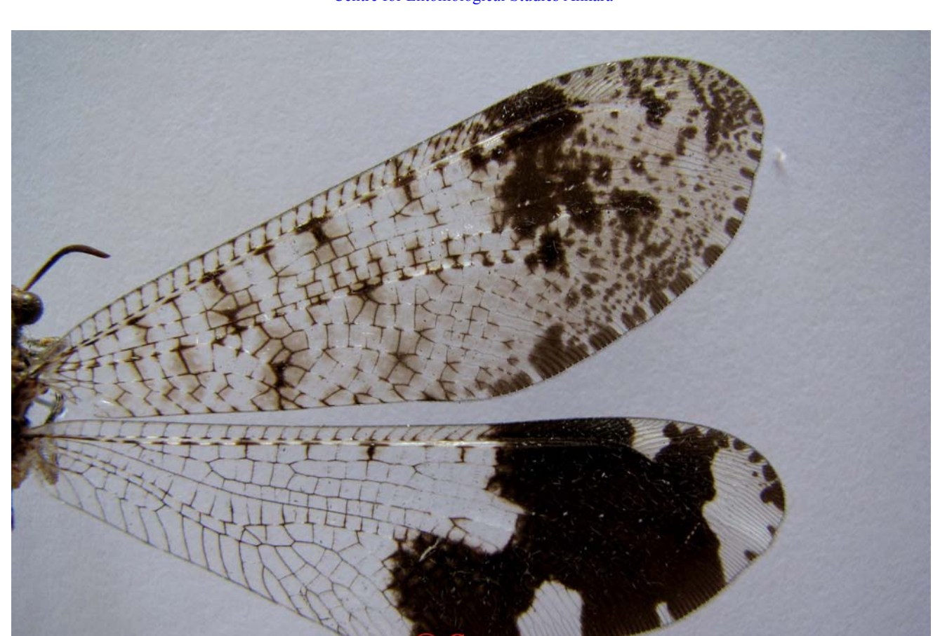
Fig. 2 – Echthromyrmex sehitlerolmez Koçak & Kemal - Turkey, Diyarbakır Prov., Kulp, Taşköprü 22 July 2008 M.Aydın leg. (coll.Cesa)