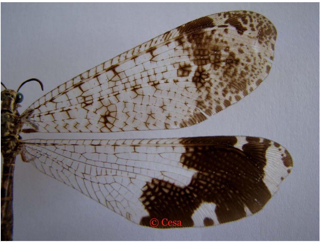
Fig. 1 – Echthromyrmex sehitlerolmez Koçak & Kemal (Holotype) - Turkey, Hakkari Prov., Yüksekova, Yeşiltaş Gorge