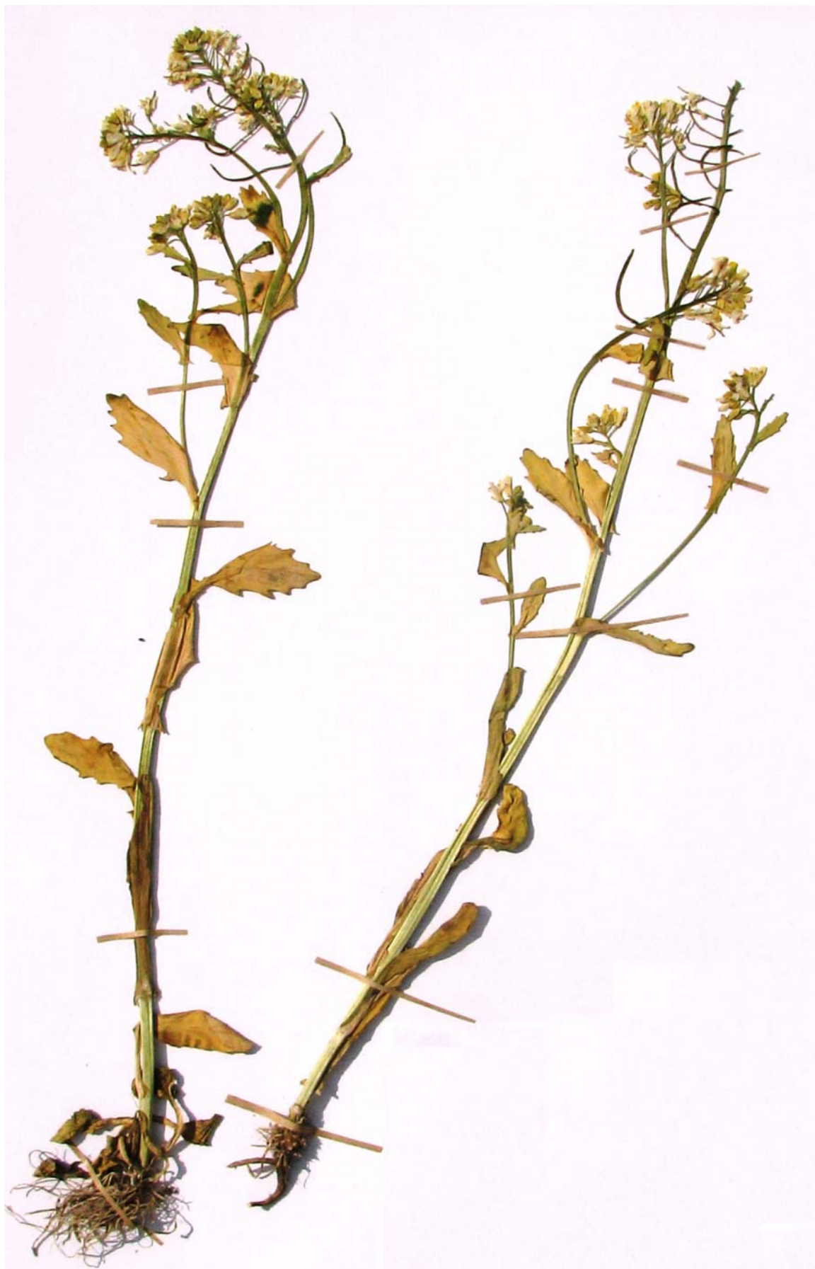
Fig. 1 - Barbarea plantaginea DC.