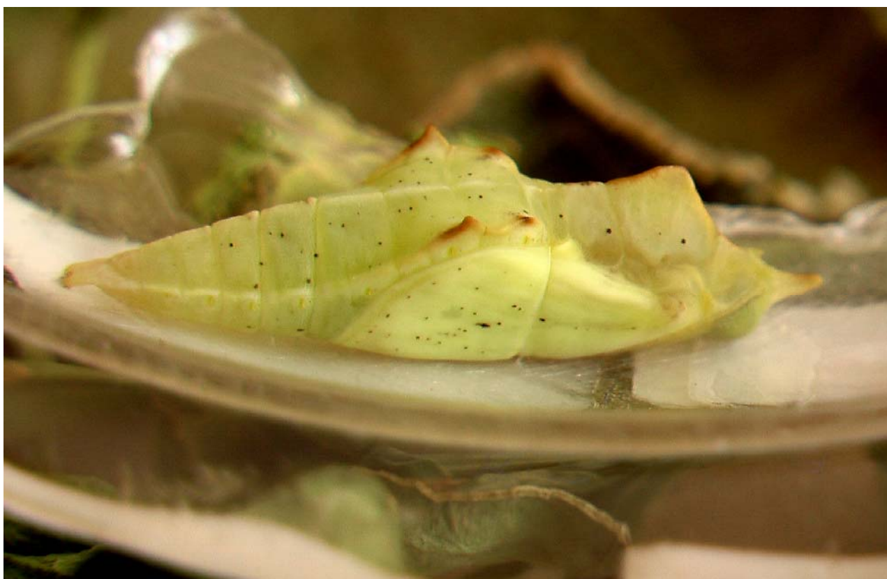
Fig. 4 - The lateral view of the pupa (09.07.2008)