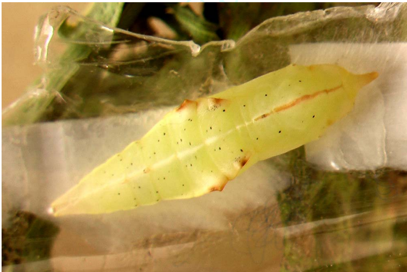
Fig. 3 - The dorsal view of the pupa (09.07.2008)