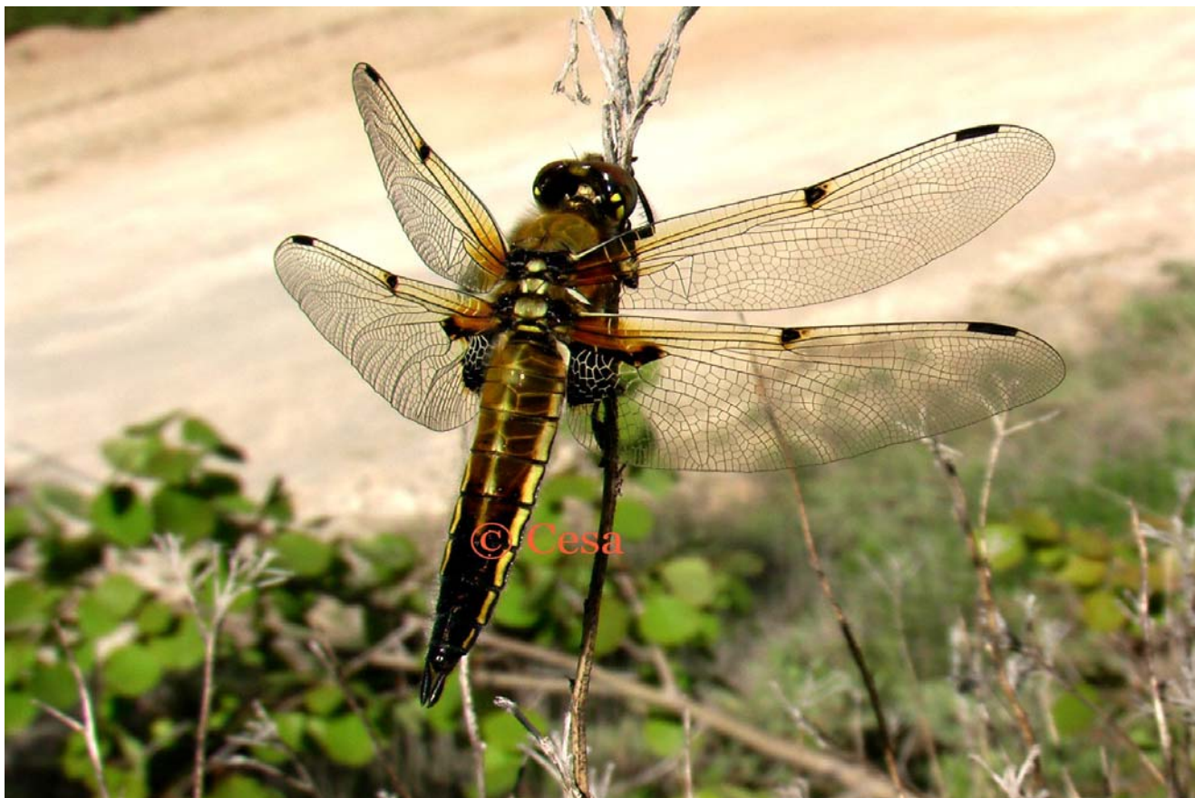
Fig. 7- Libellulidae Libellula quadrimaculata at rest. Turkey Bitlis Prov. Nemrut Ilkgöl 2300m 9 6 2007 PV16 M Kemal Cesa) [see Nr. 2665 in the list below]