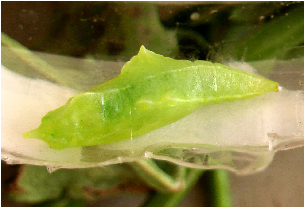
Fig. 2 - Young pupa of Pieris (Artogeia) persis Verity (05.07.2008)