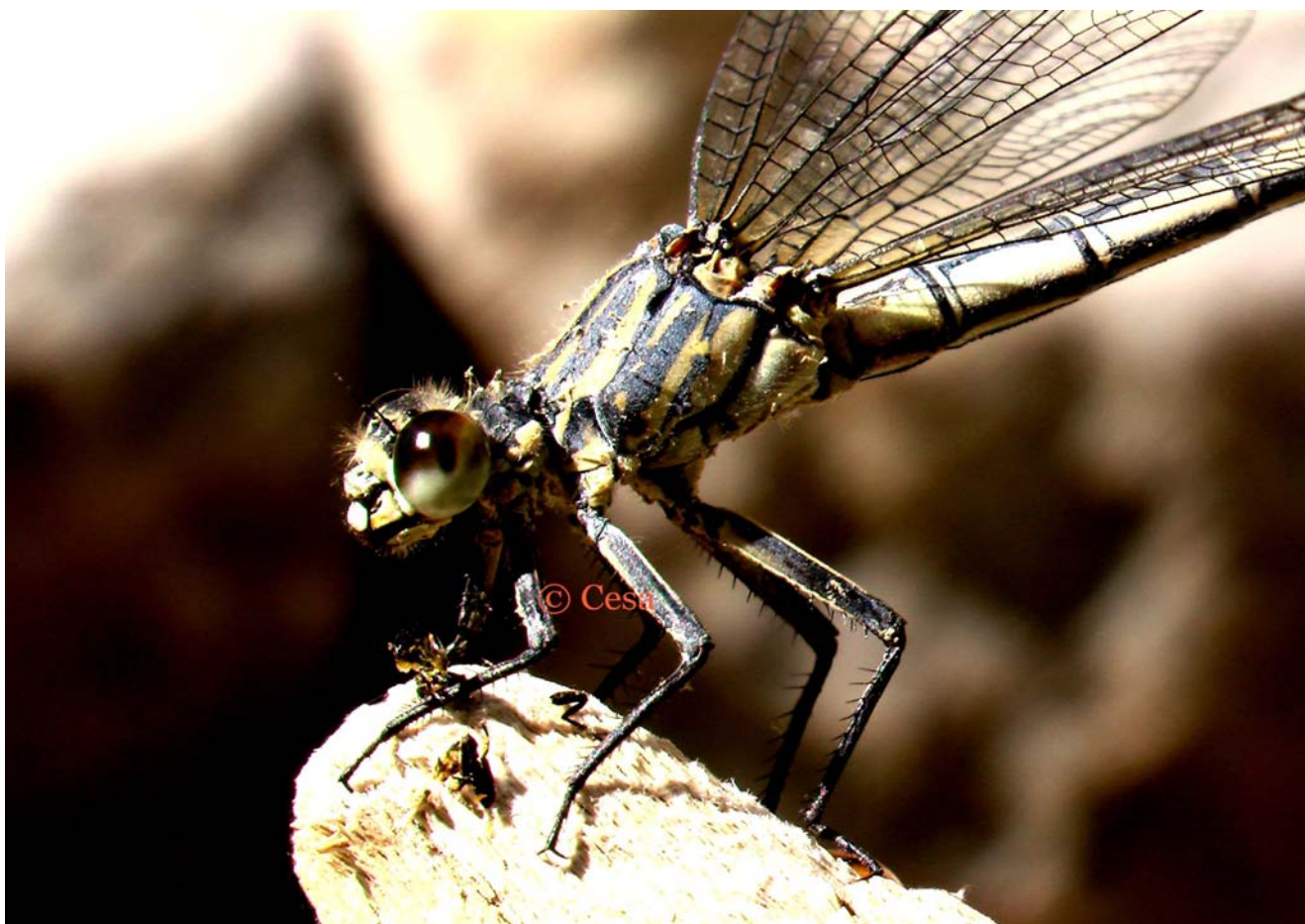
Fig. 3 - Epallagidae Epallage fatime (male) Turkey Batman Prov. Kozluk, Yazlı 720m, 7 6 2008 PV11 M Kemal (Cesa) [see Nr. 1757 in the list below]