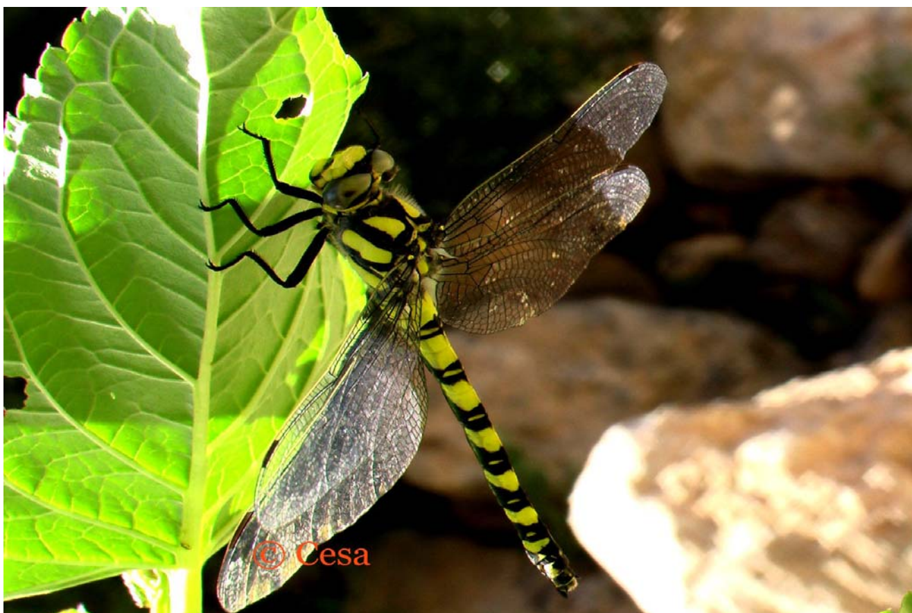
Fig. 1 - Cordulegasteridae Cordulegaster insignis at rest. Turkey Van Prov. Çatak Ardıç Vadisi 2100m 24 6 2007 [see Nr. 1241 in the list below]