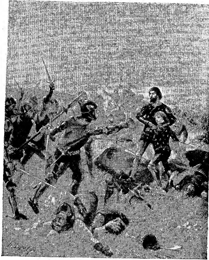
The Battle of Poitiers From the painting by H. Dupray (See page 52)