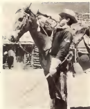
The call to Boots and Saddles . . .