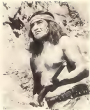
means trouble on the frontier