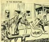
IN THE MEANTIME