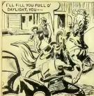
I'LL FILL YOU FULL O' DAYLIGHT, YOU --