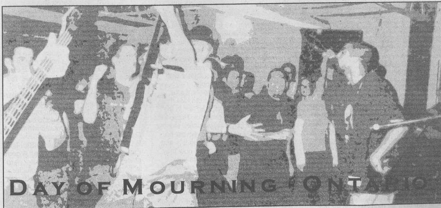
DAY OF MOURNING - ONTARIO

MRR: Day of Mourning have been a band plagued with controversy based