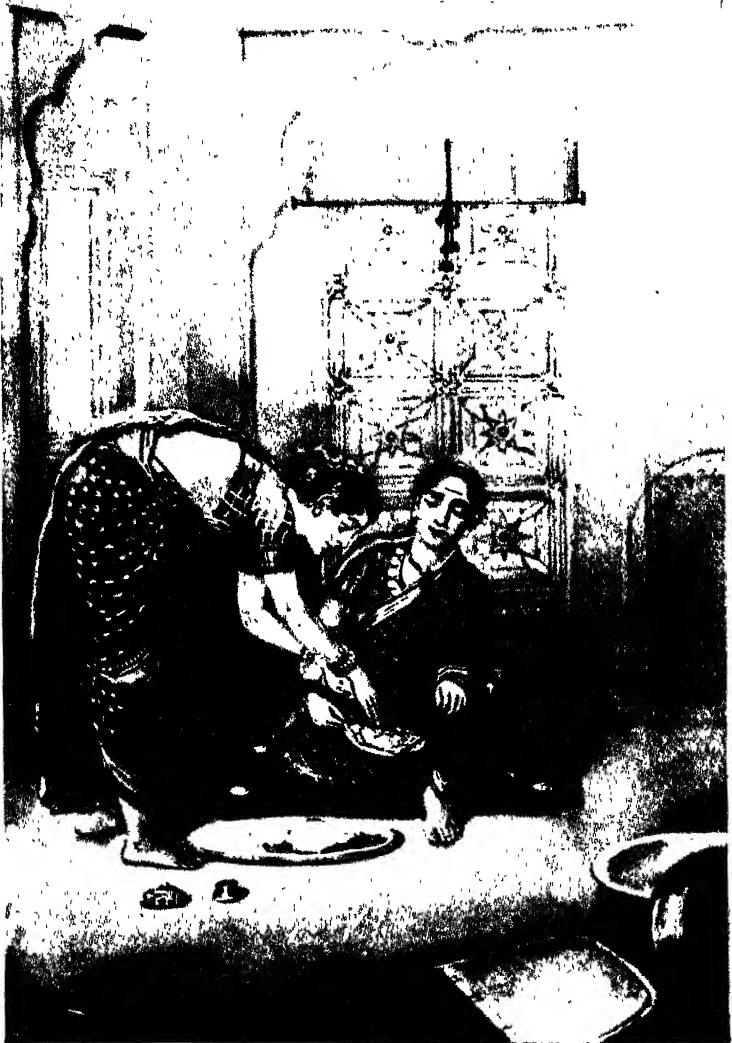
“AND FILL HER LAP WITH WHEAT CAKES AND BITS OF COCOANUT.”