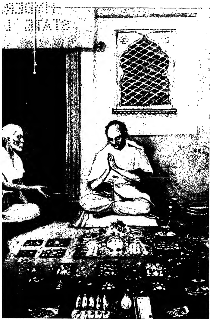
"THE MEMORIAL HONOURS TO HIS DEAD FATHER." . . . p. 108