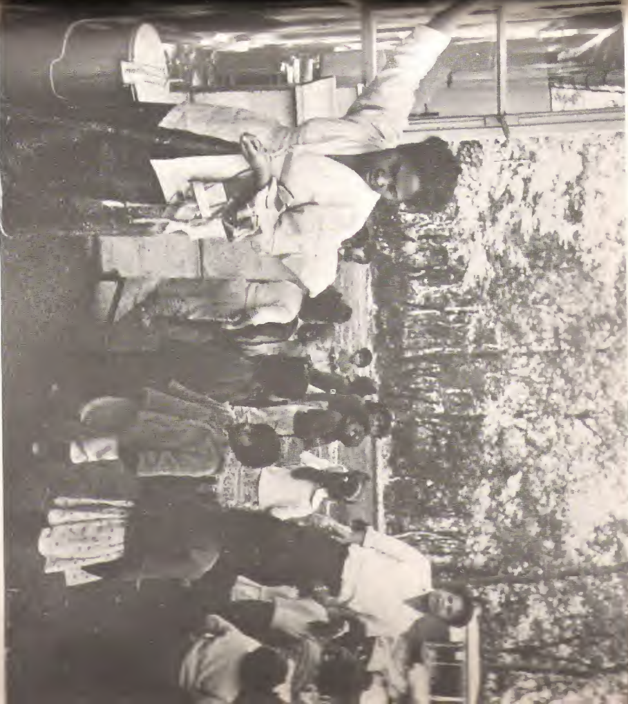
Over 20,000 Amboinese – former members of the Royal Netherlands Army, and their families – live in camps in the Netherlands. Now that their temporary stay in Europe is likely to be protracted they are probably being accommodated in permanent dwellings. The picture shows a tent-camp in Gaasterland (province of Friesland).

The last group of repatriates is completely foreign to life in the Netherlands. Without hardly any transition they find themselves placed in quite different circumstances and in an entirely