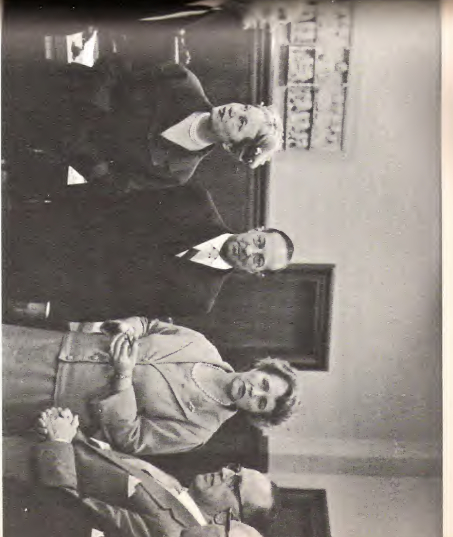
Dr. Marga Klompe, the first Netherlands woman to become a Cabinet Minister (appointed 1956), initiated regular consultations on family problems.

The importance of good accommodation for these families continued to be realized. This found expression among other things in arrangements made by the Ministry of Housing and Building allowing of financial facilities for extra provisions which were required in the homes of the families. In incidental cases the Ministry of Social Work also cooperated in the provision of rent allowances, etc. The broader approach which developed in the years after the war — during which the importance of good accommodation continued to be recognized — was based on