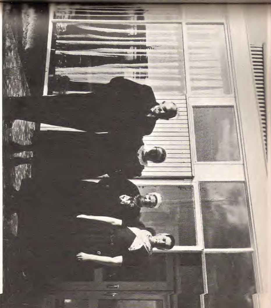
Traditional costumes are still worn on special occasions even where they are no longer in daily use, as is shown in this picture of the opening of the new village centre in Oosterwolde (province of Gelderland). About 190 village and community centres were built with Government subsidy after the Second World War. This has put new life into local clubs and associations.

Homemakers' services quickly sprang up over the whole of the Netherlands. The break-up of many families during the occupation had given rise to the formation of teams of young women in