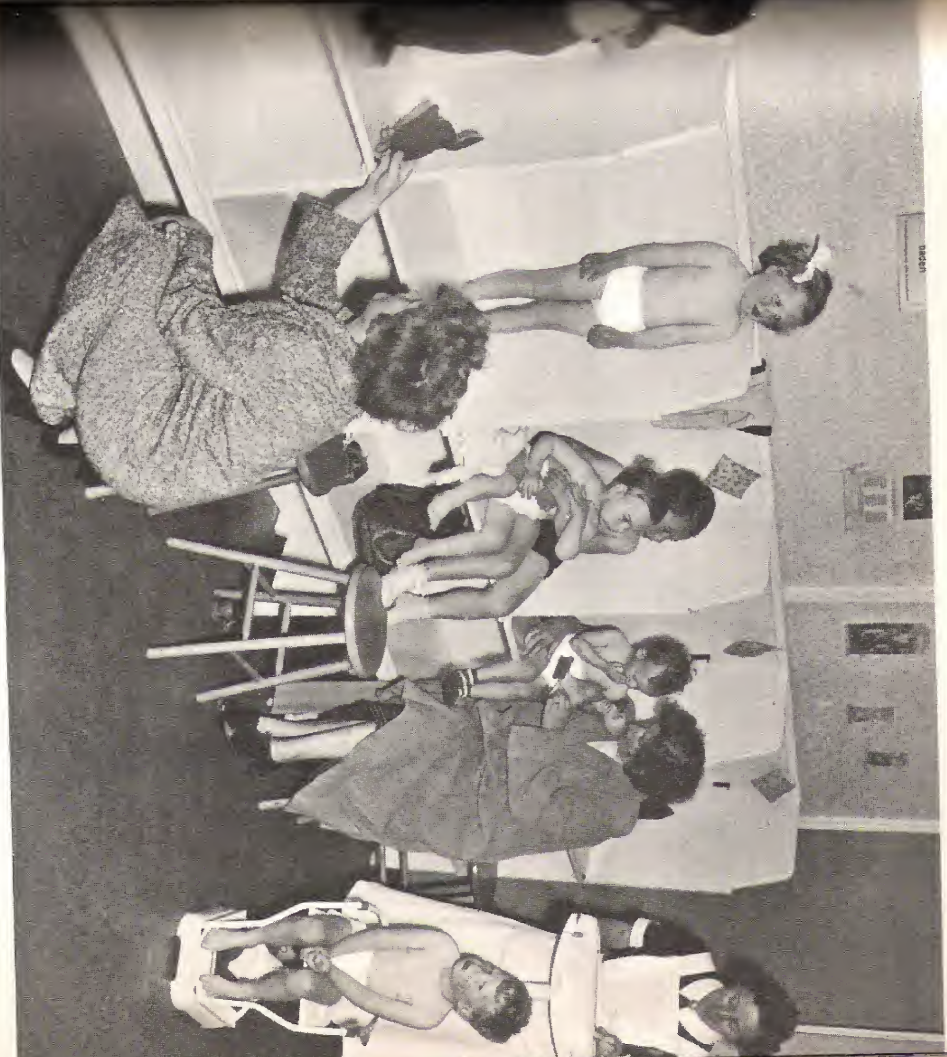
Dressing cubicles in an infants' welfare centre.

Occupational health work started many years ago in large firms. The number of doctors employed