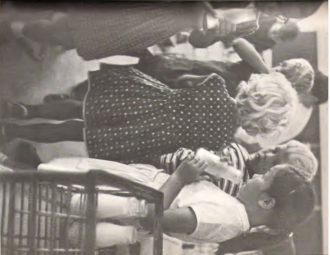
Sunny morning. Milk for every child in primary schools.

Medical and Allied Personnel. Medical training may be obtained at the State Universities of Leyden, Groningen and Utrecht, at the Municipal University of Amsterdam, the Roman Catholic University of Nijmegen and the Free (Reformed) University at Amsterdam. In addition, students can receive clinical medical training at the Institute for Clinical Training at Rotterdam. Anyone who holds a secondary school diploma (science stream) can be admitted; usually this diploma is obtained at the age of 18 years. The duration of studies for a medical degree is from 7 to 8 years. The degree entitles the holder to practise medicine without restriction. Specialist training is under the supervision of a board consisting of representatives of the national medical association (Royal Netherlands Medical Association) and of the universities. The duration of training is from 4 to 8 years, depending on the speciality.