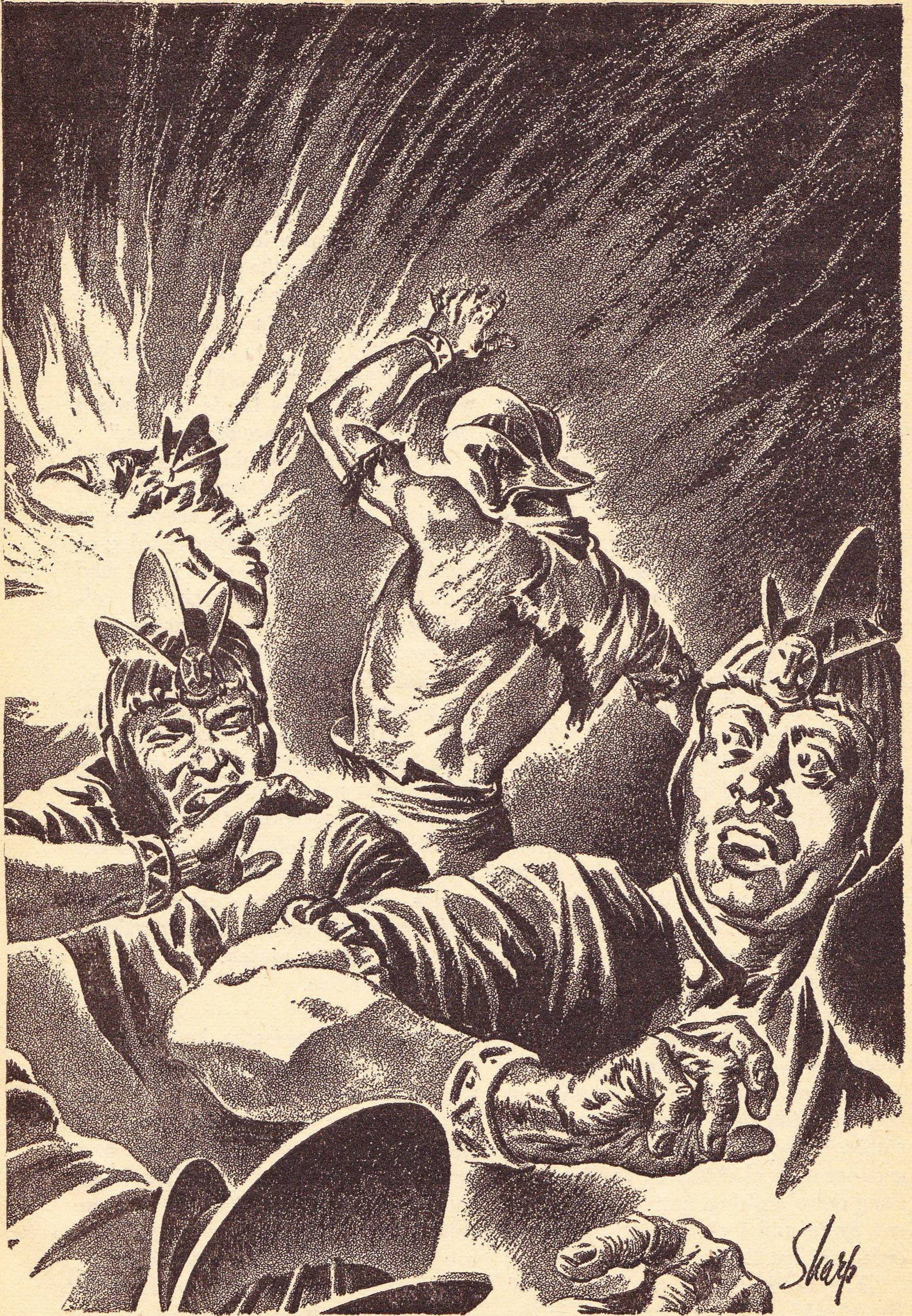
The gun blasted a stream of fire and death, and cries of pain filled the air . . .