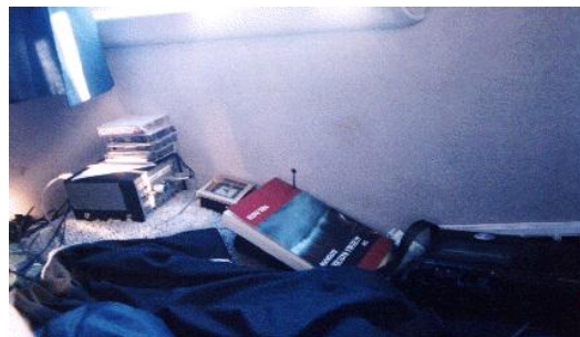
View of WR-4B VLF receiver with filled cassette tapes atop it, and the Marantz PMD-212 recorder inside van at bedside. (The book in the photo next to the tape recorder is " The Aurora Watchers Handbook " by Neil Davis, U. of Alaska Press, 1992)

By 2055 UT, a few 'hooks' began to be heard and alternated with low whooping chorus risers. Another great recording - CD quality for sure! This wonderful sounding VLF activity continued along with great 'roaring' hissband all the way past 2239 UT (5:39 p.m. CDT) - an all day chorus event once again!