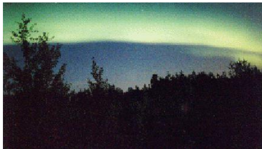
This is a typical "quiescent auroral arc/arch" which was often visible to the north before it became more active. 25 August 1996

Note: This auroral "arch" or "arc" - not unlike a flattened green rainbow - is actually the visible part of the auroral oval which crosses almost directly overhead over Lynn Lake and Churchill, Manitoba most nights. As I was about 200-300 miles south of this "average" auroral oval location (it does move north and southward depending on magnetic activity), this auroral arch/oval was usually visible anywhere from 10 - 30 degrees above the northern horizon (at max. height/alt.) soon after evening twilight faded in the west. The very faint (IBC I) "hydrogen-arc" was also often visible to the south of the main auroral oval arch. Later on each night, the arch would start to form discrete auroral displays and forms usually by 10:30 - 11 p.m. local time (CDT) and usually starting in the north-eastern section of it (typical pattern, as locations eastward usually start to see the discrete auroral forms begin first, and they soon move westward as the auroral-oval undergoes substorms.-