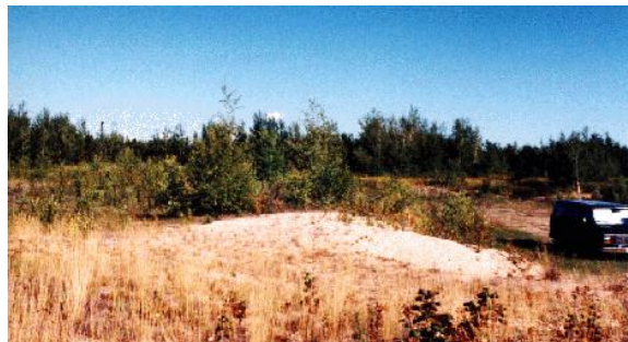
Daytime view of listening site and van amongst the northern boreal forest

By 2314 UT, The hiss has greatly declined in strength and there are nice "nose" -type falling whistlers happening (unique to these higher latitudes) and which are fairly diffuse (not pure-tone).