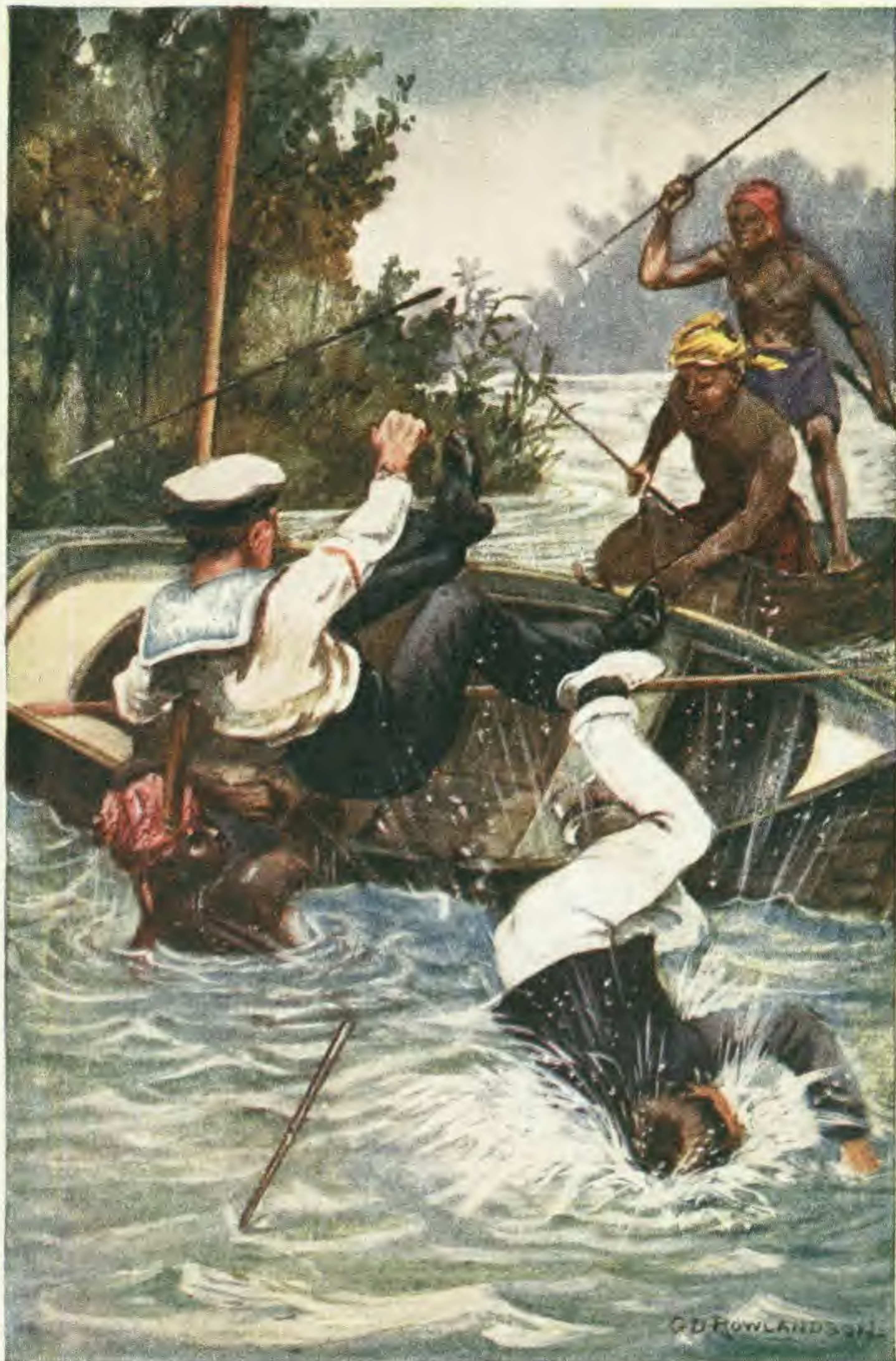
"SENT IT OVER, AND BOB AND THE SAILOR INTO THE STREAM." [See page 115.]