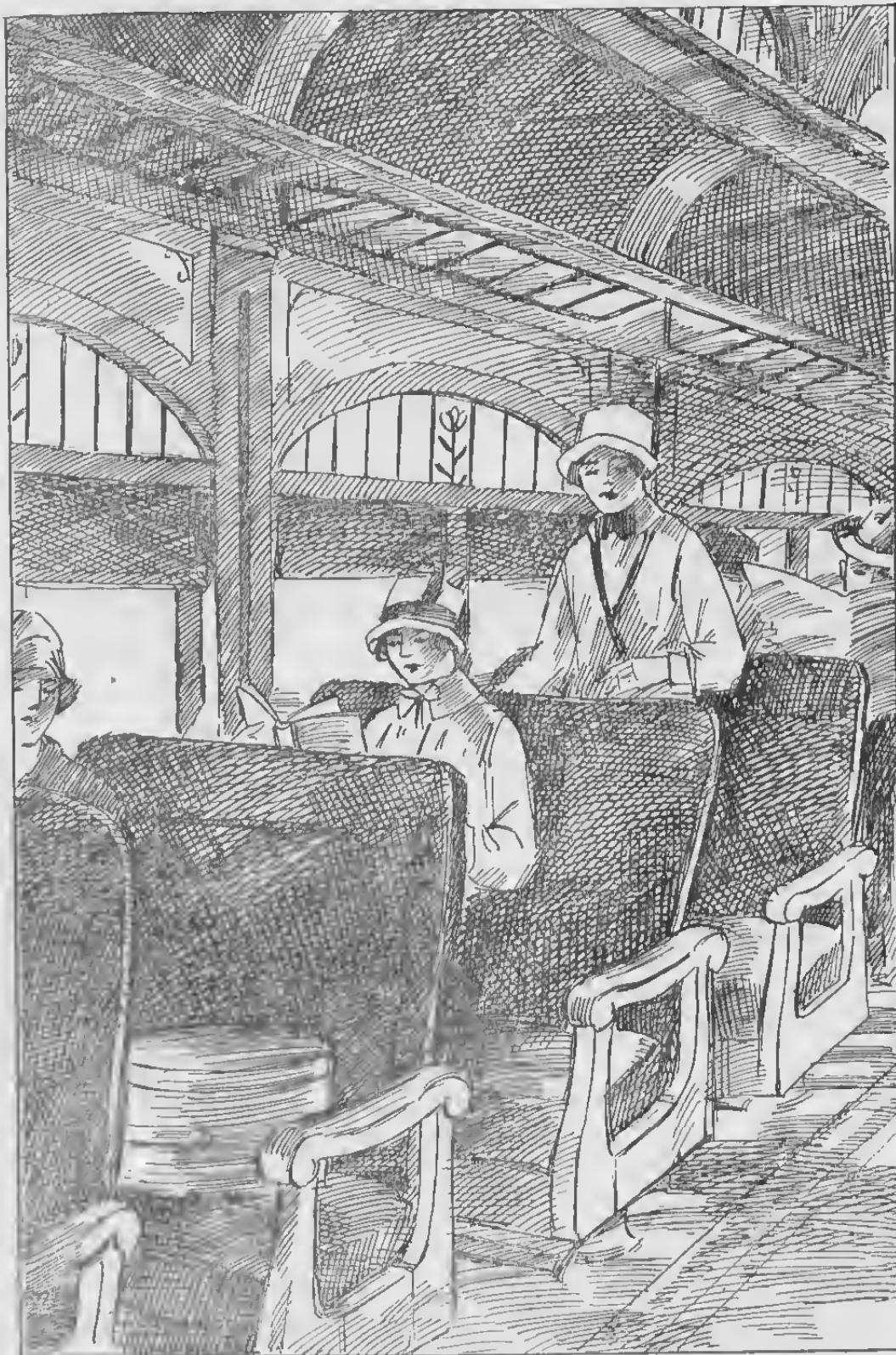
THAT WAS HER BOOK. 21