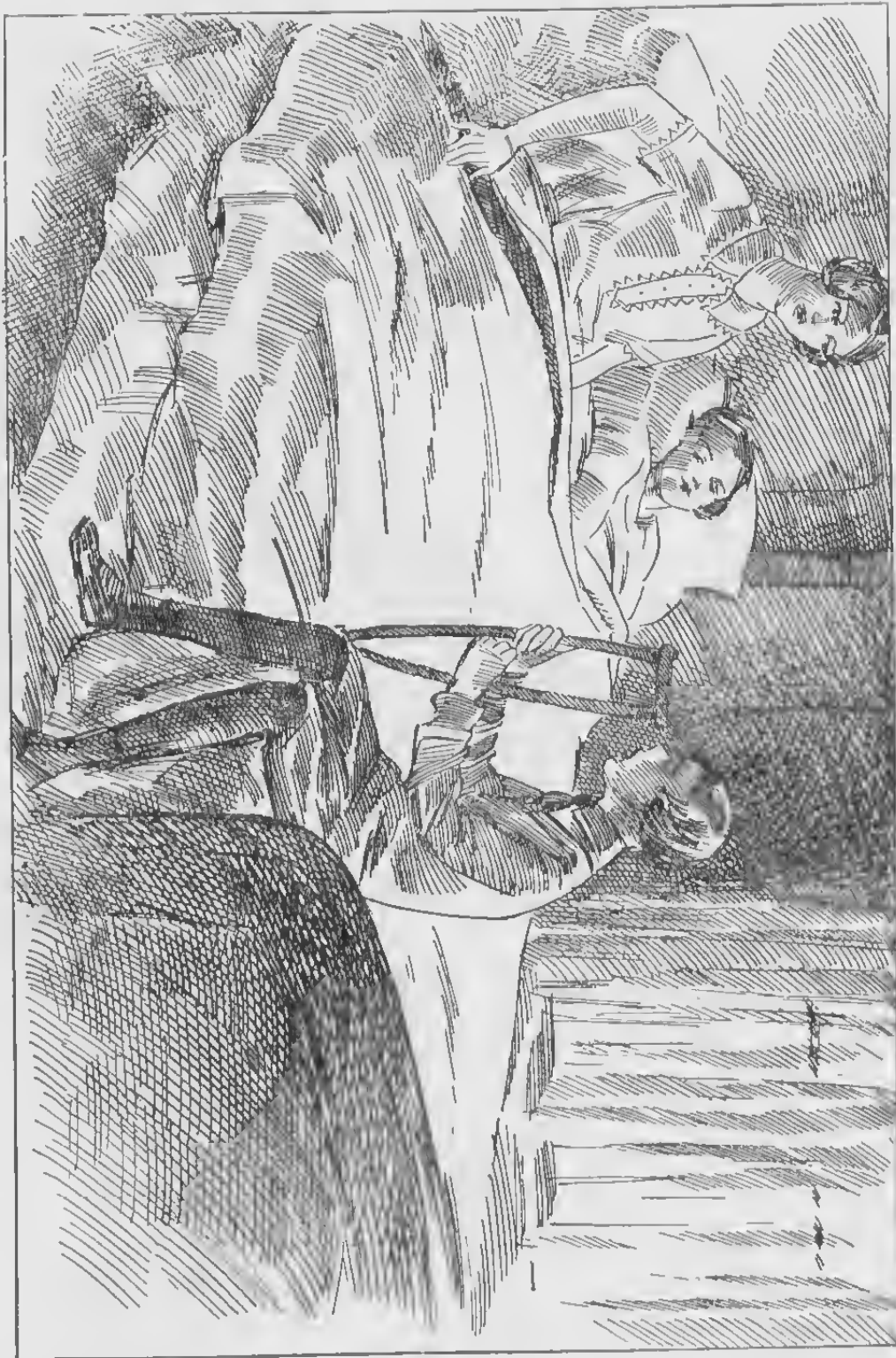
“TIMOTHY LEAVITT, WHERE IS IT?”