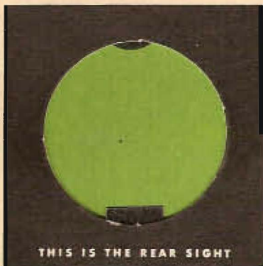
THIS IS THE REAR SIGHT

IN SIGHTING AND AIMING, THERE'S NO SUCH THING AS ALMOST RIGHT