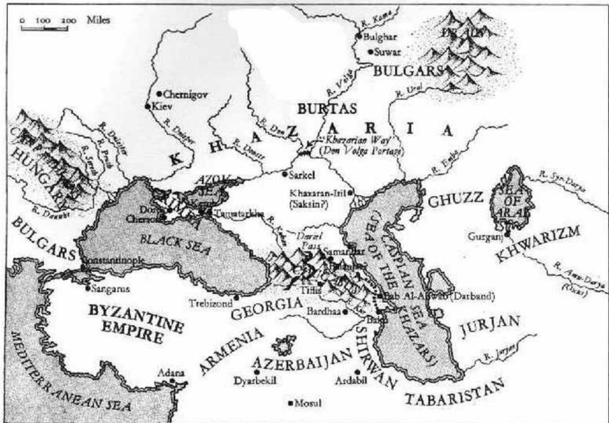
(ABOVE) the land of the Khazars (Scythians), who became the Zionists of today.

The entire history of the European Zionist movement originates from Khazar affairs, not from Israelites. Zionism's early history was atheistic and Communist - not religious. Zionism is, at its core, politically totalitarian and hostile to all religions. The mantle of religiosity was only taken on by Zionists reluctantly in order to manipulate Christians in America and Europe.