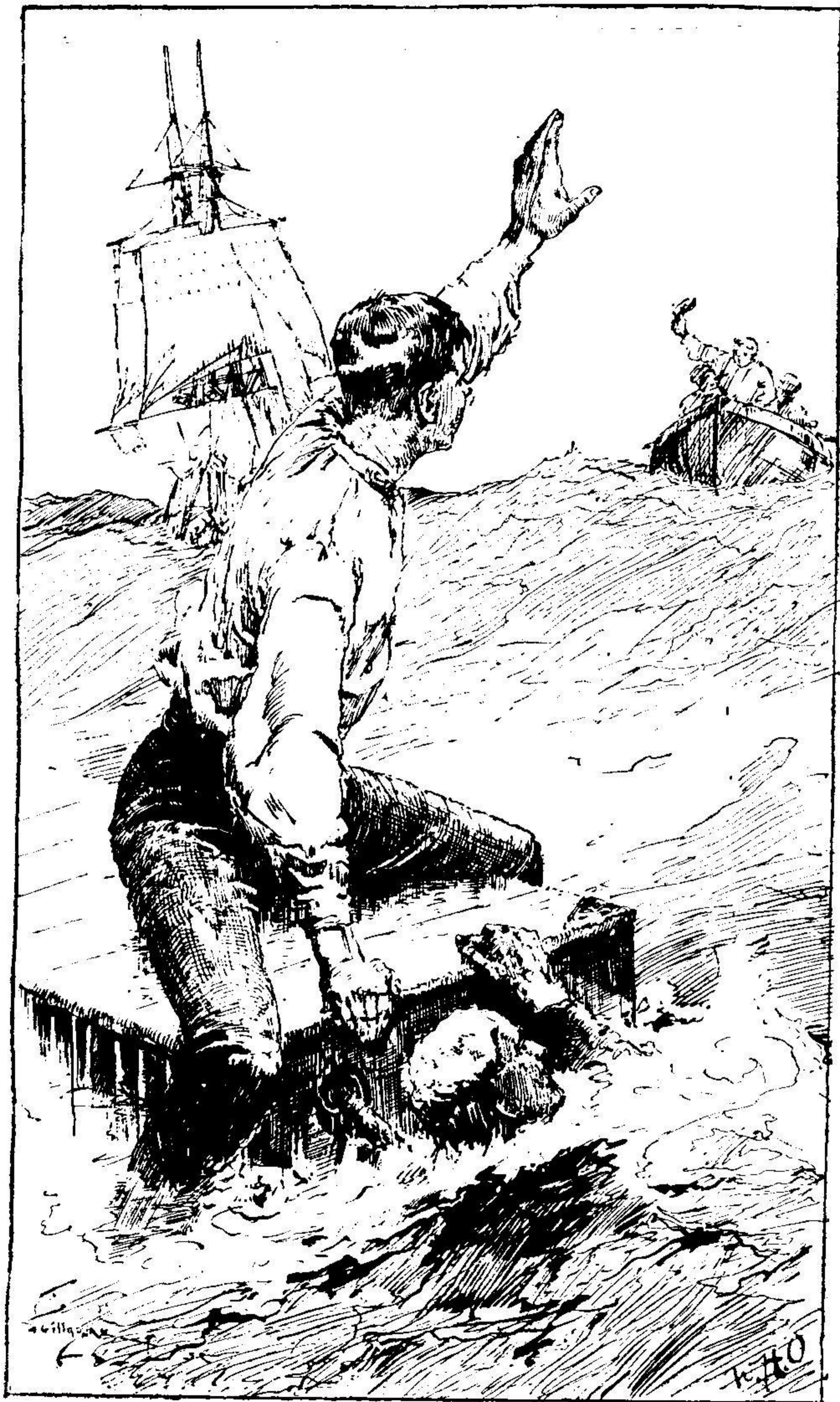
““ THEY HAVE LAUNCHED A BOAT, AND IT IS PULLING TOWARDS US NOW ’” (p. 222).