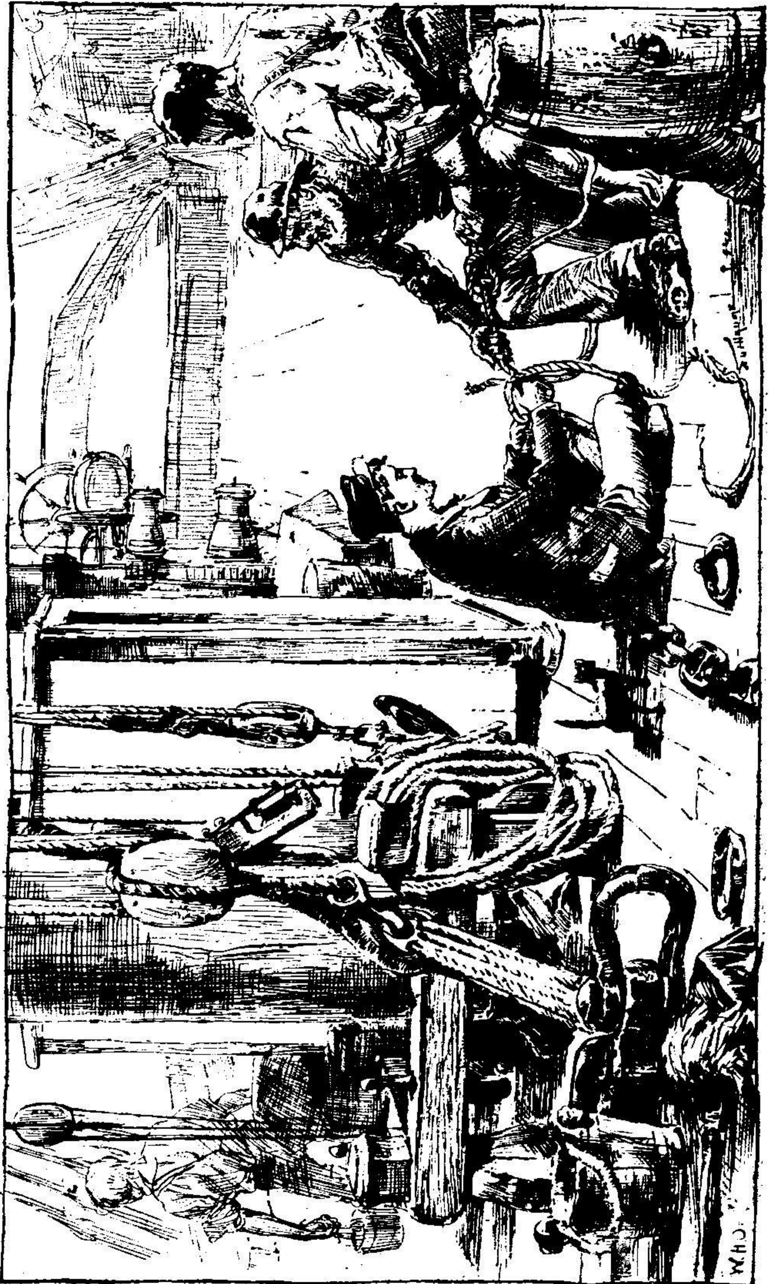
“IT WAS MY DELIGHT TO BOARD THE DIFFERENT VESSELS AND MAKE FRIENDS WITH THE SEAMEN” (p. 45).