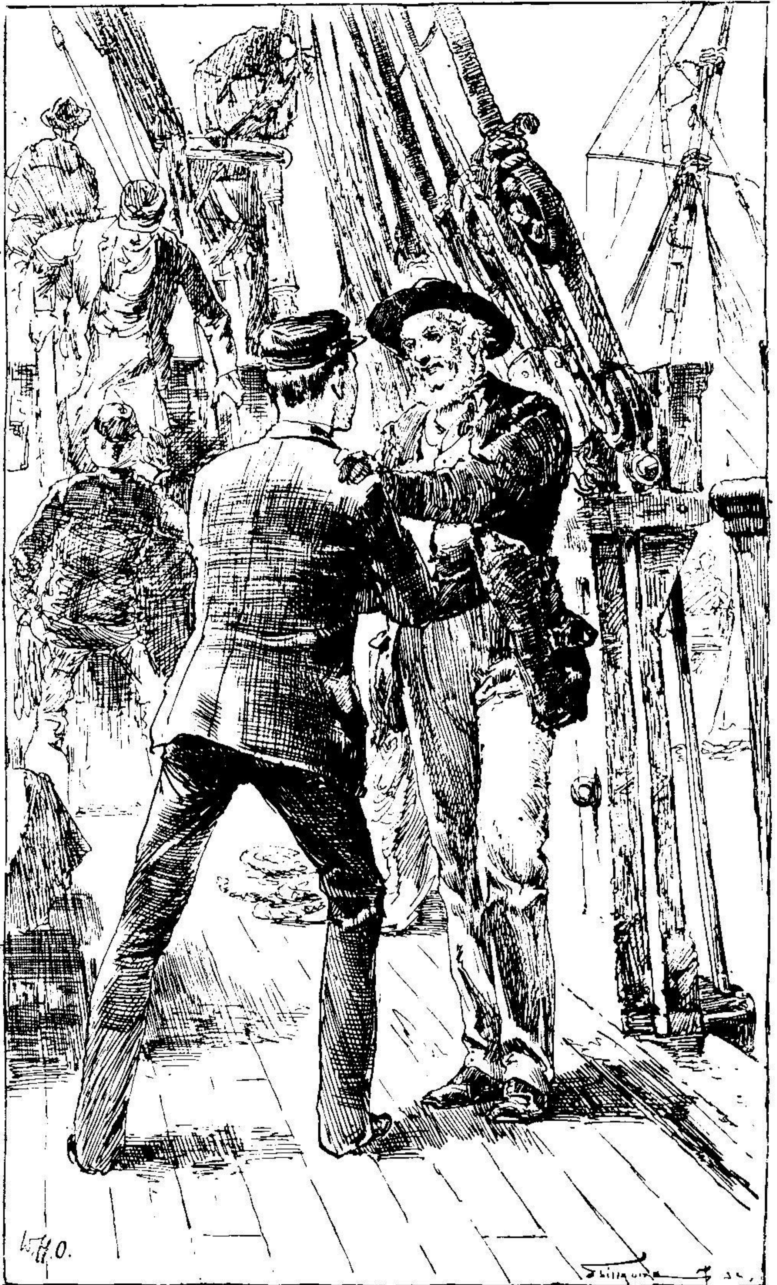
“ ‘GOOD-BYE, MY COCK-BIRD,’ SAID HE, WRINGING MY HAND ” (p. 129).