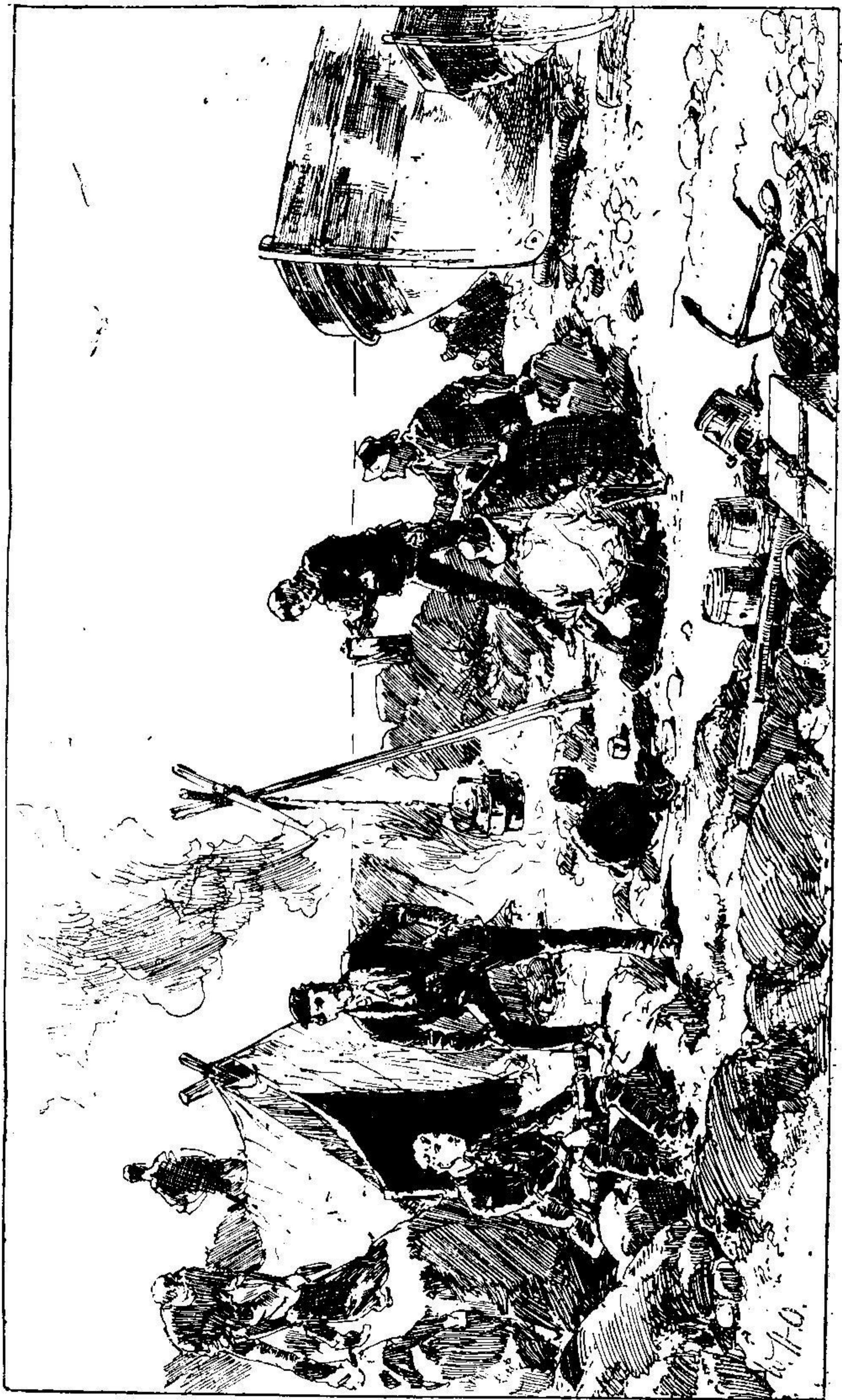
“A LARGE TENT HAD ALSO BEEN RIGGED UP . . . MAKING THE PLACE HAVE THE APPEARANCE OF A COSY ENCAMPMENT” (p. 256).