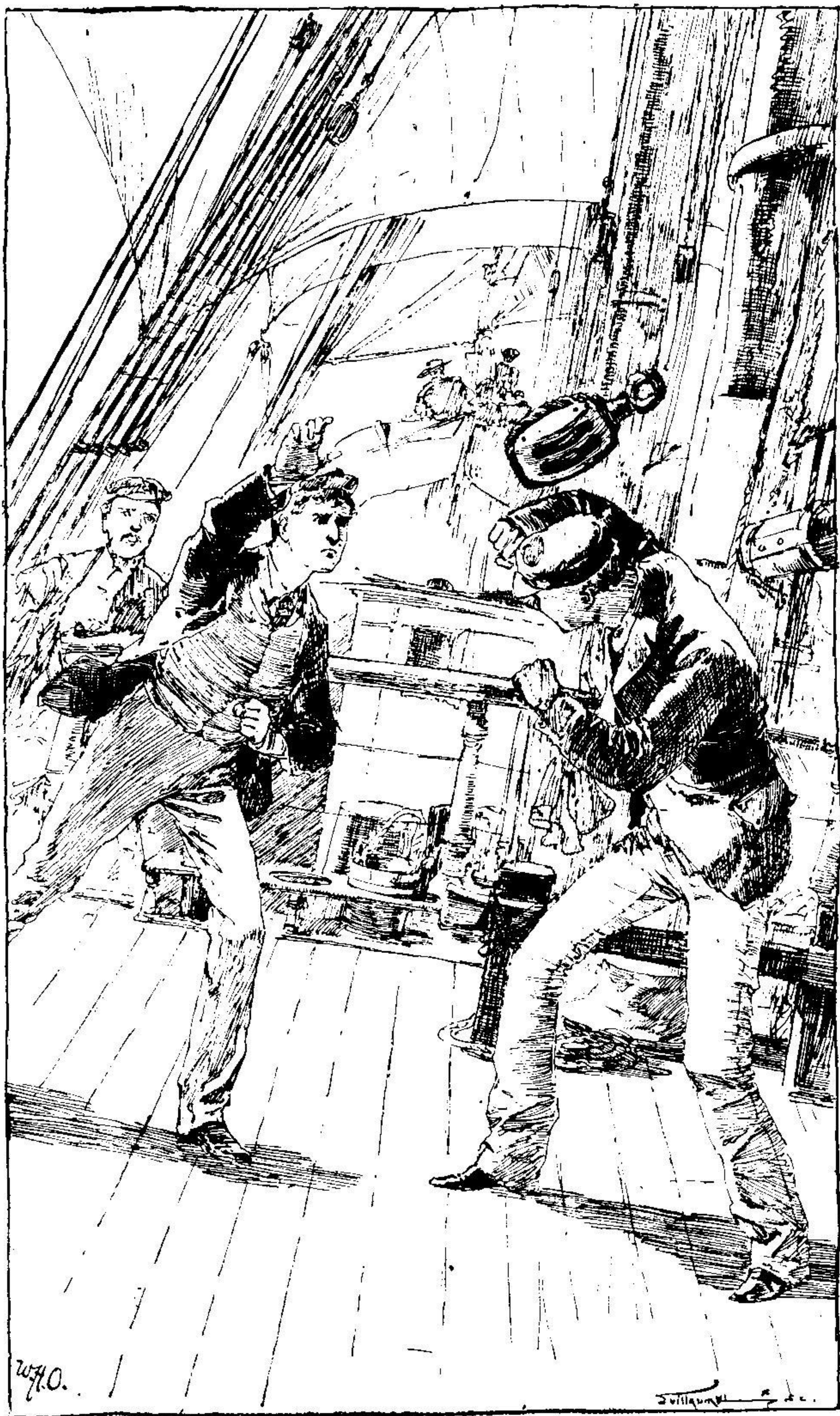
“HURLING IT AT HIS HEAD WITH ALL MY FORCE” (p. 171). (Frontispiece.)