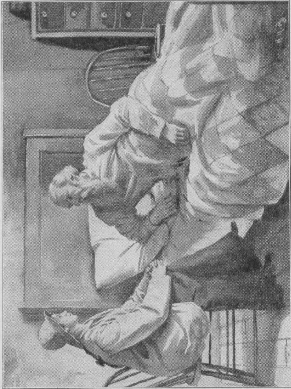
"JUDY!" HE CRIED, "IT'S GOT TO BE DID!"