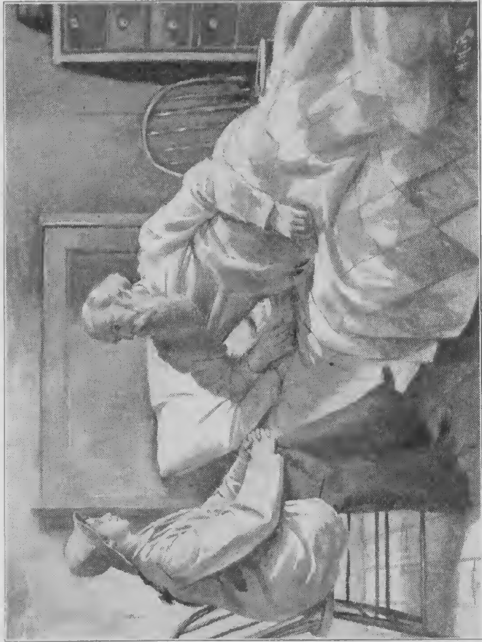
"JUDY!" HE CRIED, "IT'S GOT TO BE DID!"