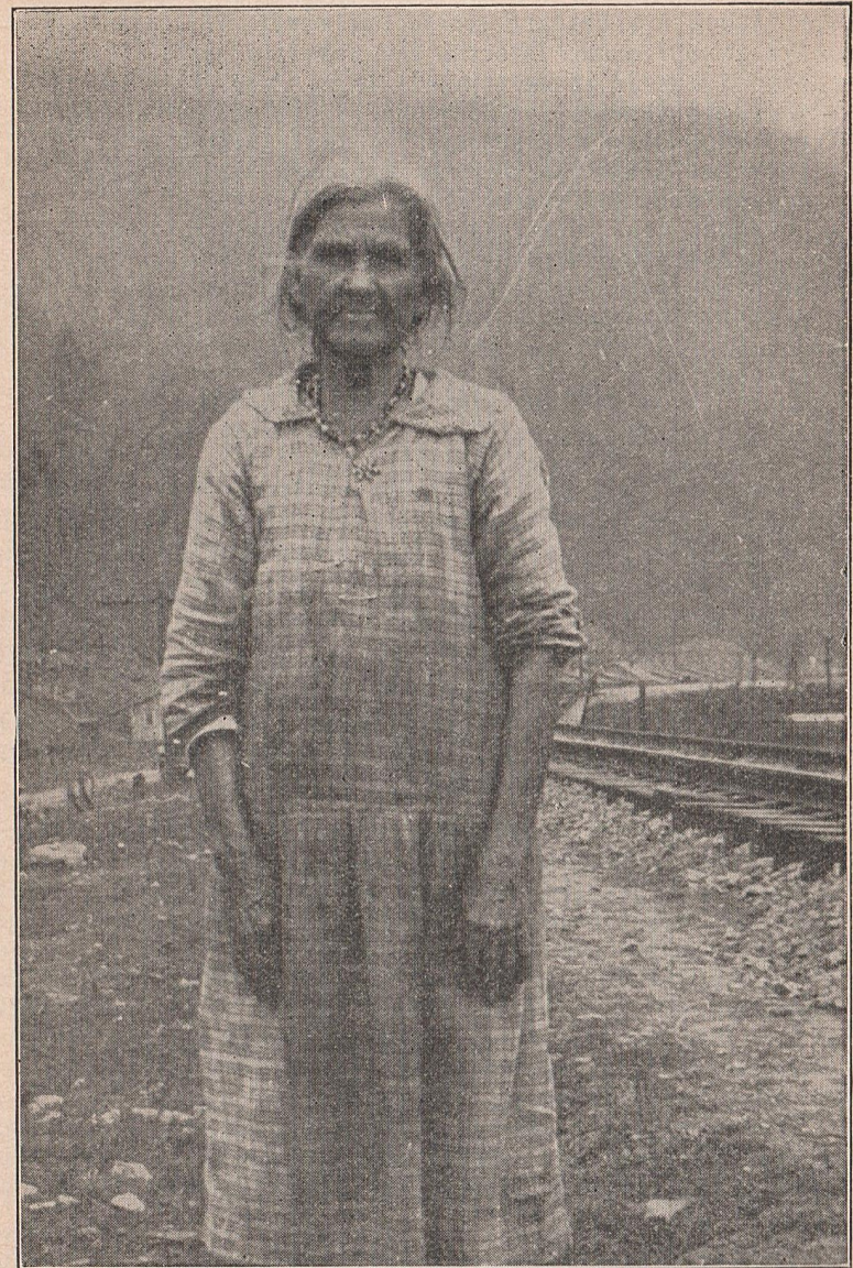
The Mine-Owners Want to Cut Wages

"My children don't know what the movies is," she said. "They don't know about no such things. They don't know what a radio is. For a while we got some food from the