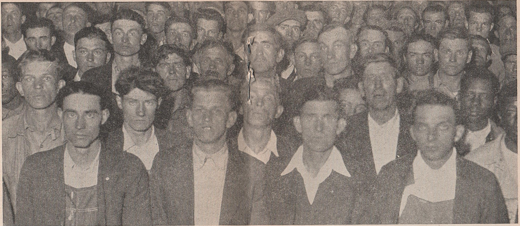
One of the first organization meetings of the National Miners Union held in Evarts, Kentucky, last spring.

"Just plainly speaking, the company is less interested in the miners than in their mules. They haven't got the sympathy for the men that people has got for livestock. These houses are not fit for pigs, and the company doesn't fix them. This winter, with the cold blowing in, and with the people undernourished, they will face terrible sickness. If I had a milk cow or horse, I certainly would be more interested now than the coal operators are in these people."