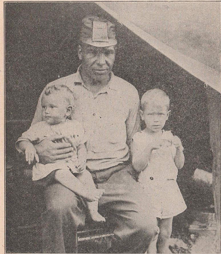
The Strike Is for Them

Usually, the coal company deputized gunmen would come up to a soup kitchen at night and dynamite it. When they found the miners protecting these soup