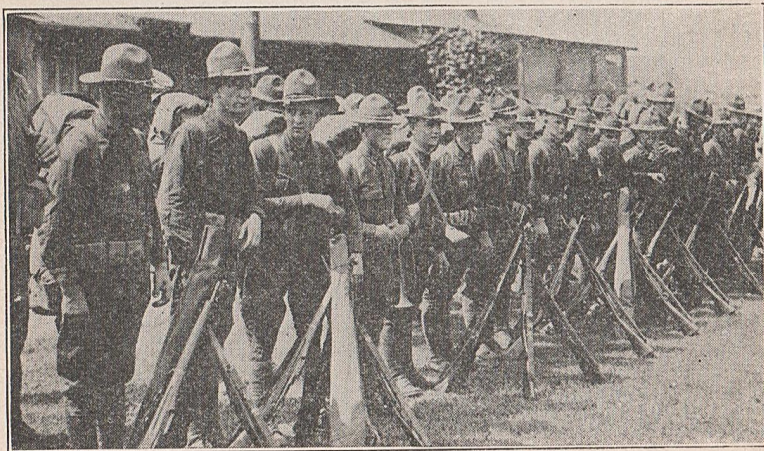
The National Guard—the Trump Card of the Operators

To work in the Harlan coal mines simply means you starve a little more slowly than when you are out of work or on strike. No miner in Harlan or Bell County, during the past two years, has been heard