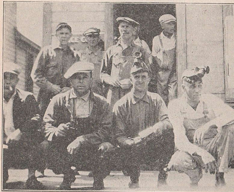
A Typical Group of Native American Miners

A STATE of civil war resulted. The miners throughout Kentucky were aroused to a fighting pitch. The issue was clear. The coal operators, following their policy of slashing wages, imposing worse and worse conditions on the miners, were determined to use every weapon, from their state machinery down, to crush the growing organization of the miners. The