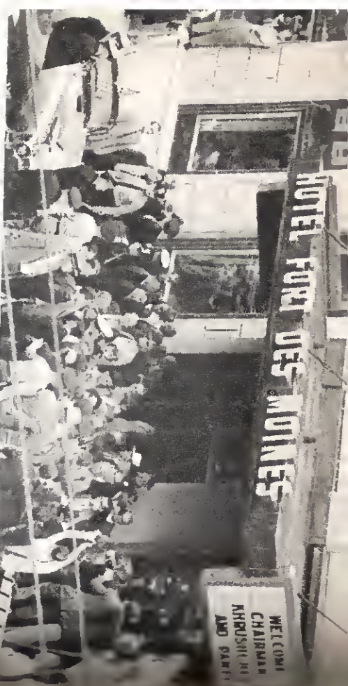
Khrushchev speaking to reporters in Des Moines.

construction. Our seven-year plan envisages an almost twofold over all increase in industrial and agricultural output, while in many important branches the increase will be several times greater. In the field of agriculture we plan an annual output of 164 million to 180 million tons of grain, 76 million to 84 million tons of sugar beet not less than 16 million tons of meat, and 100 million to 105 million tons of milk. The Soviet people are confident that we shall not only reach these targets, but even exceed them. In 1958, already, the Soviet Union surpassed the United States in over-all output of milk especially of butter, and hopes to overtake and to outstrip the United States in the output of these items per capita within the next few years. Our country produces more wheat, sugar beet and wool than the USA. But I do not think this does any harm to the United States or to the farmers of Iowa.