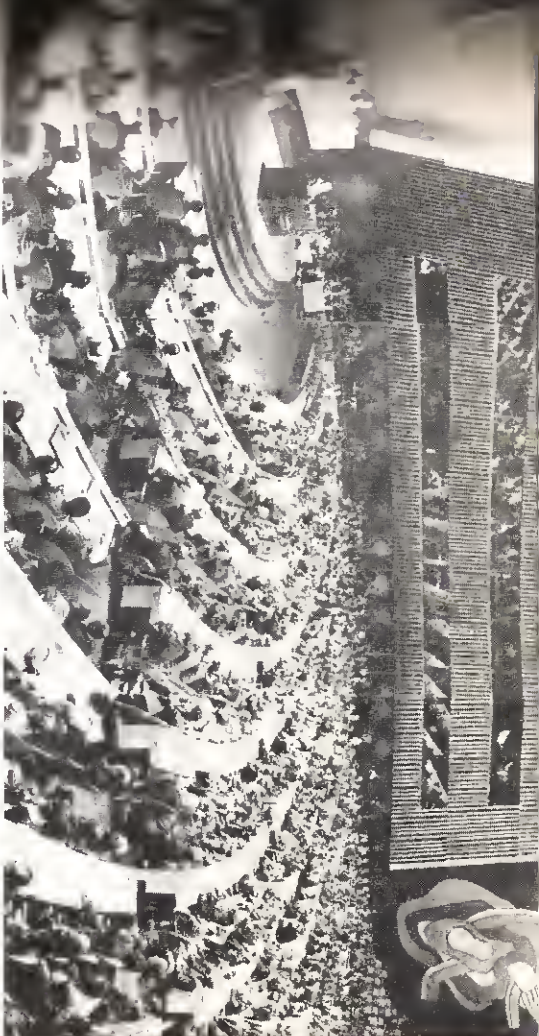
N. S. Khrushchev speaking at the 14th session of the UN General Assembly on September 18.

The tension in international relations cannot continue forever. Either it will reach a point where there can be only one outcome—war—or, by their joint efforts, the states will succeed in ending the tension in time. The peoples expect the United Nations to redouble