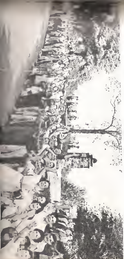
Turnout to welcome the head of the Soviet government on the road to Pittsburgh.

Your country has attained a high level of industrial development. The rapid development of industry in the United States of America astounded the whole world and aroused admiration and