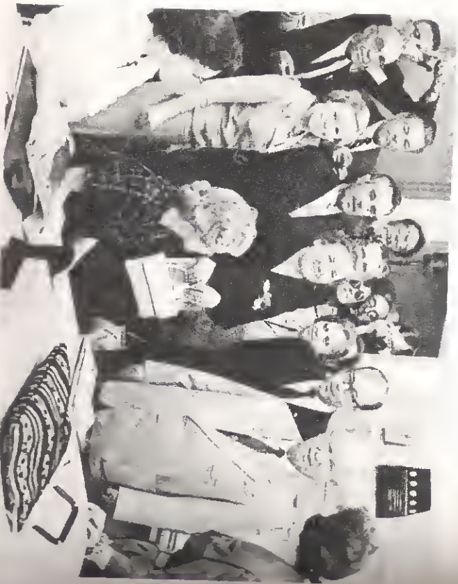
Photo shows N. S. Khrushchev and his wife Nina Petrovna (center) talking with Iowa University students in Arnes.

American farmers, colleagues of yours, who have visited the Soviet Union, say that there are many points of interest in our country in the development of science, in biological selection, in the cultivation of industrial crops and in livestock breeding. I am sure that your farmers and specialists could make good use of many of the Soviet achievements in both practical farming and the applied natural sciences. And you, too, have much that is valuable and instructive. Soviet specialists who have visited the USA speak of your great achievements in corn cultivation and in poultry raising. You obtain the greatest increase in poultry weight per unit of feed—one kilogram increase to about two and a half kilograms of feed. We must learn from your experience. We pay due tribute to the knowledge, industry