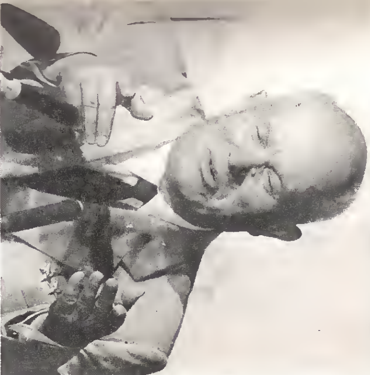
NIKITA S. KHRUSHCHEV Chairman of the Council of Ministers of the USSR