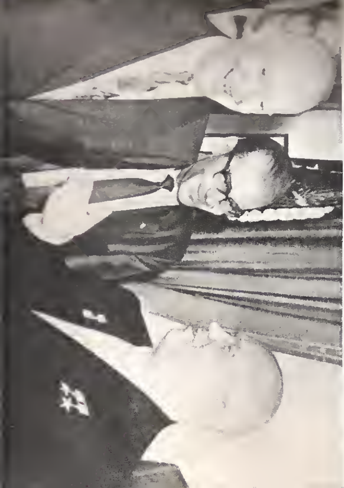
Khrushchev, Khrushchev's wife and Khrushchev's daughter are seen laughing heartily as Soviet Premier Khrushchev answers questions during a picture-taking session at the White House.

I am pleased to meet prominent U.S. journalists at the beginning... I have had more than one occasion to see that journalists