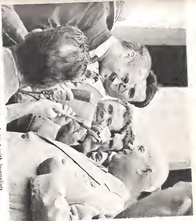
Photo shows N. S. Khrushchev chatting with journalists after his visit to the Lincoln Memorial in Washington.

Now a few words about trade. I have already said at the Economic Club that our economy suffers nothing from the fact that trade is not developing between the USA and the USSR. But if there were