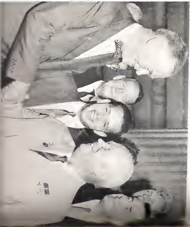
Secretary of State Christian A. Herter shakes hands with his luncheon guest, Soviet Premier Khrushchev, as the latter arrives at Anderson House in Washington. In center is Khrushchev's interpreter, Oleg Troyanovsky.

examples—all present here know what I have in mind. However, all this should not prevent us from improving relations between our countries. An agreement which would correspond to the interests of both countries can and should be found, if there is a desire to do this in