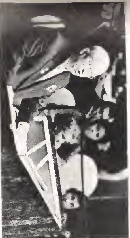
Speaking at the U.N.

The situation in the world today is a dangerous one. Various military alliances are in existence and the arms race never stops for a moment. So much inflammable material has accumulated that a