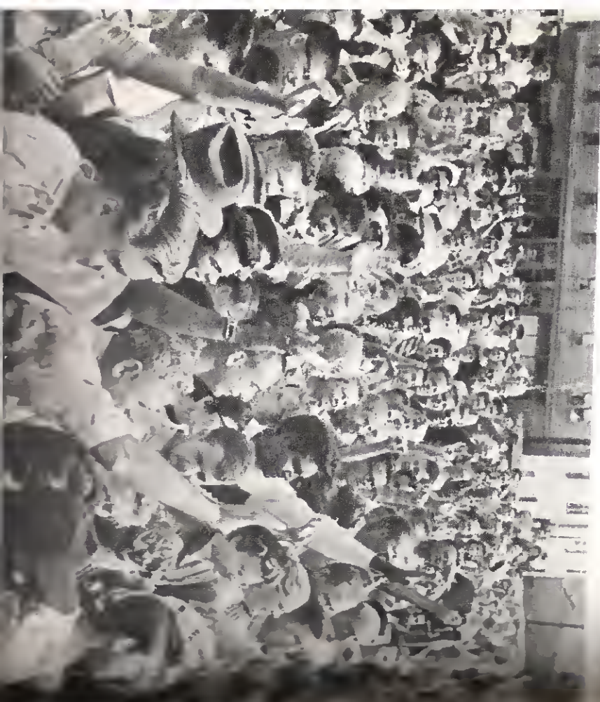
Khrushchev greets citizens of San Luis Obispo on the way from Los Angeles to Moscow

"But we aren't waiting till an agreement is reached on disarmament," N. S. Khrushchev said. "We are giving the underdeveloped countries substantial economic aid right now. On the one hand, we