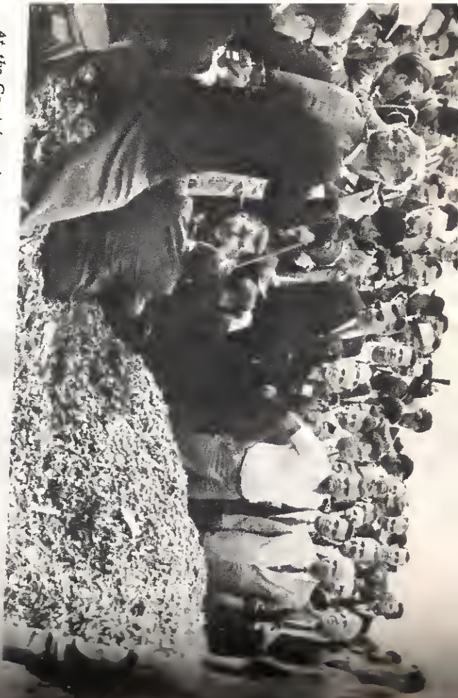
At the Garst farm in Iowa.