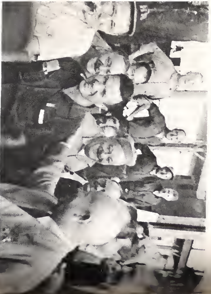
Speaking with workers at the Mesta Machine-Building Plant in Pittsburgh

You, ladies and gentlemen, like your capitalist system. We are very fond of the socialist system which our people have built up. You say that your system is better. Well, stick to your opinion until you are convinced of the opposite. We tell you sincerely that the socialist system is better. It provides better conditions for the development of the productive forces and, consequently, can do more for the progress of economy and culture. So far you do not admit this, although the advantages of socialism have been very well demonstrated by the example of the Soviet Union and other countries. Different views on the social system must not prevent us from co-operating. You like capitalism so have it your own way—live under capitalism, continue riding your old horse. We are mounted on a new, fresh, socialist steed, and it will be easier for us to overtake and outstrip you. But this is a question of the economic competition between the two systems. If we take the path of peaceful competition, it will be to the advantage of all nations, because there will be no