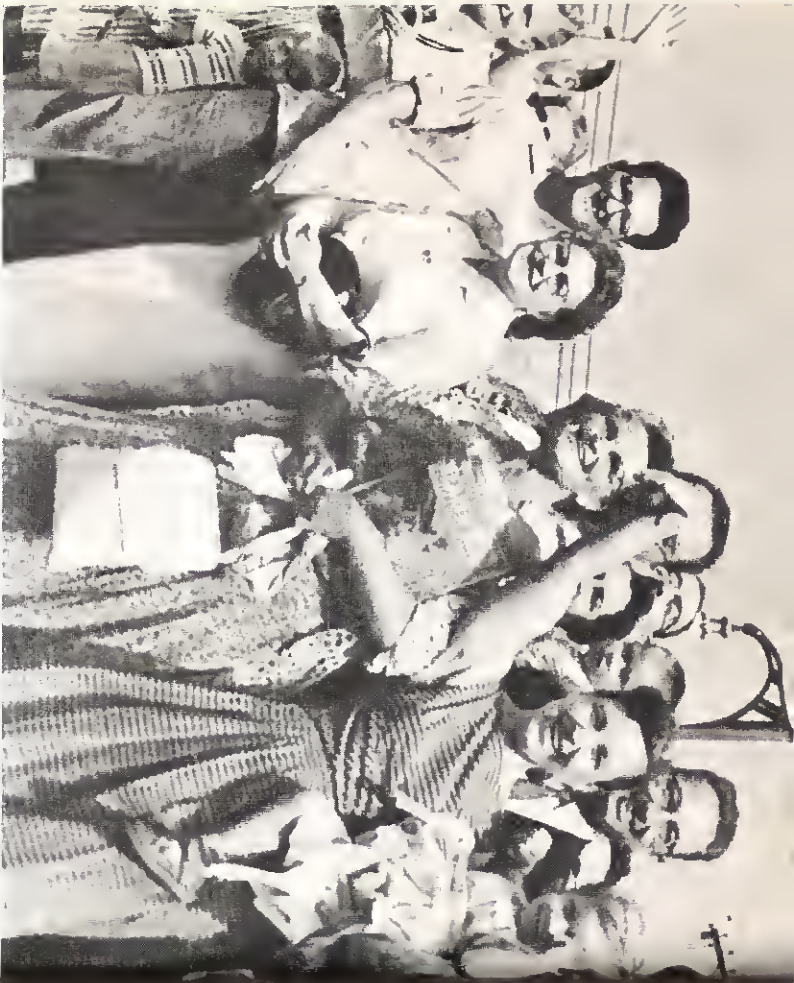
Cheers along the road for Chairman of the USSR Council of Ministers Khrushchev.