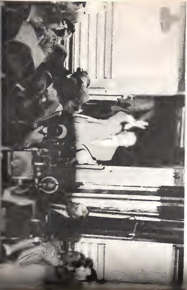
Send-off at the railway station in Washington.

pleased with me. I cannot speak for them. But I am pleased, and I think that makes a half success. ( Animation. ) If the Senators are pleased with me, I would take that to be a complete success, and I don't know if they are.