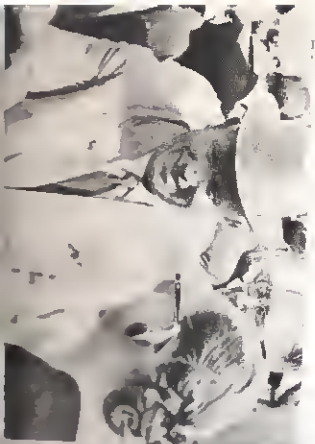
Khrushchev talking with Americans on the Garst farm in Iowa.