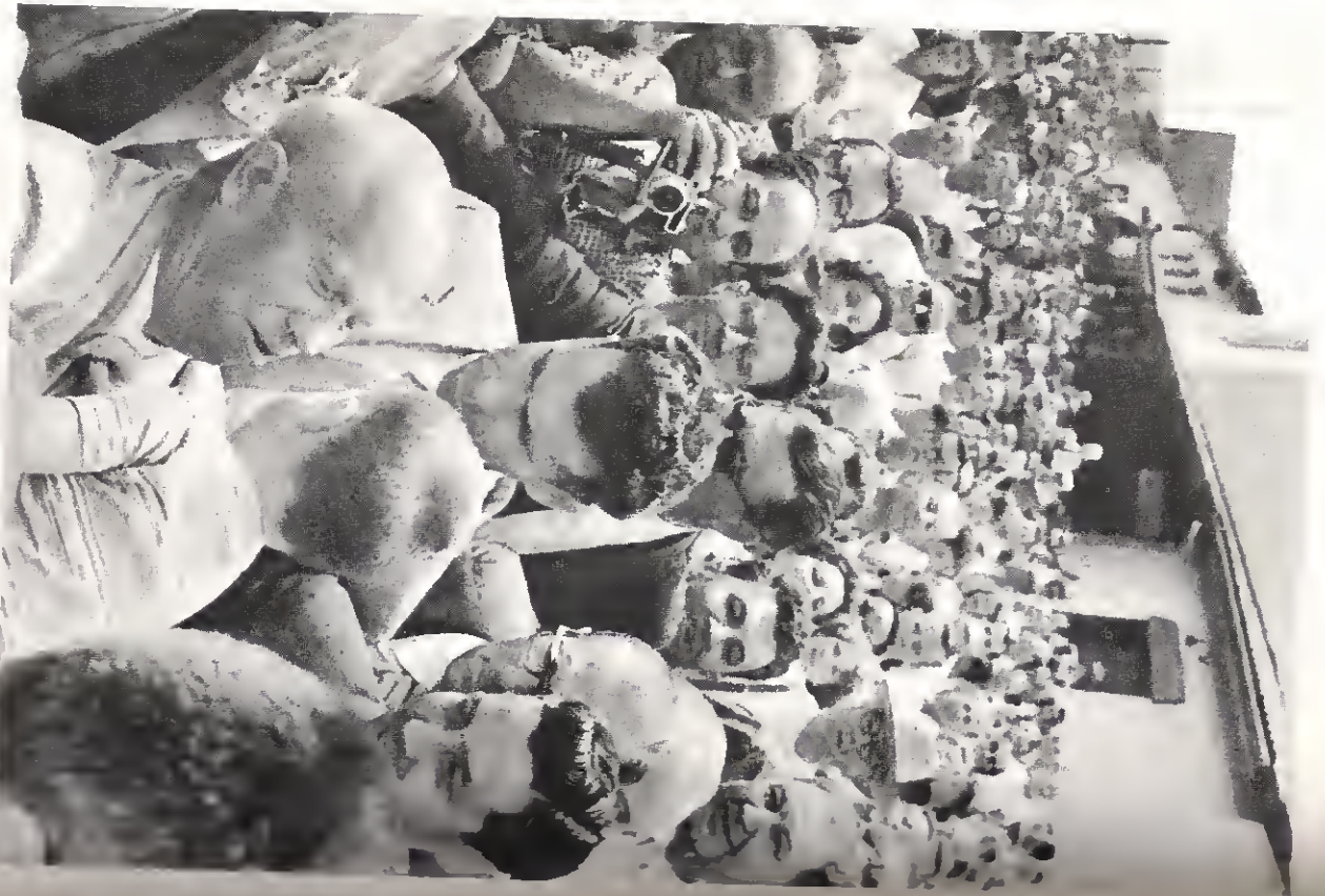
Khrushchev is seen here at the San Luis Obispo station on the way from Los Angeles to San Francisco.

th in partner, we should adhere to the right principle. If you palm it some bad goods on him today, he will stop buying them from you. The rule we stick to is this: You offer us your "merchandise," we however and buy what we need. We offer you something in turn, and you buy what you like. If you don't like it, you don't have to buy it. (Laughter, applause.)