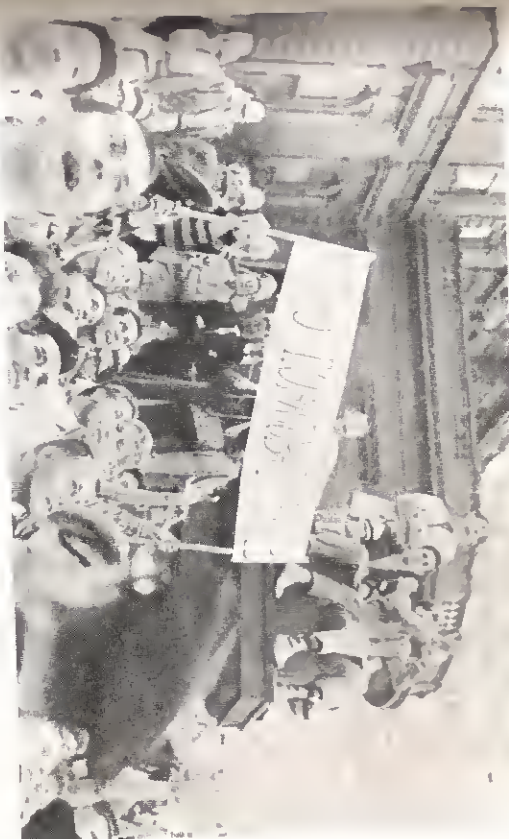
Citizens of San Francisco welcoming Khrushchev.

Some of the unionists then contended that the Soviet Union was reluctant for some reason to expand Soviet-American cultural relations. N. S. Khrushchev retorted that false assertion. He stressed that in reality it was the American side which was stalling, and