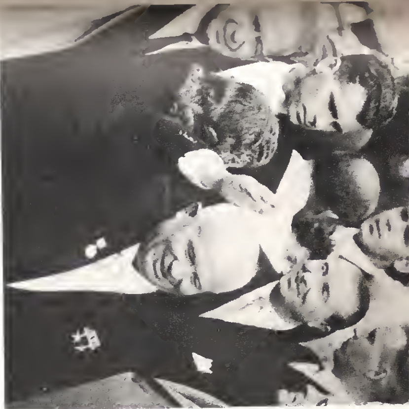
Leaving the session hall of the United Nations General Assembly after delivering the speech on general and complete disarmament.

I know that you like capitalism, and I don't want to dissuade you. I would simply do no more than humiliate myself if I were to take advantage of the hospitality of the biggest capitalists and begin moralizing to you about the superiority of communism. That would be a senseless thing to do before this audience. Let history be the judge! ( Prolonged applause. )