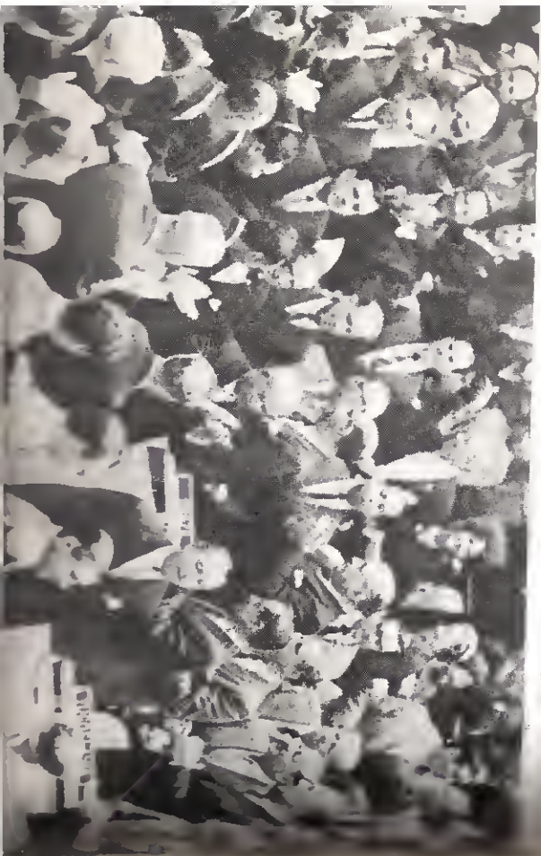
Delegates to the United Nations General Assembly greeting Khrushchev

by the numerous guests assembled in the largest room of the Astoria Hotel. The questioner did not seem to understand the thesis of peaceful coexistence of capitalist and socialist countries could be reconciled with the propositions of scientific communism about the inevitable triumph of communist ideas throughout the world.