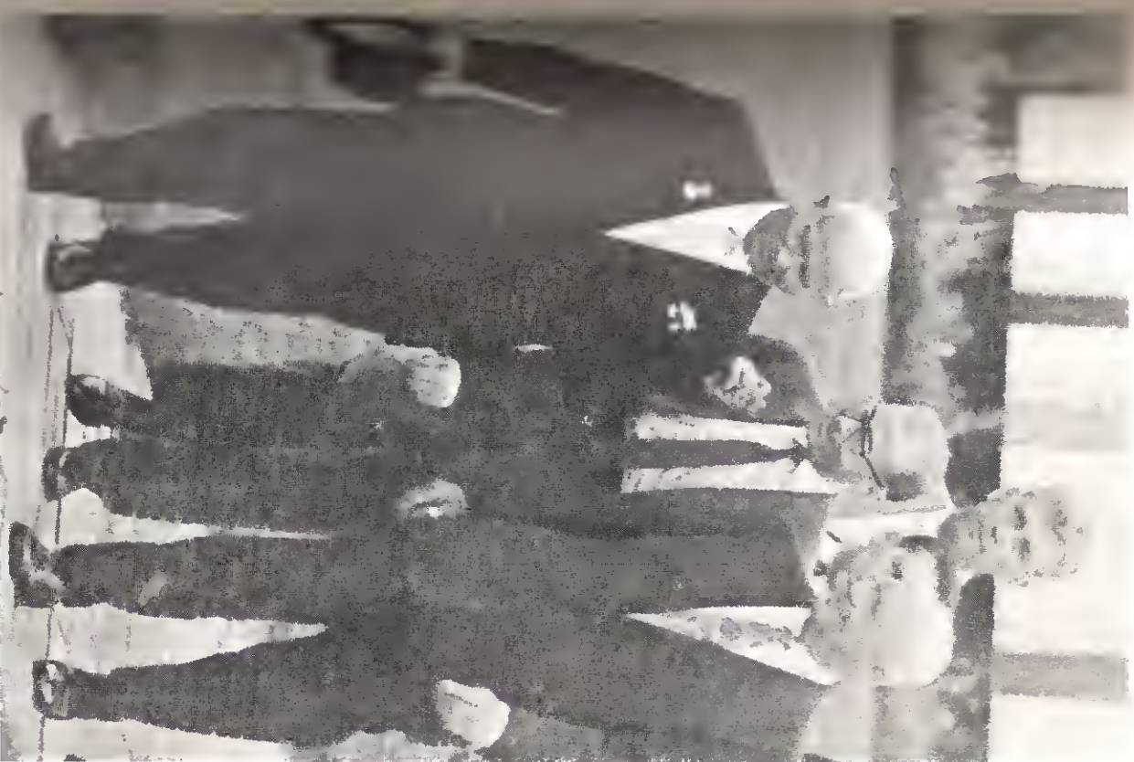
Khrushchev and President Eisenhower in Washington.

"Changes in social formation in human society are not a process that occurs in all countries simultaneously. When and how the socialist system of a country changes is the affair of its own people. Recognize