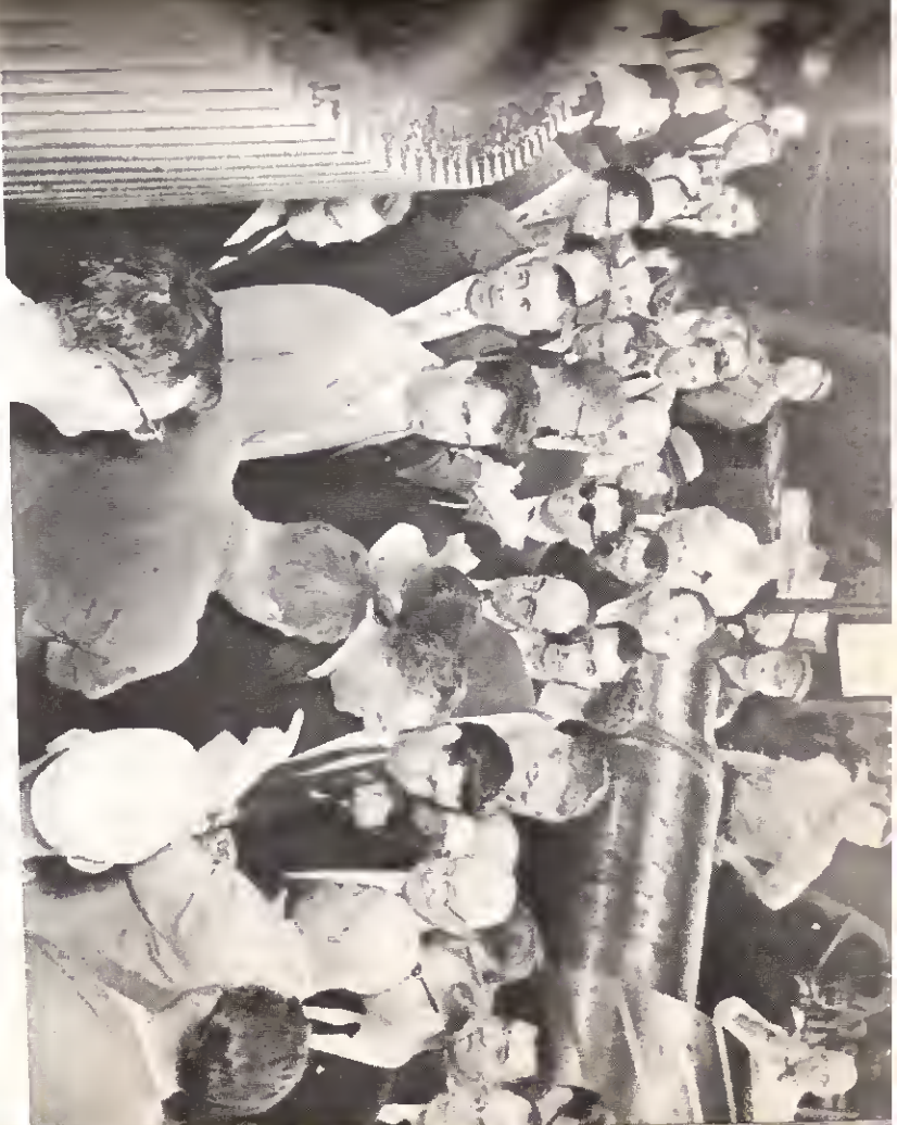
In a shop of the Mesta Machine-Building Plant in Pittsburgh.

As you see, we intend to take big strides forward and we are capable of doing it.