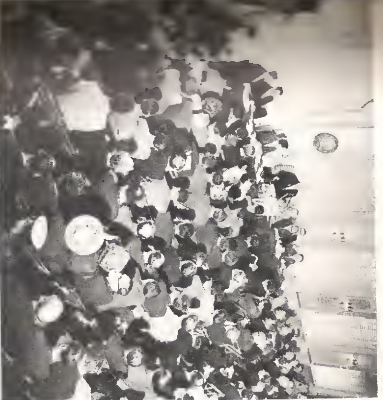
Thousands are speaking at the National Press Club in Washington.

The Soviet Union and the United States are faced with the choice either of having the latest achievements of scientific and technological thought—the discovery of the secret of the atom, the making of rockets and the penetration into outer space—placed at the service of man's peaceful future and prosperity, or of seeing them used for purposes of destruction and annihilation, so that, as a result, the earth will be covered with graves and ashes.