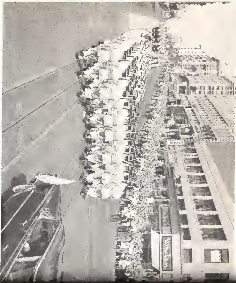
Welcome parade in honor of the arrival of Khrushchev in Washington.

ciple which statesmen of all countries should act upon in order to meet the hopes of the peoples.