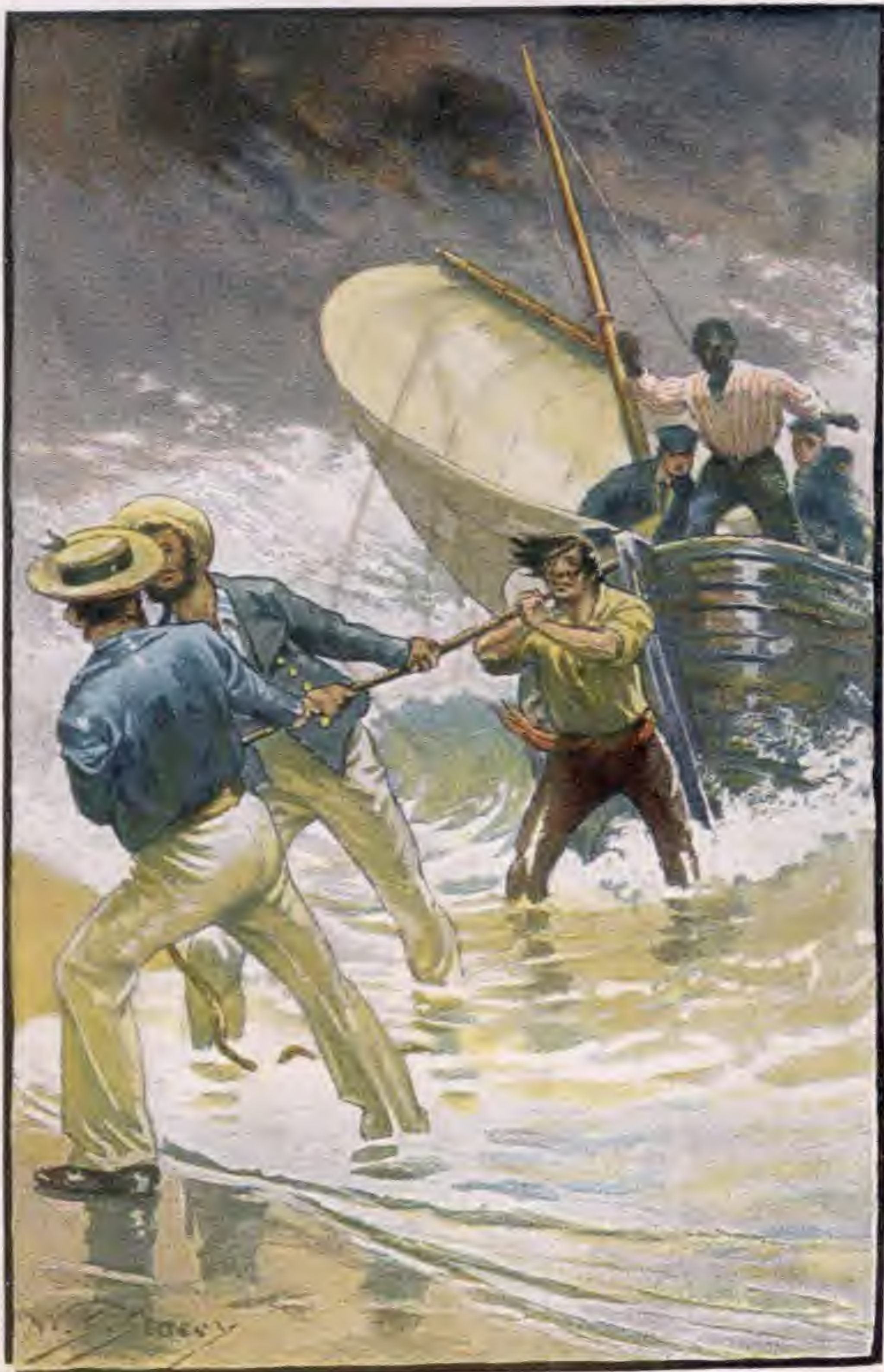
WE LEAPED OUT OF OUR SHATTERED BOAT, AND ENDEAVOURED TO HAUL HER UP."