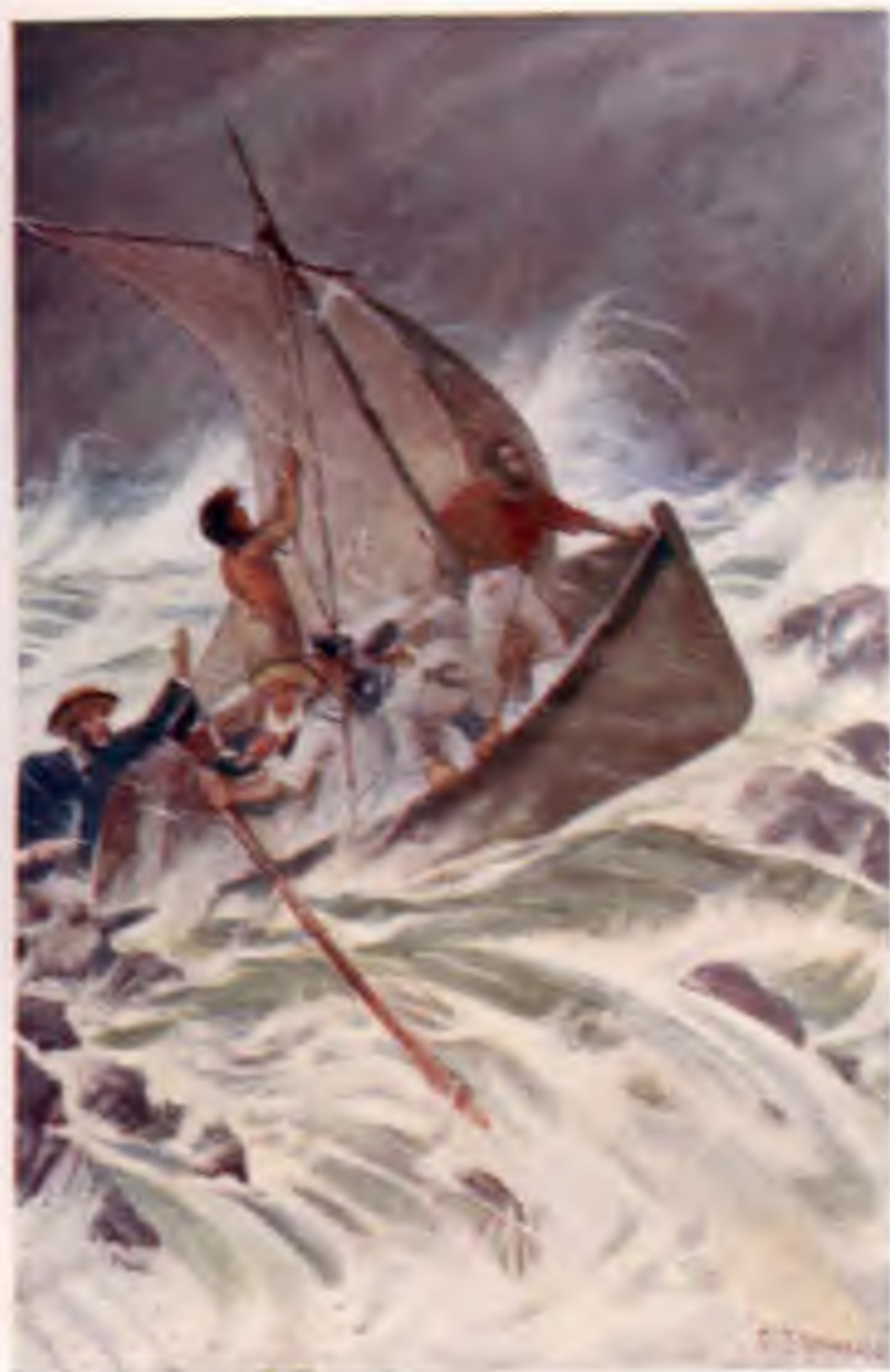
I felt that the boat was being hurled forward.