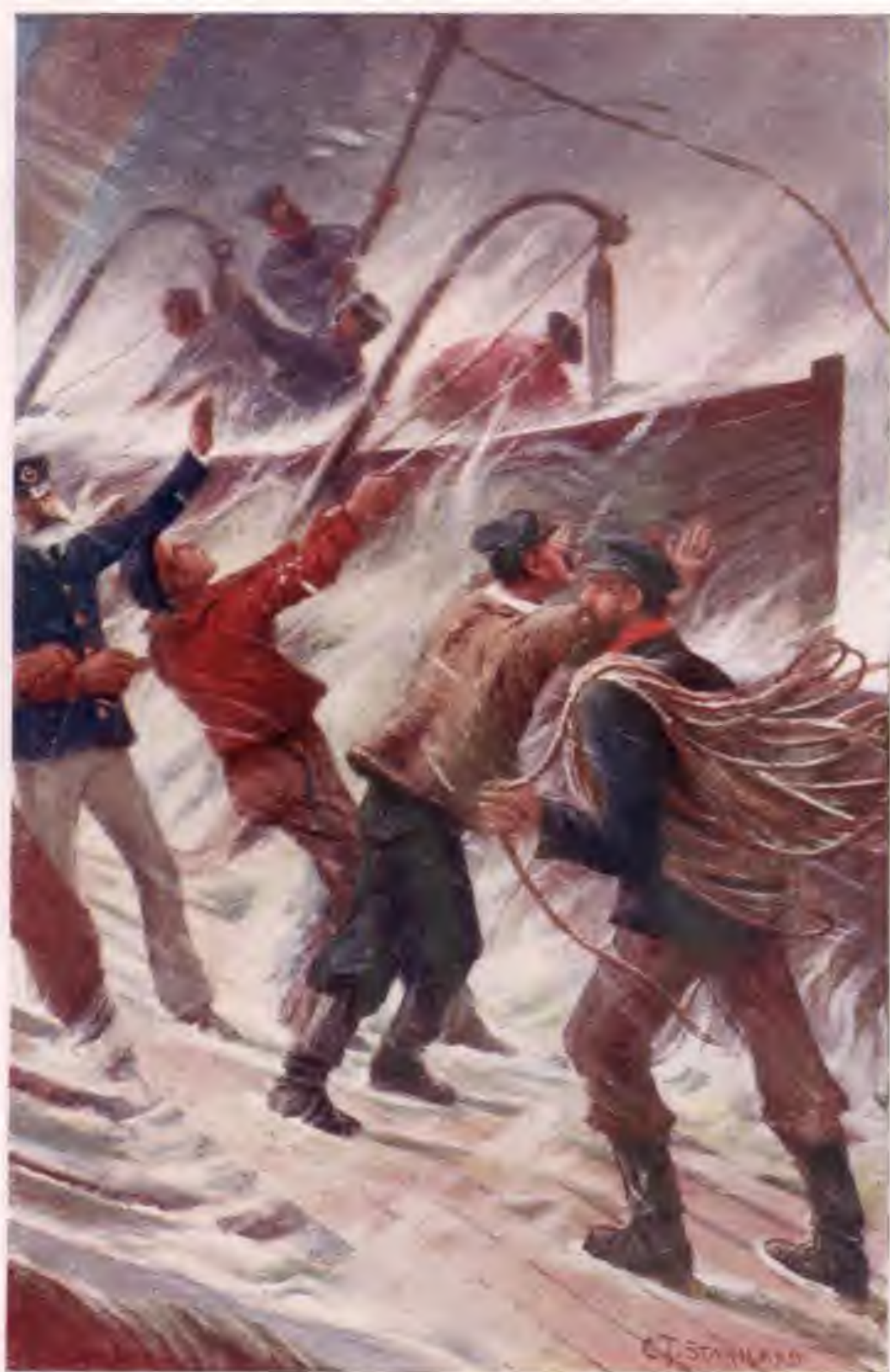
Getting the boats into the water.