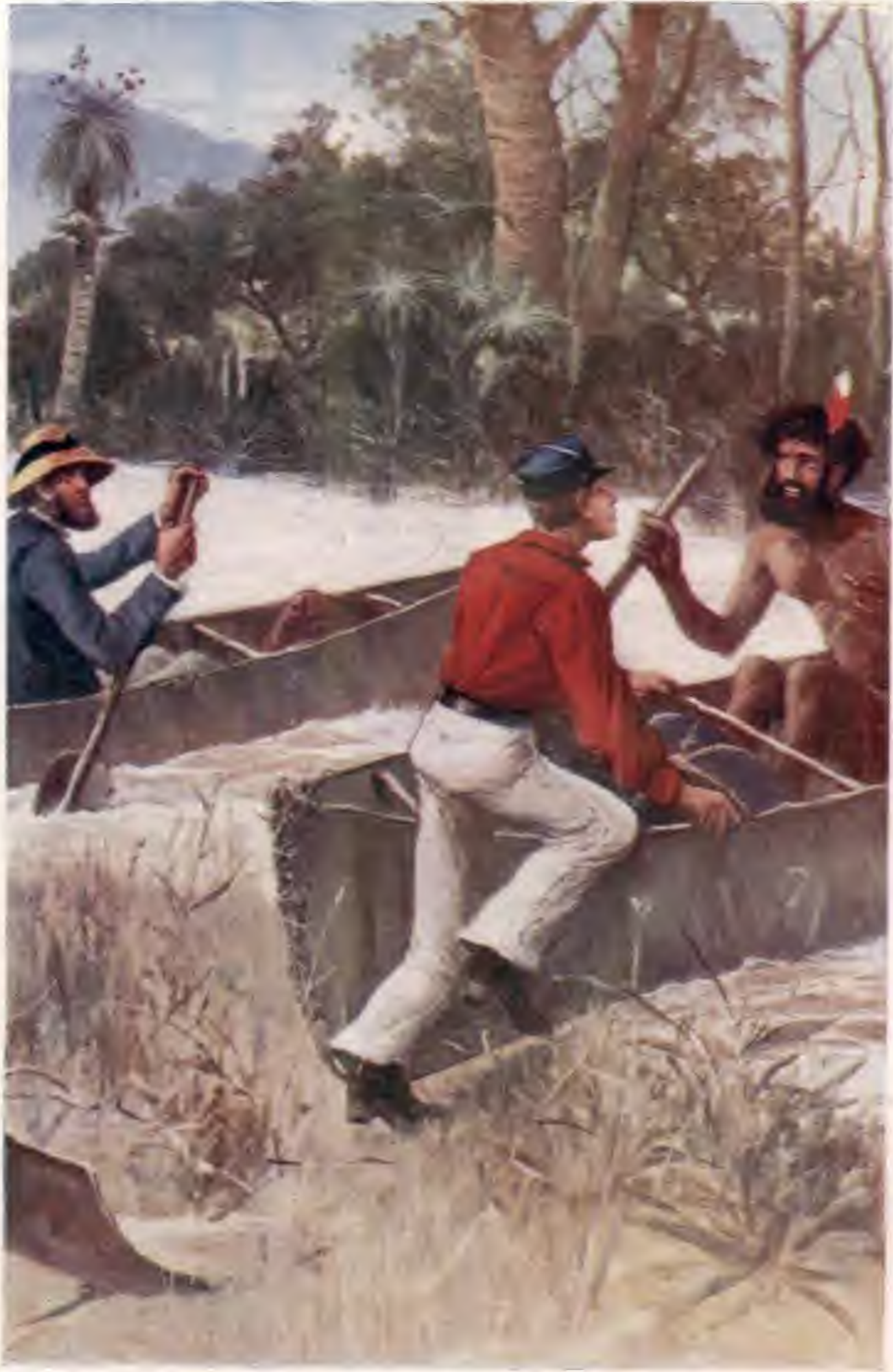
He beckoned me to follow.