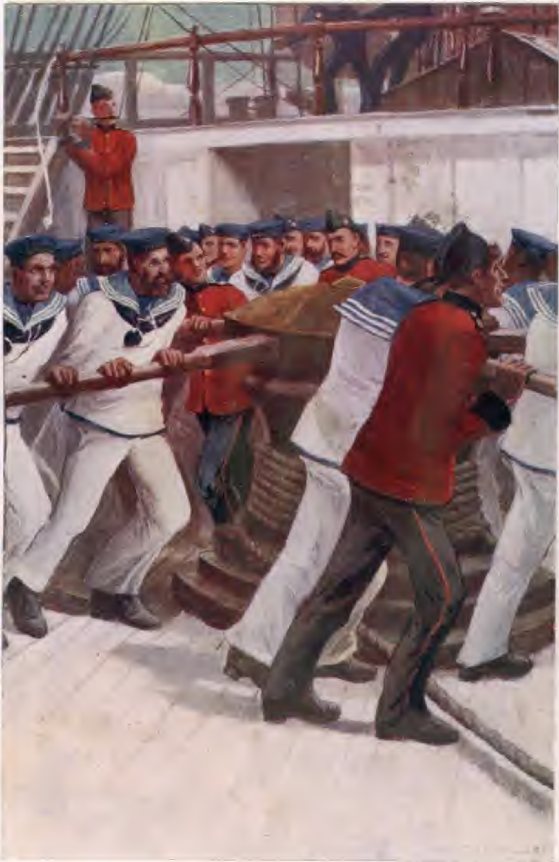
The men were going round the capstan to the sound of the merry life.