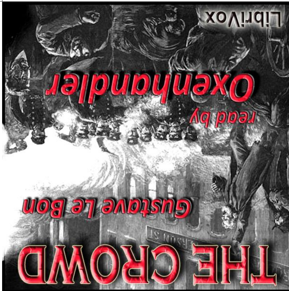
Cover image: Engraving of "the Haymarket affair", Harper's Weekly, May 15, 1886 Cover design for Librivox by Michele Fry

Easy Folding Instructions for this Origami CD case, including step by step photos, can be found here . Can also access from the LV Wiki page, CD Covers.