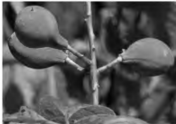
Figure 2. Fruits of Aesculus parviflora (dwarf horse chestnut). Northville, Suffolk Co.