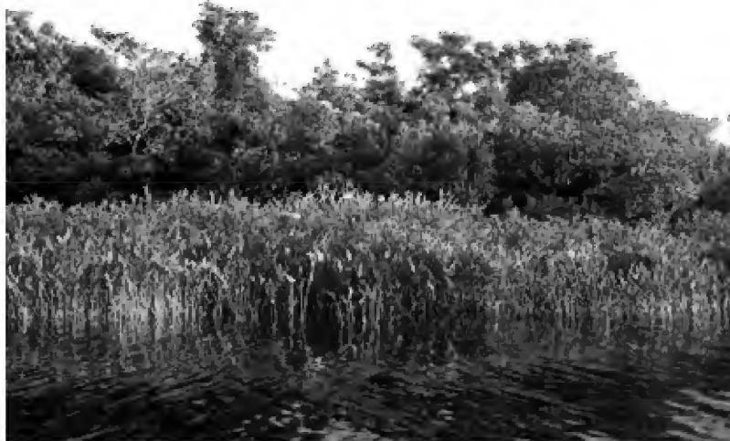
Figure 4. Persicaria setacea (swamp smartweed) and associated plant species ( Pontederia cordata in the foreground). Big Reed Pond, Suffolk Co. [Photo by V. Bustamante, 14 Aug 2014.]

Persicaria setacea ; swamp smartweed or bog smartweed (Polygonaceae, the Smartweed Family). (Fig. 4). Native. This smartweed is listed as rare in New York and can be difficult to distinguish from P. hydropiperoides (swamp smartweed). Victoria Bustamante has recently located a few colonies at Montauk, Suffolk Co., and reported (14 Sep 2015) that Persicaria setacea is at its finest when viewed from the pond in the late summer. It is an upright stout perennial peaking