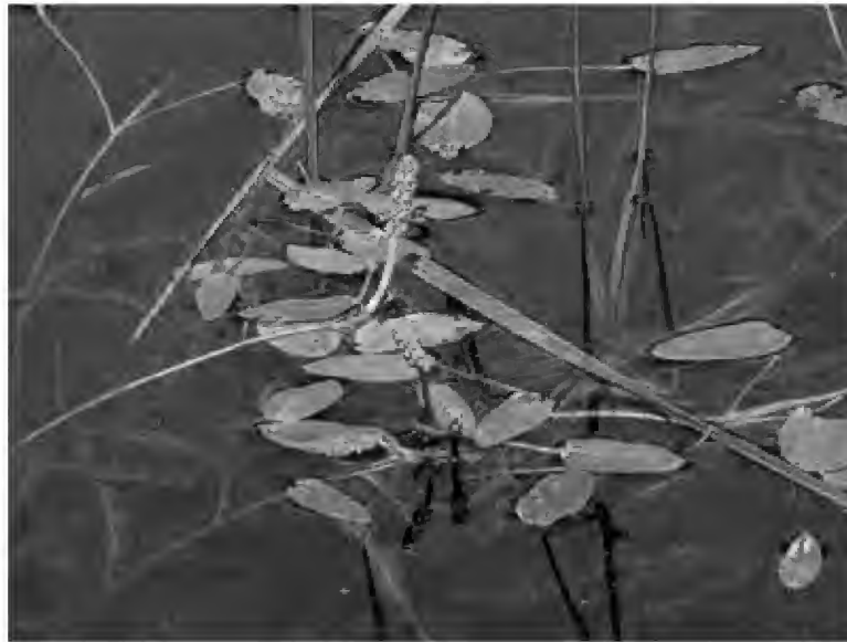
Figure 5. Potamogeton pulcher (spotted pondweed). Culloden Point Preserve, Suffolk Co. [Photo by V. Bustamante, 30 May 2015.]

pepperbush) backdrop and its creamy white inflorescences. In 2013, while studying Big Reed Pond in Montauk with a group of high school interns, Vicki noticed this smartweed and collected a sample in order to study it more closely at home. Because of its rarity, the following year in September 2014, she submitted samples to Steve Young who confirmed the identification. The ocrea differs from P. hydropiperoides (and other similar species) in that it is papery, brownish with stiff hairs on the surface and bristles that are 6-12 mm long. The overall growth habit is unique in that it is upright and stiff, rather than drooping, in nature. Vicki says that she has since found Persicaria setacea in other locations in Montauk, leading her to believe that locally it is not rare but perhaps uncommon.