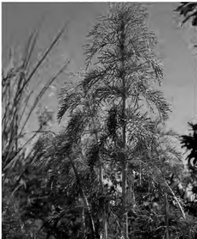
Figure 3. Eupatorium capillifolium (small dogfennel). Wildwood Lake, Suffolk Co.

Eupatorium capillifolium ; small dogfennel (Asteraceae, the Aster Family). (Fig. 3). Unknown nativity status. In 2013, Michael Feder found a clump of E. capillifolium along the upland, sandy margin of Wildwood Lake just south of Riverhead, Suffolk Co., and reported that the colony appeared to have “come in on its own and seemed like a natural occurrence, but given that it’s quite isolated from any other