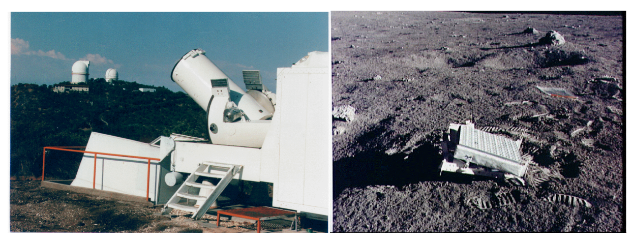
Fig 1 (a) Lunar laser telescope at McDonald Observatory. (b) Apollo 14 retroreflector array on Moon.

Lunar Laser Ranging (LLR) data are accurate ranges to retroreflector arrays on the Moon from several stations on the Earth. LLR is designed to obtain scientific information about the Moon, the Earth, the lunar orbit, and connected effects such as the nature of gravity (Dickey et al., 1994). Merkowitz et al. (2009) discuss advanced LLR for precision tests of relativistic gravity. Here we shall concentrate on the lunar science that comes from monitoring variations of lunar orientation and tides. Figure 1 shows a ranging observatory on the Earth and a retroreflector corner cube array on the Moon. Figure 2 shows the locations of the retroreflector arrays on the Moon. The Apollo 11, 14, 15 and Lunokhod 2 arrays are ranged operationally. The Lunokhod 1 array is lost. A broader distribution of LLR sites on the Moon would improve the sensitivity to science parameters determined by LLR. New LLR devices would be designed to reduce the scatter of the individual photons used to make a range normal point thereby reducing the number of photons and the duration necessary to make a very accurate normal point. LLR goals are that new retroreflectors be placed on the Moon and that range data be collected and analyzed .