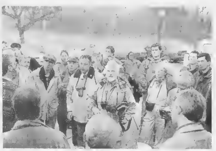
A CPIE member explained the efforts to save the curiews.