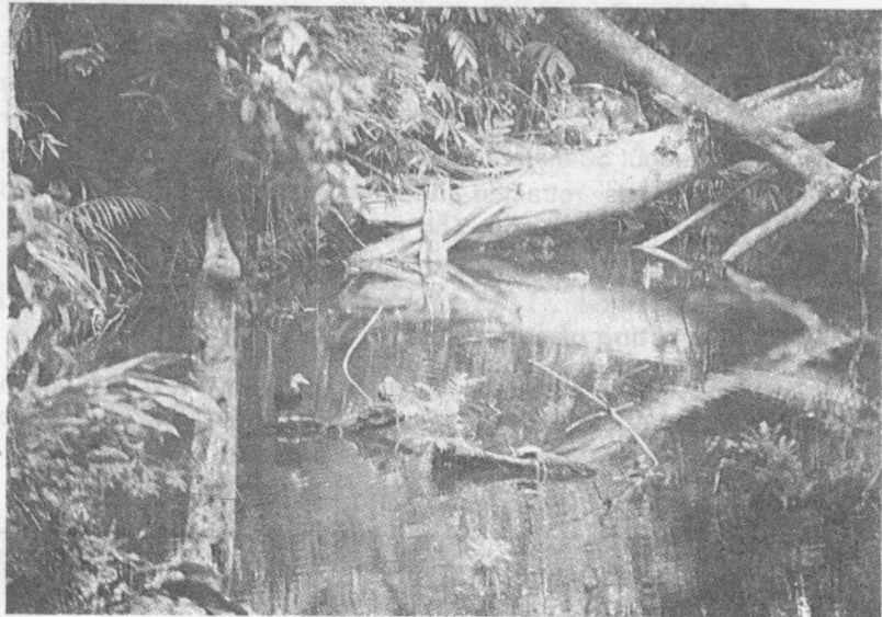
White-winged wood ducks in a jungle pool in Upper Dihing Reserve Forest (WB), Tinsukia District, Assam

The White-winged wood duck Cairina scutulata (Muller 1842) is among the most threatened waterfowl of the world. It is also among the most poorly studied. A bird of the tropical rain forest, it is threatened by habitat destruction and hunting. A detailed survey was carried out in one of its known strongholds in eastern Assam's Tinsukia district and adjacent areas of Arunachal Pradesh from 1992 to 1994 (Choudhury 1996). In these series of articles, I present details of field observations, wherever observed continuously for some time, datewise, not published elsewhere. Because in such details lie the actual joy of knowing the secrets of this little known and extremely rare duck, often called the 'Ghost Duck' in local parlance.