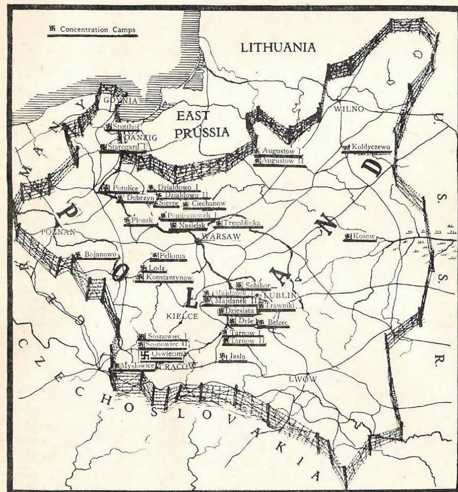
Map showing location of major concentration camps in Poland