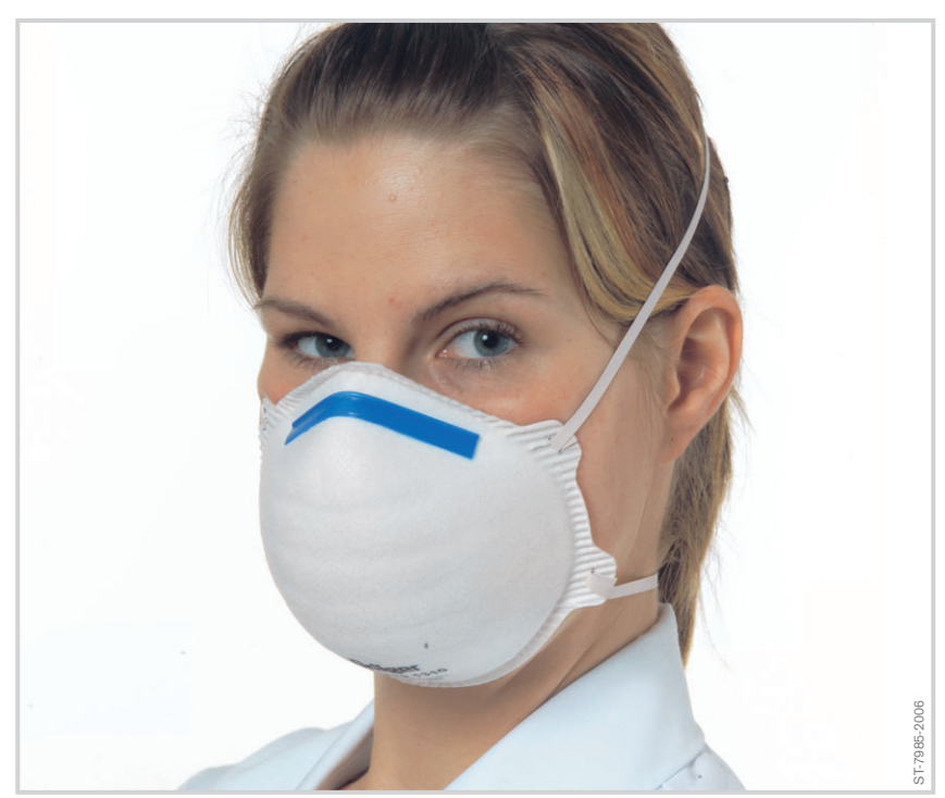
Ready for use.

Warning: Beards in the sealing area of the mask can cause leaks. Always make sure the mask forms a tight seal prior to entering a hazardous atmosphere.