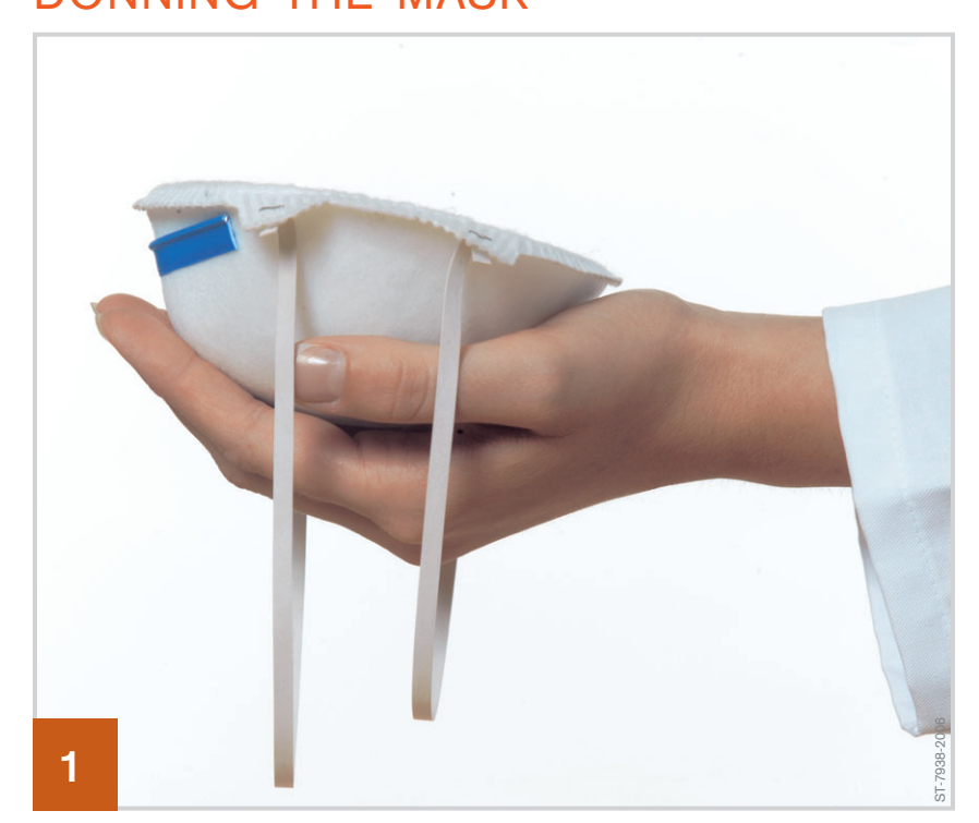
Hold the mask in your hand with the head straps hanging down.