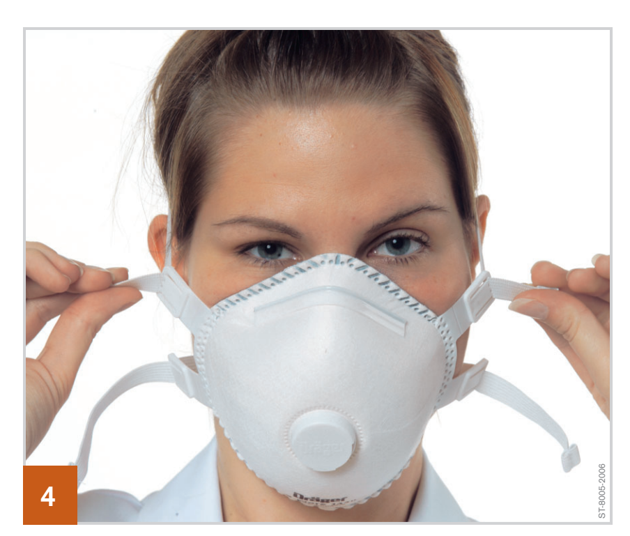
For masks with adjustable head-straps (Dräger X-plore 1330) adjust by pulling the end of each head-strap.