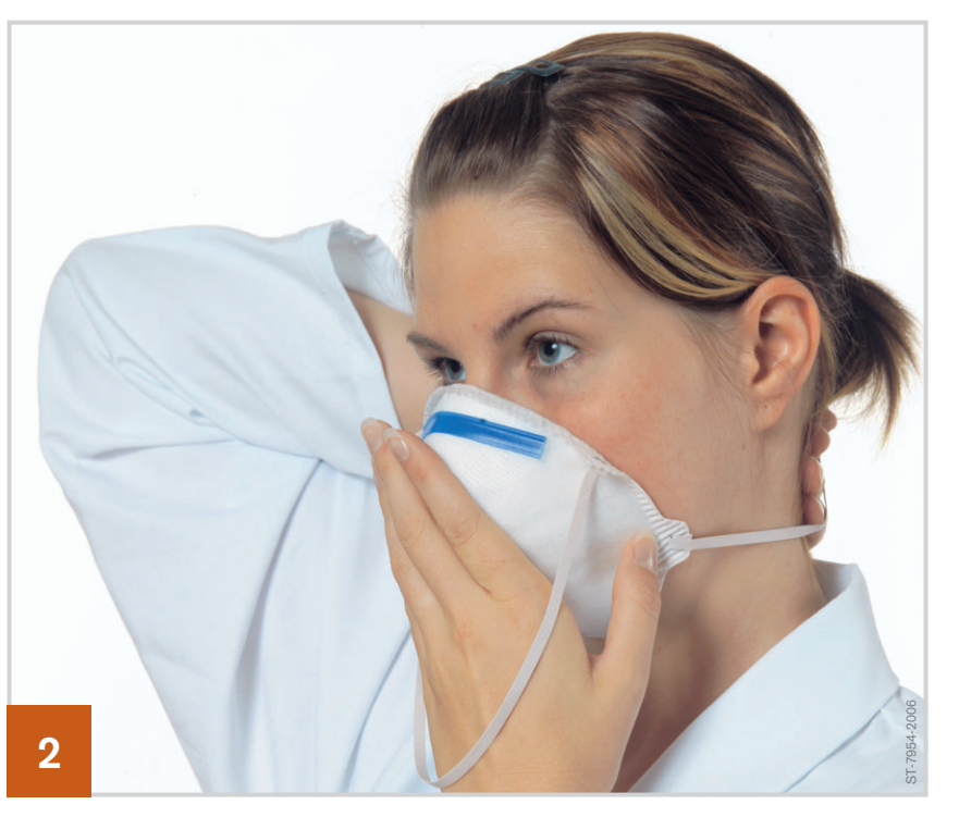
Position the mask under your chin and over your nose. Slip the short strap over your head to the back of your neck.