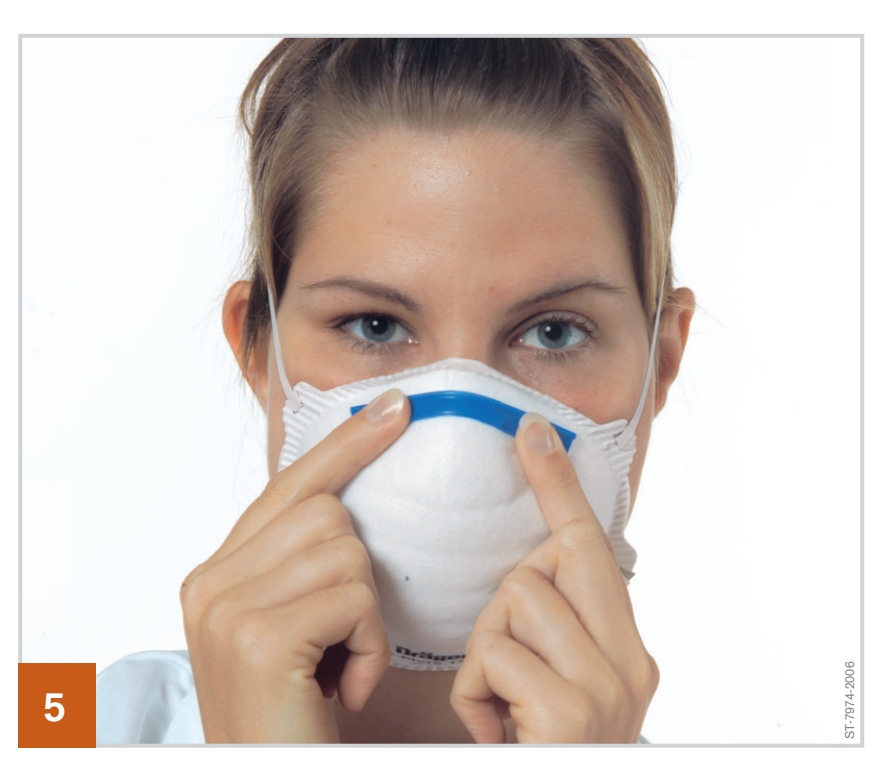
Adjust the nose clip to minimize leakage.