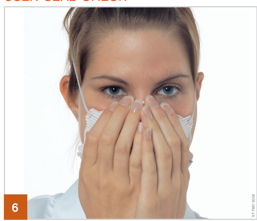
Cover the mask with both hands and exhale. The mask should inflate slightly. If any air escapes at the sides of the mask, readjust the mask until it fits properly and ensure that the nose clip is positioned correctly on your nose.