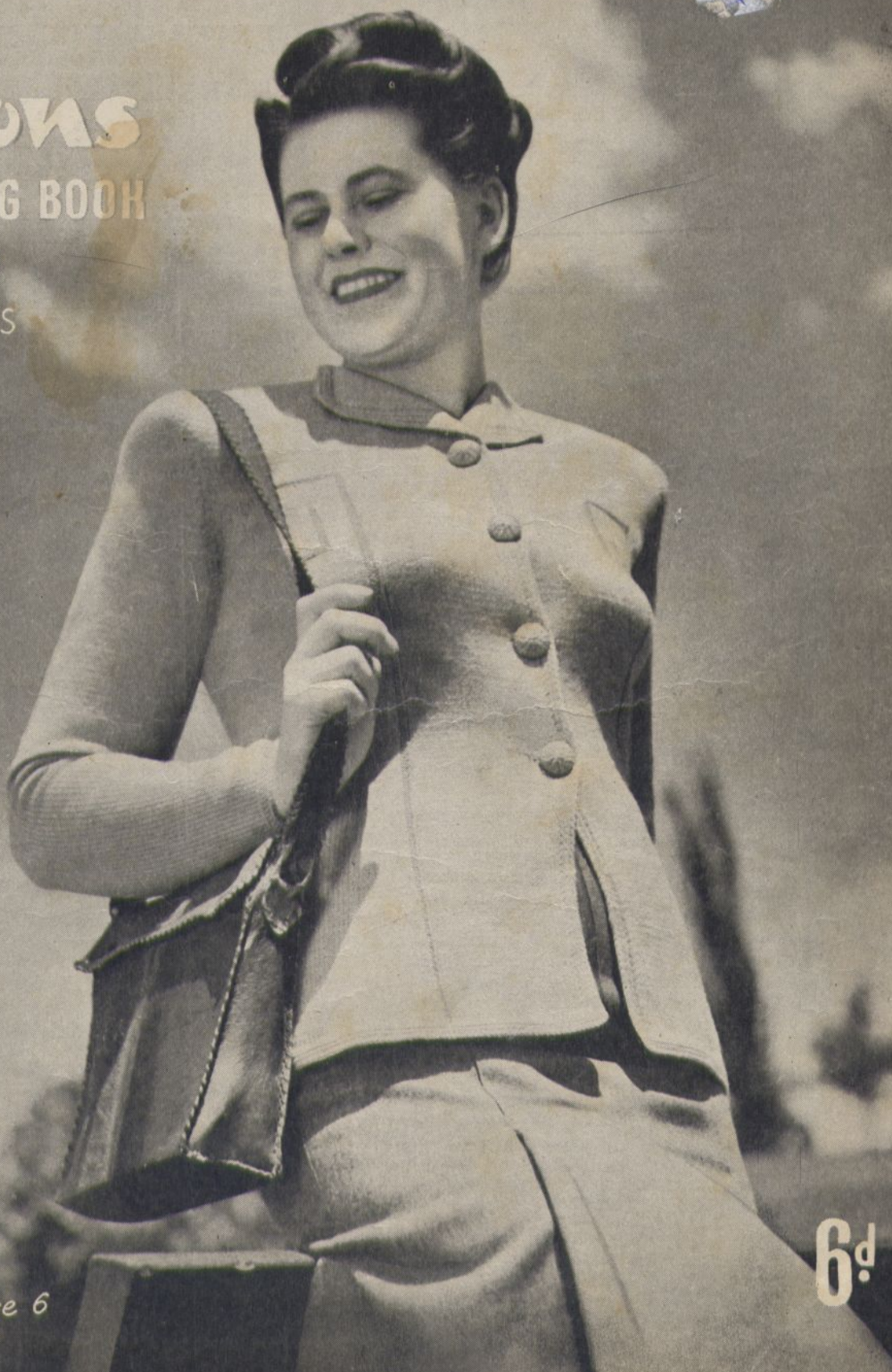
"ELLEN" See page 6