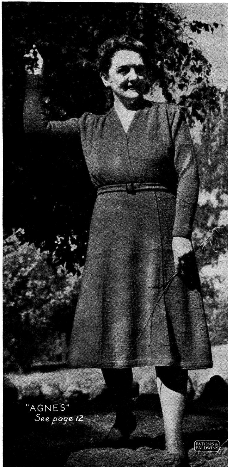
"AGNES" See page 12

12th row. —K.5, * P.1, K.7, repeat from * to last 11 sts., P.1, K.10.