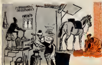
ILLUSTRATION BY HARRY W. HARRIS

When Moslem men want the company of women at a party they engage a couple of professional dancing girls. These professionals have a unique social position, not as